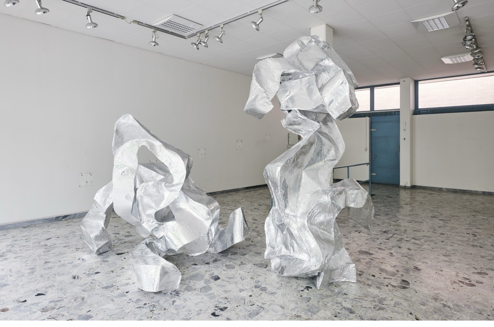
Find one's leg, 2023 Exhibition view Filiale, Basel (CH) Paper, glue and aluminium foil L: 170 × 220 × 160 cm R: 260 × 175 × 125 cm