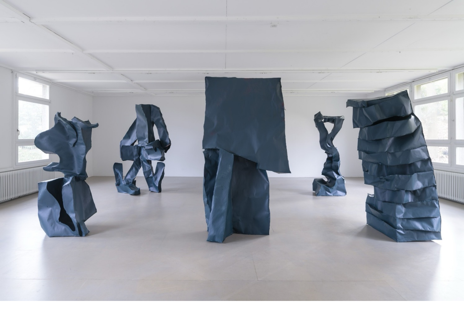
Same glasses, new view, 2020 Paper, glue and acrylic paint Exhibition view o.T, Luzern (CH) divers sizes