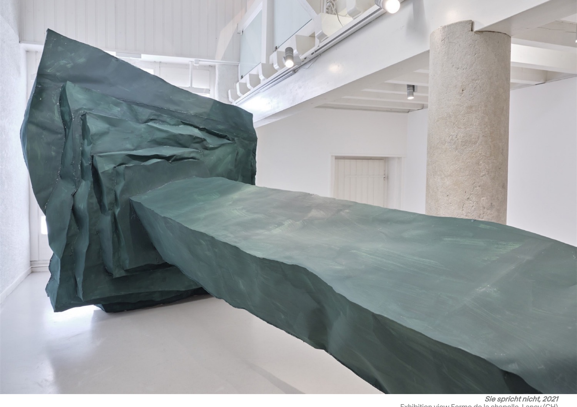
Sie spricht nicht, 2021 Exhibition view Ferme de la chapelle, Lancy (CH) Paper, glue, foam, paint and plaster 300 × 1400 × 250 cm