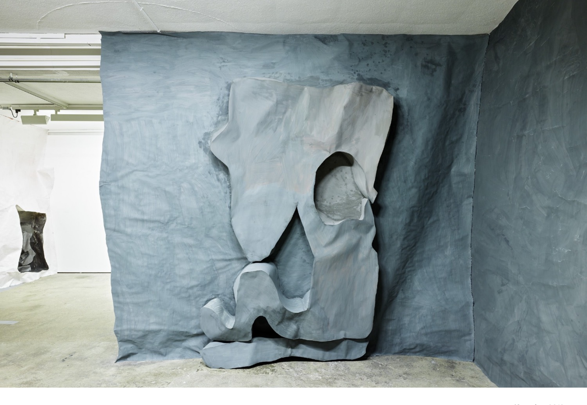
Komplex, 2019 Exhibition view Oxyd Kunsträume Winterthur (CH) Paper, glue, paint and pigments