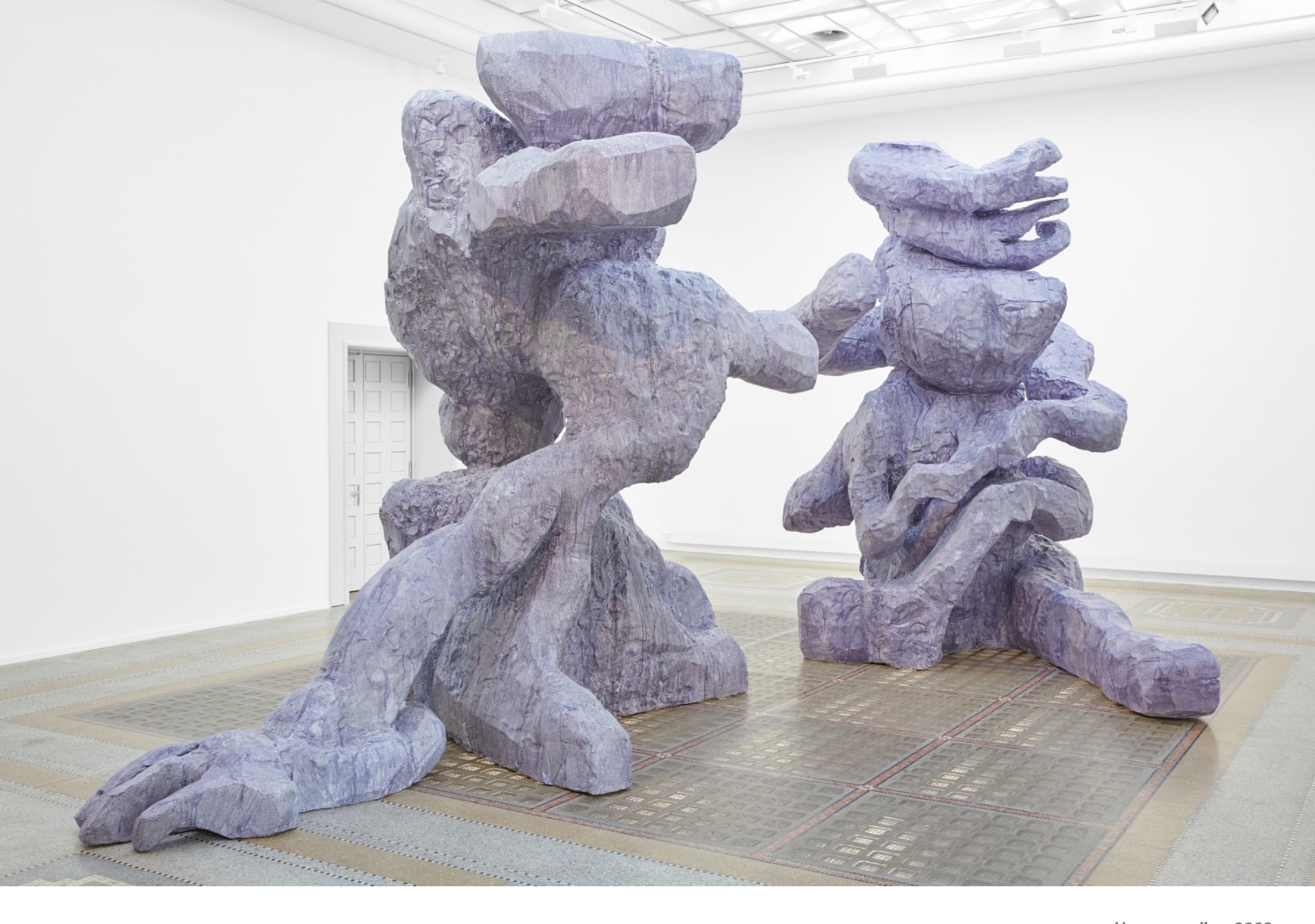
User ma salive, 2022 Exhibition view Musée des beaux-arts La Chaux-de-Fonds (CH) Foam, glue and acrylic paint each approx. 440 × 250 × 350 cm