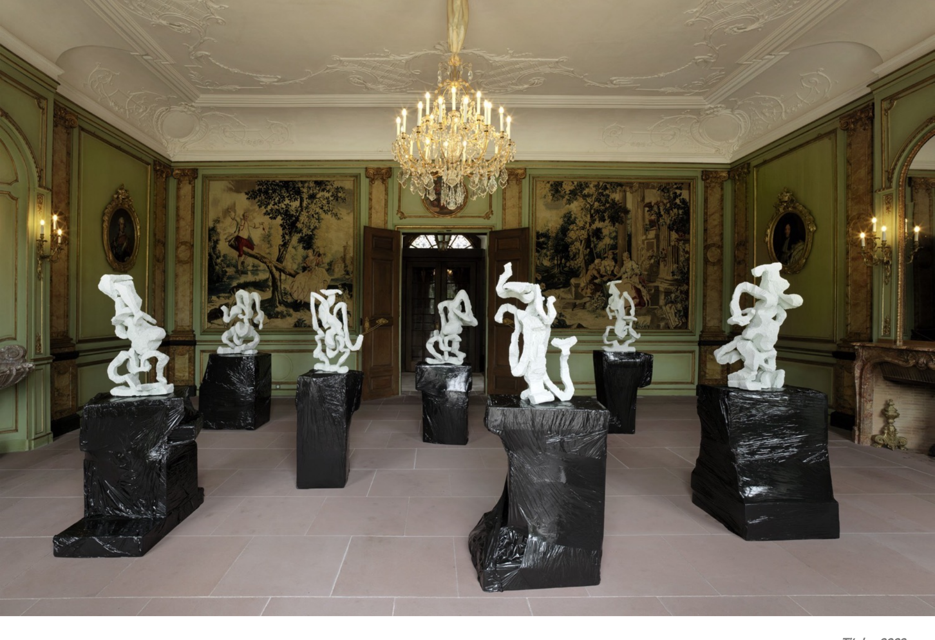
Titube, 2022 Exhibition view Villa Wenkenhof, Riehen (CH) series of 7 sculptures Polyurethane, glue, dispersion, plaster, dust and plastic film different sizes