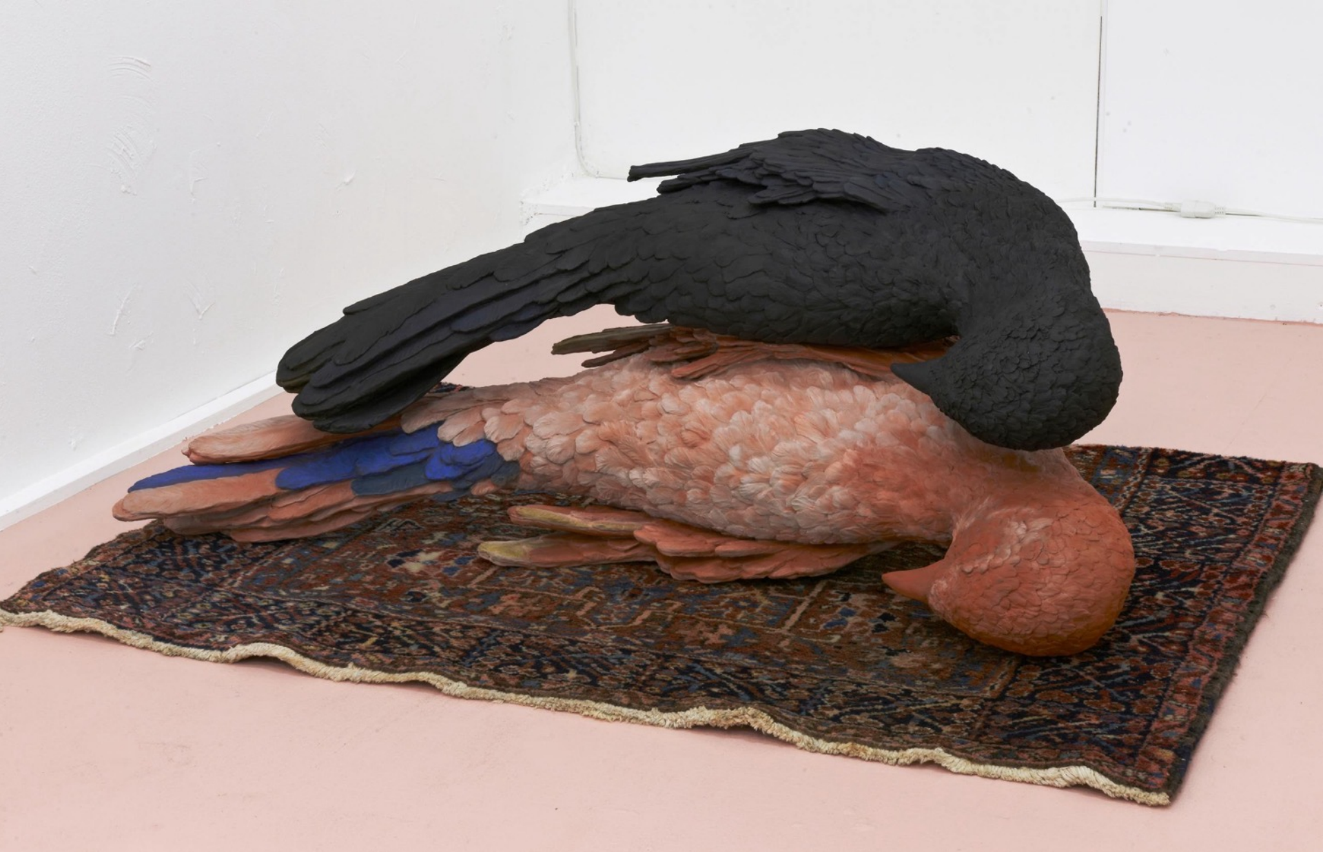
Deeper than beauty, 2011 Exhibition view at Stauffacherstrasse 79, Bern