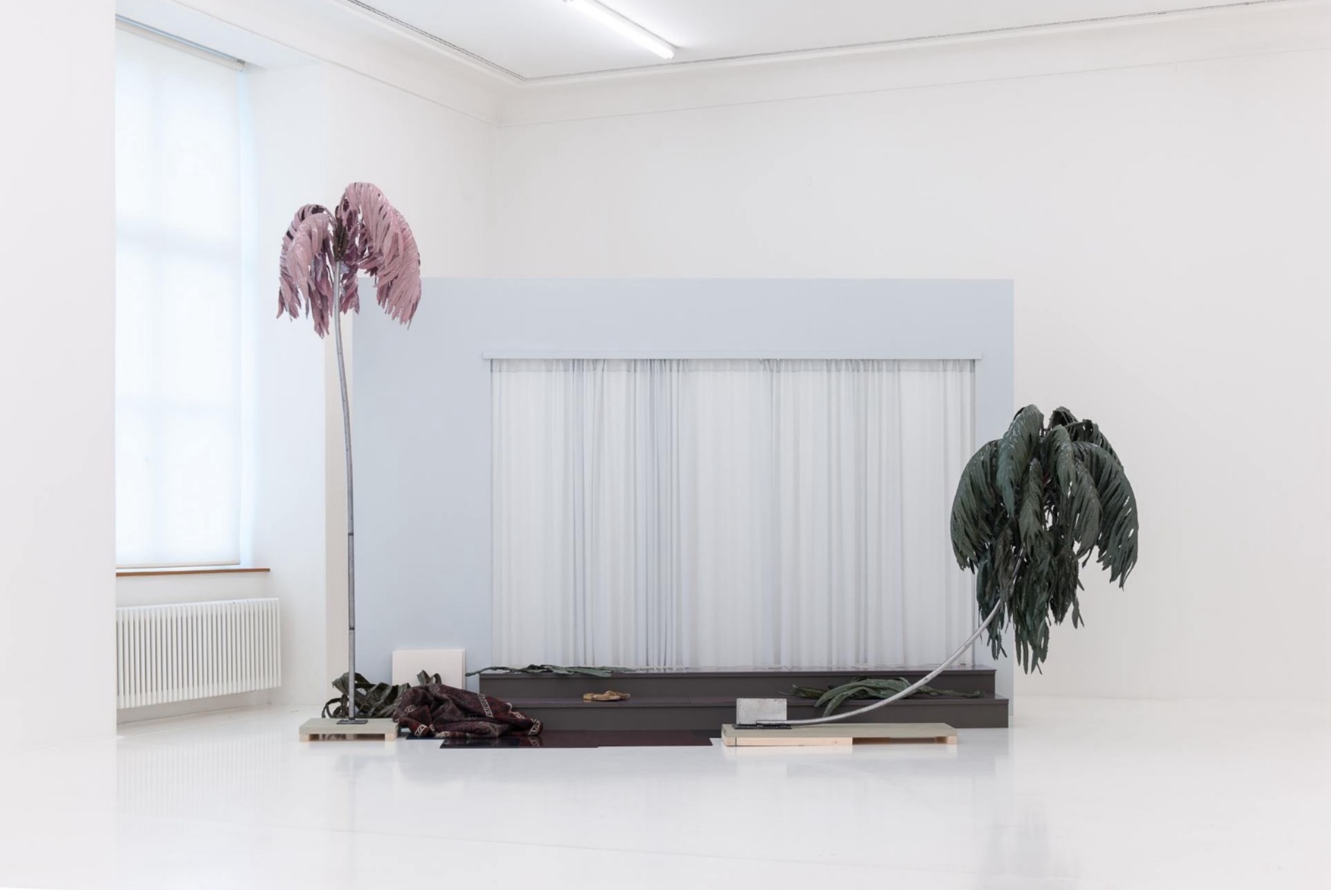
I'm just passing through - I don't live here, 2014 Exhibition view at Museum Helmaus, Zurich