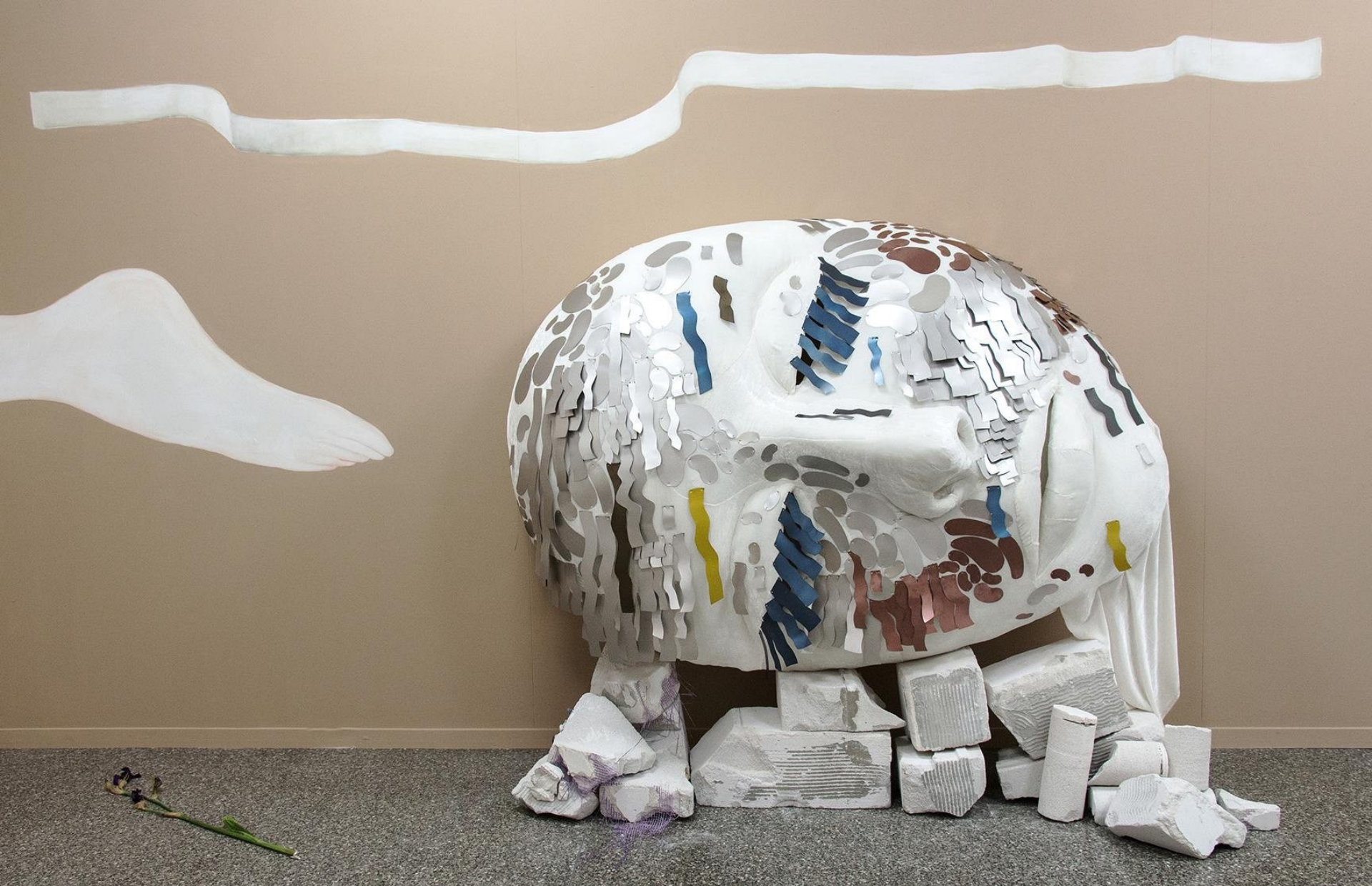
Semesterausstellung, 2018 Exhibition view at HKB Bern