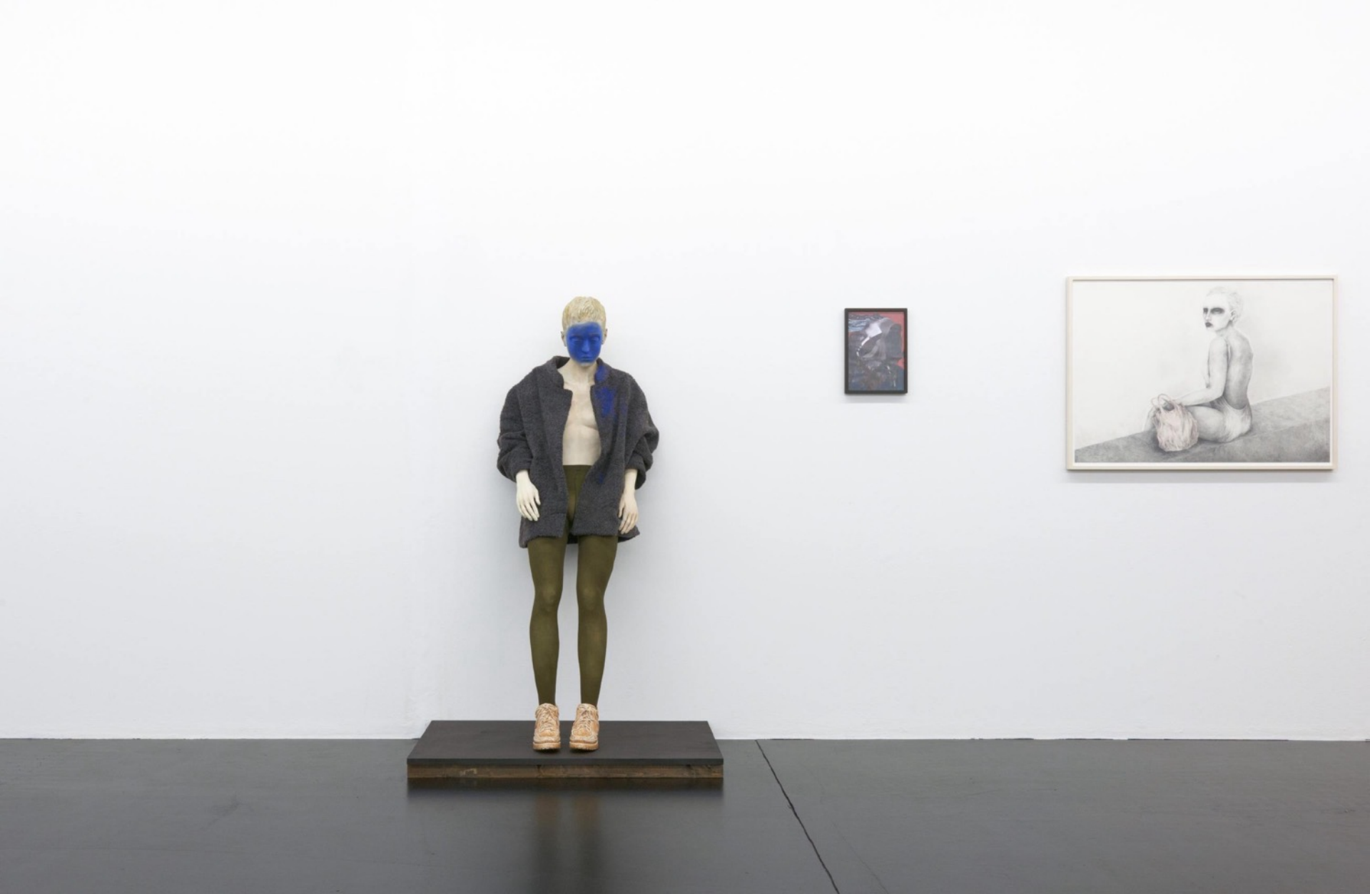
It's all about a golden key, 2012 Exhibition view at Gallery Nicola Von Senger, Zurich