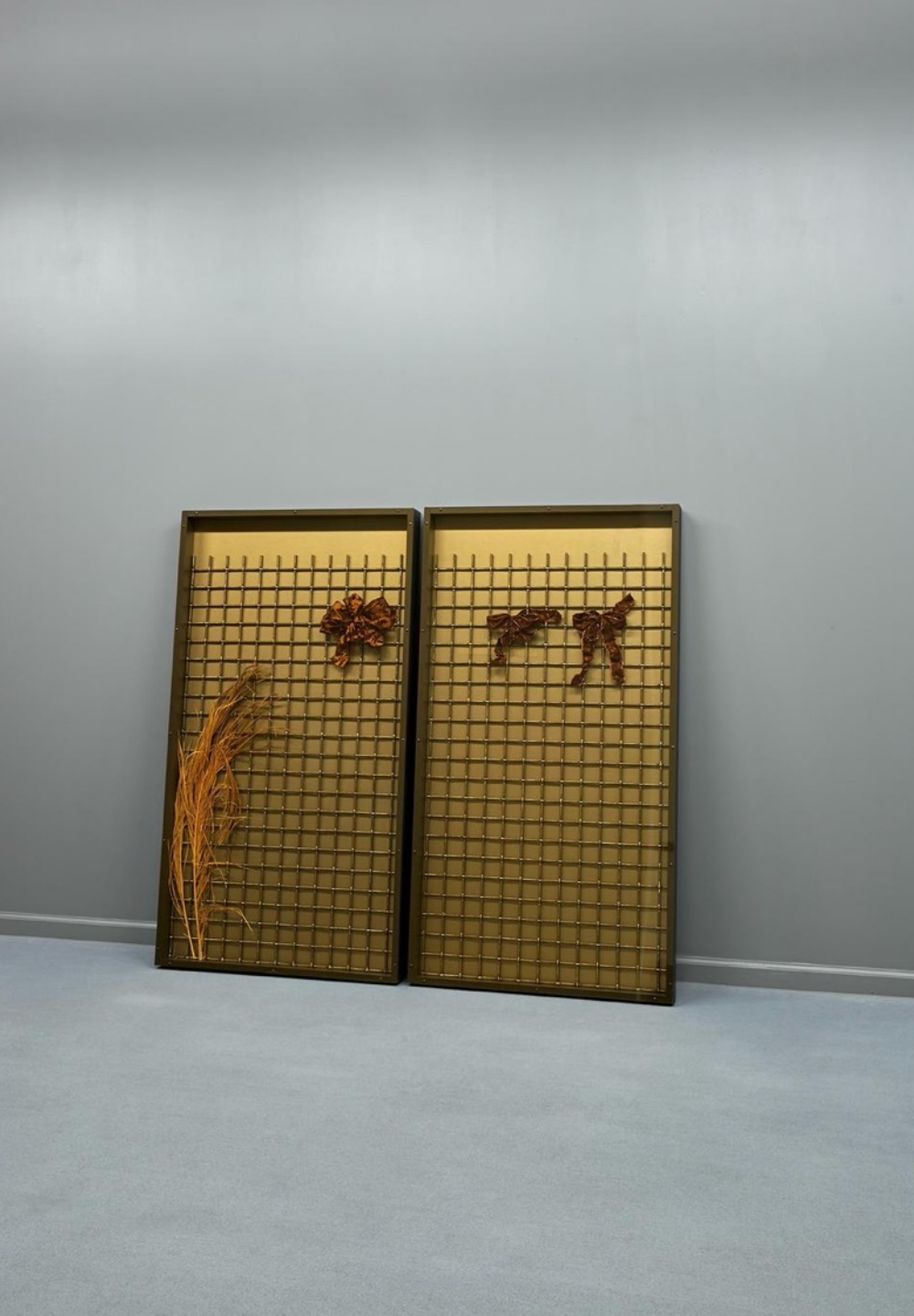
Still untitled , 2023 Wood, acrylic glass, metal mesh, dried palm leaves, three textile bows 140×76×8 cm each; 140 × 152 × 8 cm overall dimensions