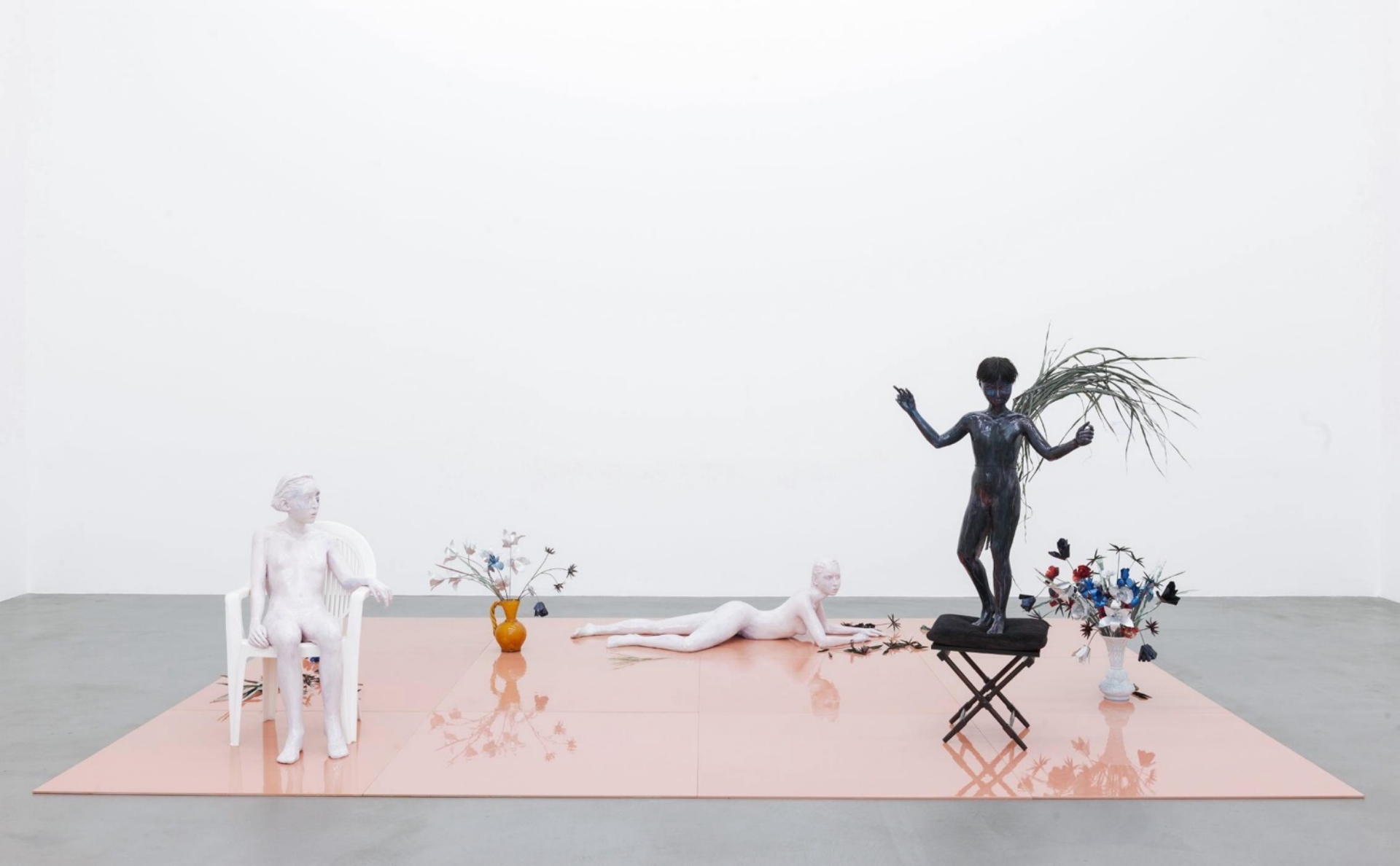
Werkschau Kanton Zürich, 2016 Exhibition view at Museum Haus Konstruktiv, Zurich