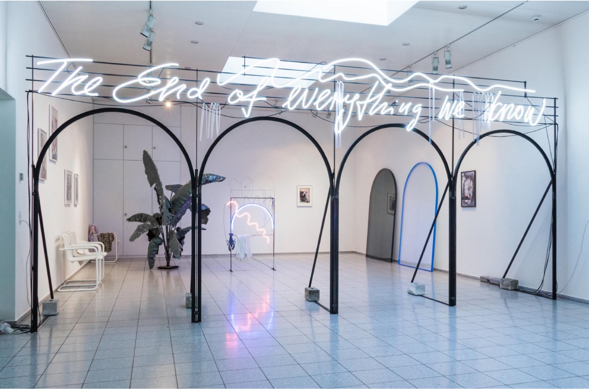
The End of everything we know, 2015 Exhibition view at Kantonsschule nord, Zurich