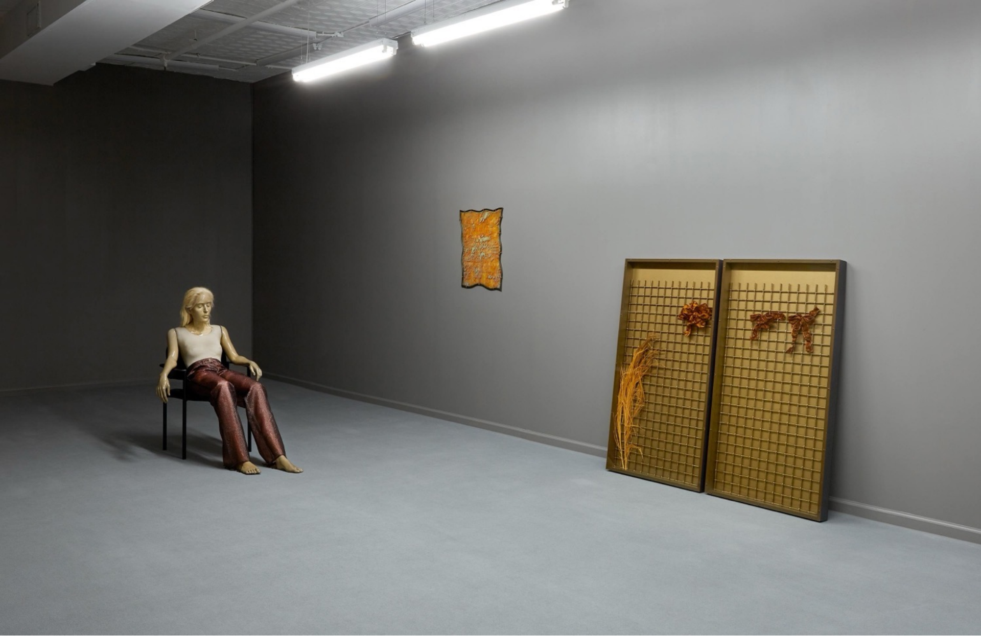
Ein Brief aus Glas, 2023 Exhibition view at Framgent Gallery, New York, USA