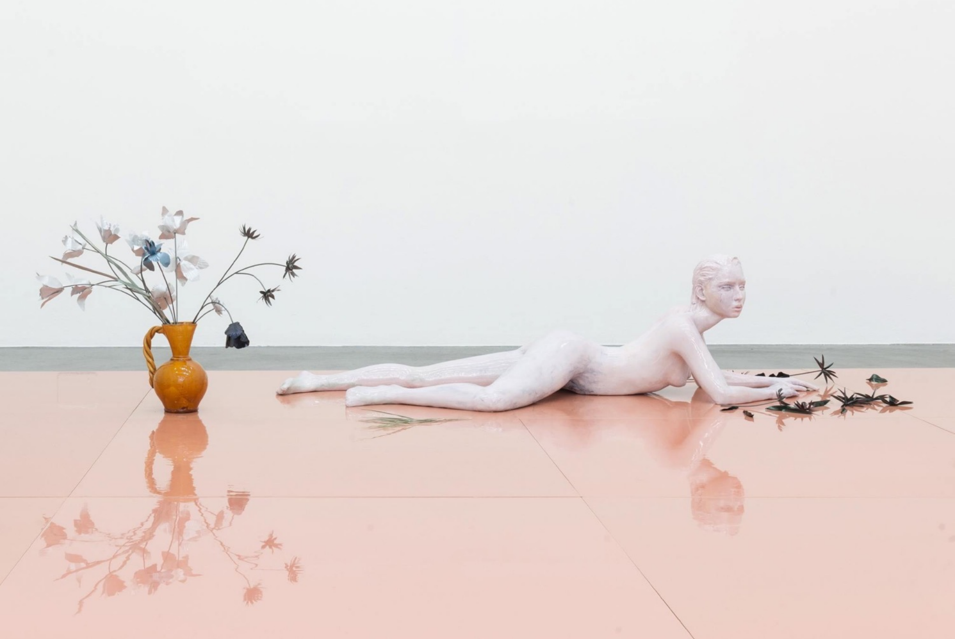
Werkschau Kanton Zürich, 2016 Exhibition view at Museum Haus Konstruktiv, Zurich