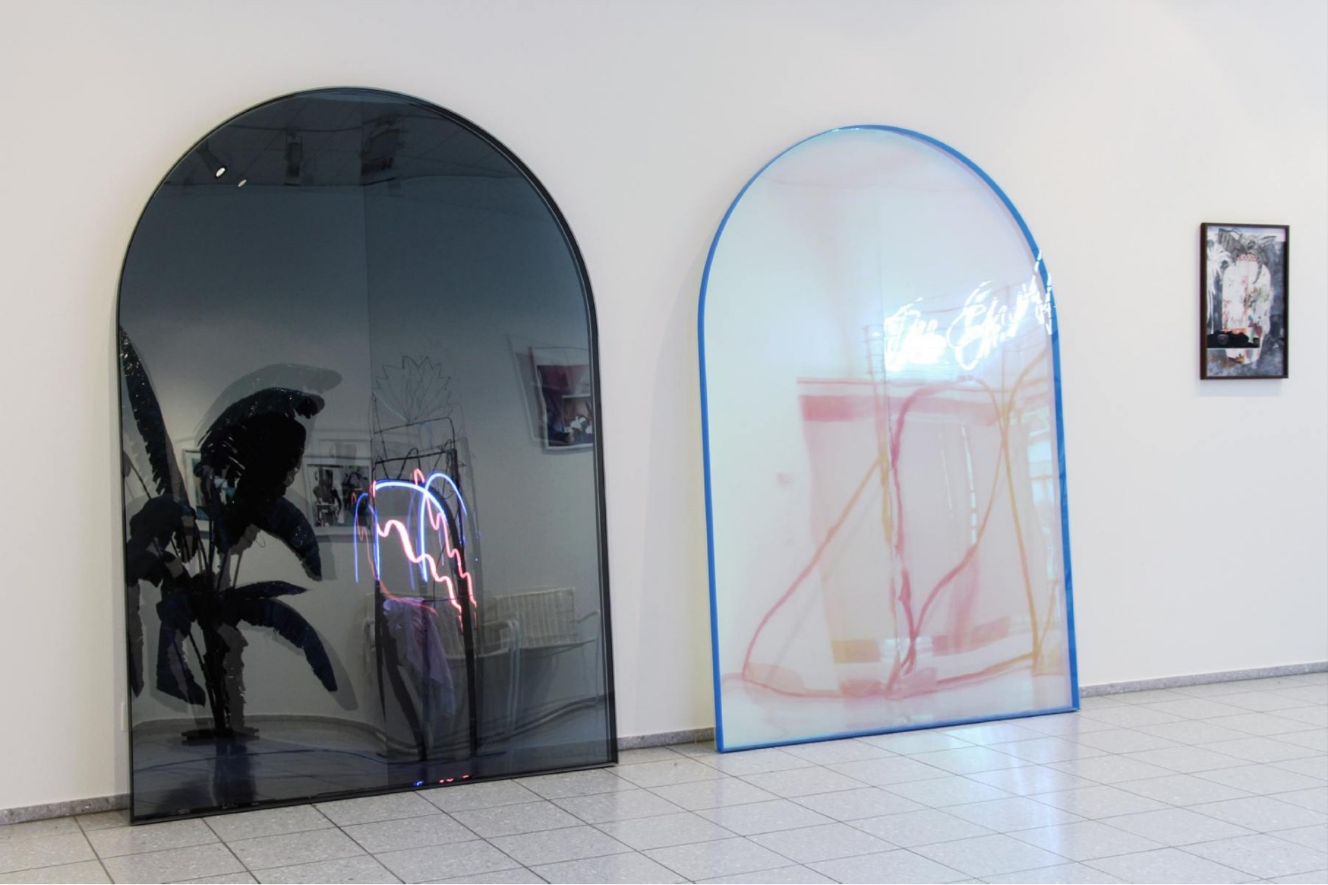
The End of everything we know, 2015 Exhibition view at Kantonsschule nord, Zurich