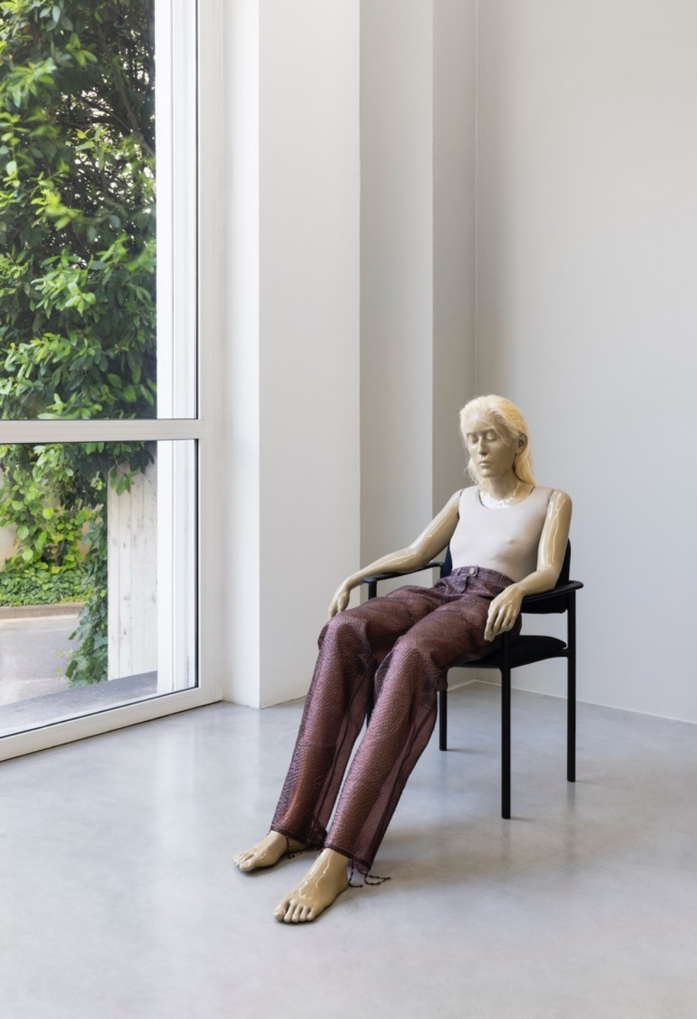
Still untitled , 2023 Wood, gypsum, modeling clay, glaze, pigments padding, textile, glass pearls, artificial hair, chair 131×120×80 cm