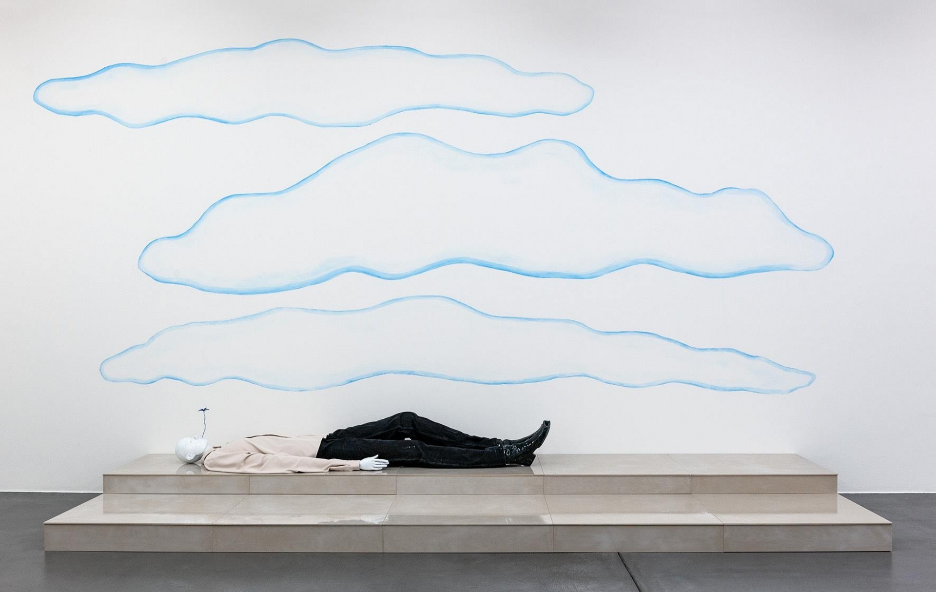
Werkschau 2018 Kanton Zürich Exhibition view at Museum Haus Konstruktiv