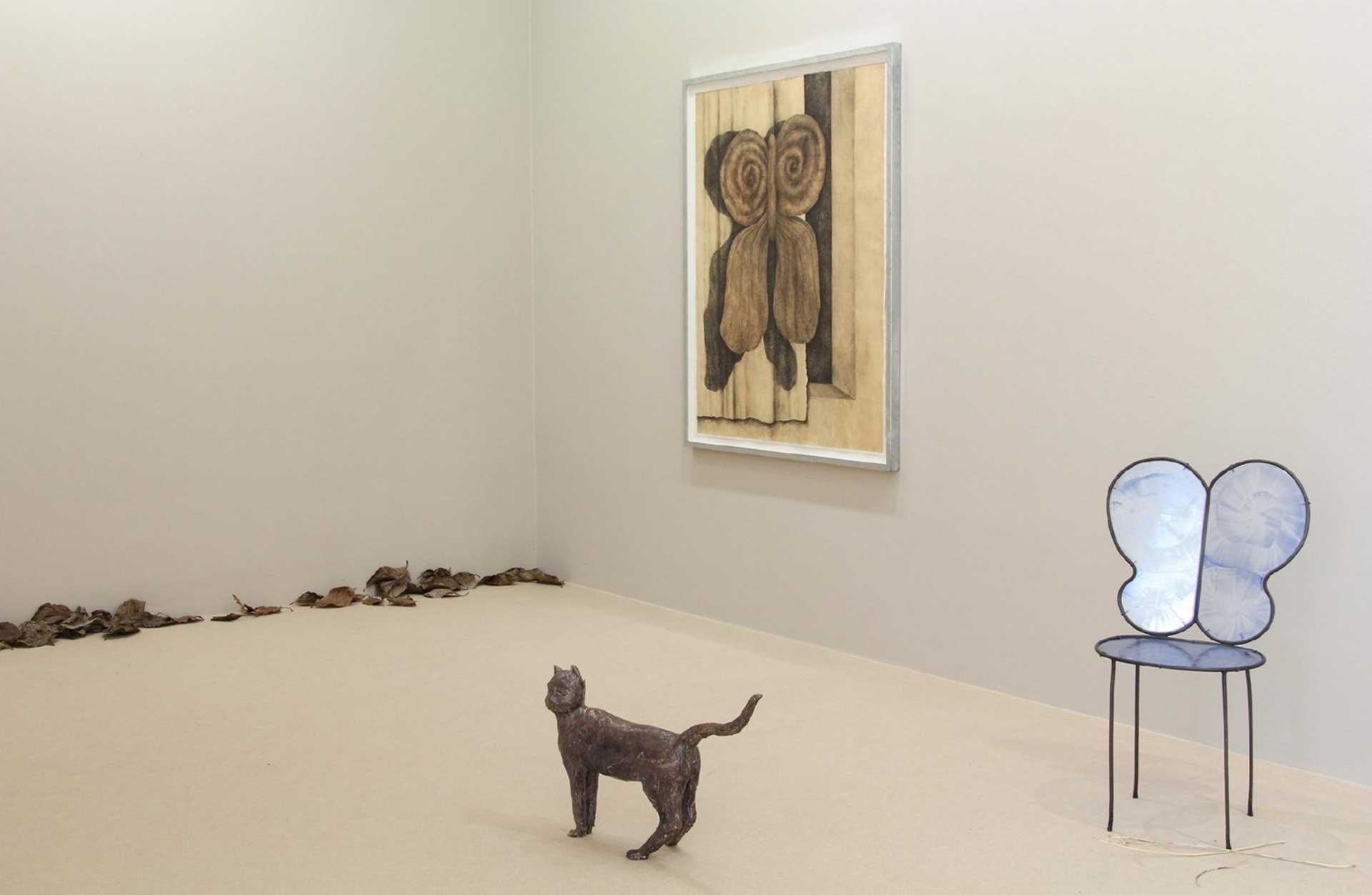
Eine fremde Stunde (A strange hour), 2019 Exhibition view at Kunstverein Friedrichshafen, Germany