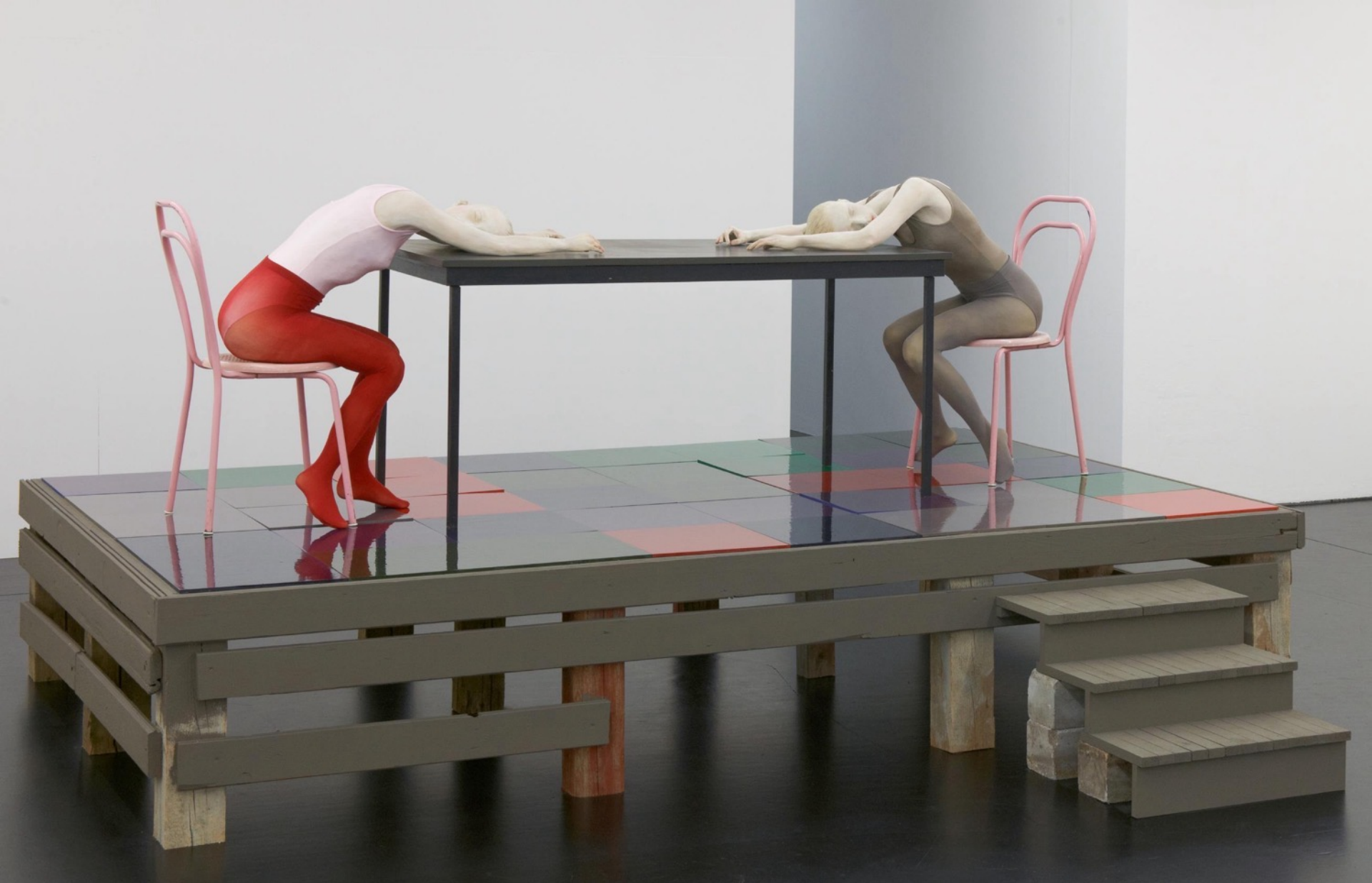
It's all about a golden key, 2012 Exhibition view at Gallery Nicola Von Senger, Zurich