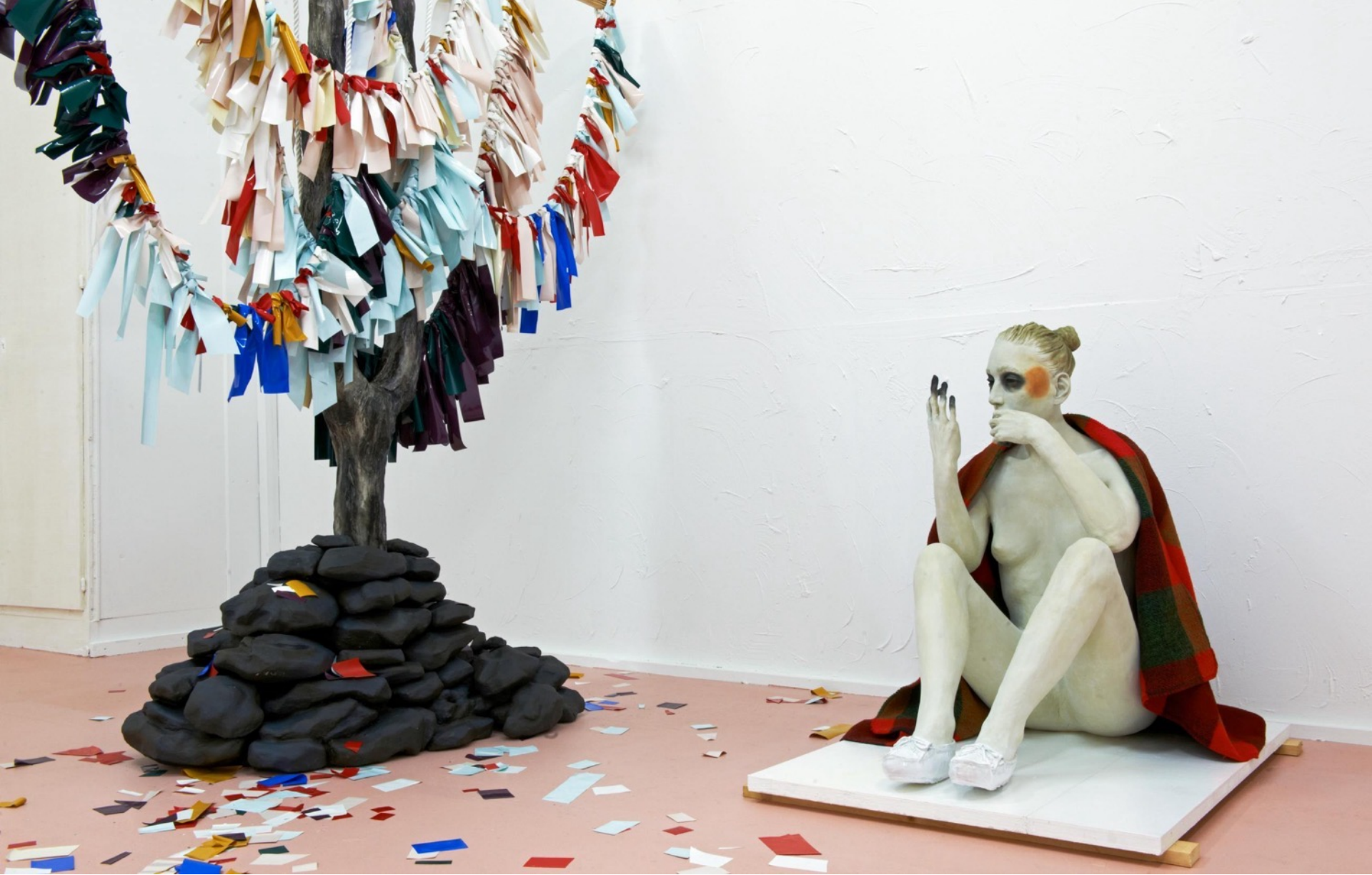
Deeper than beauty, 2011 Exhibition view at Stauffacherstrasse 79, Bern