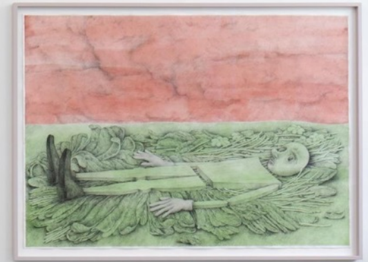
In den Wiesen I – III (In the Meadows I – III), 2020 Exhibition view Werkschau 2020 Kanton Zürich at Museum Haus Konstruktiv, Zürich