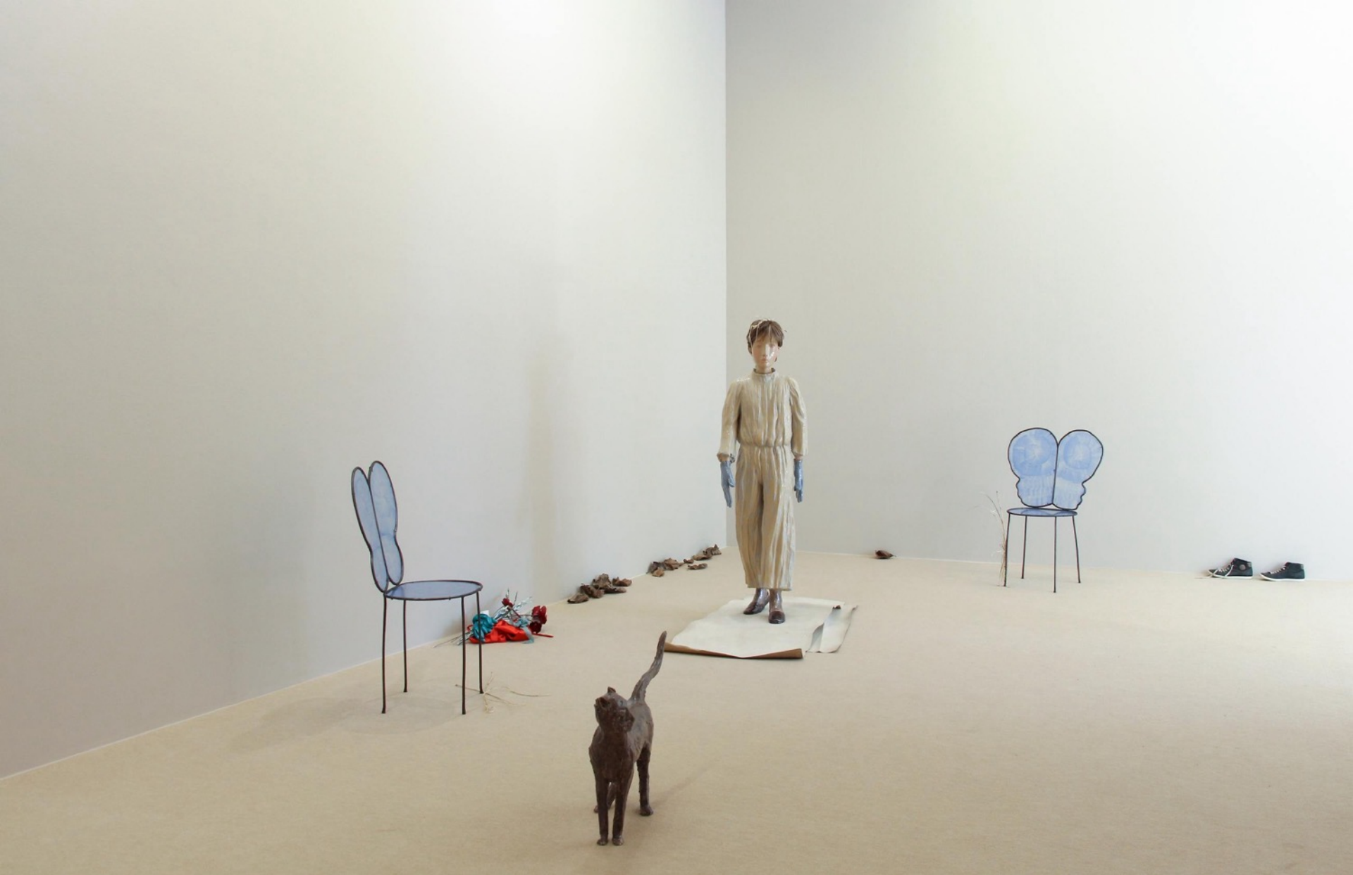
Eine fremde Stunde (A strange hour), 2019 Exhibition view at Kunstverein Friedrichshafen, Germany