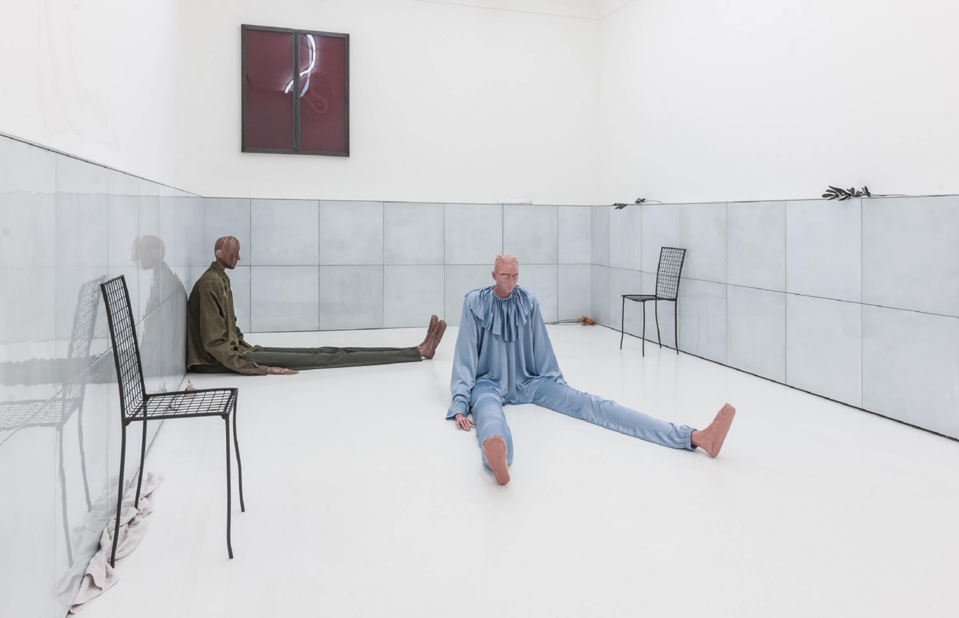
Refaire le Monde, 2018 Installation view at Museum Helmhaus, Zürich