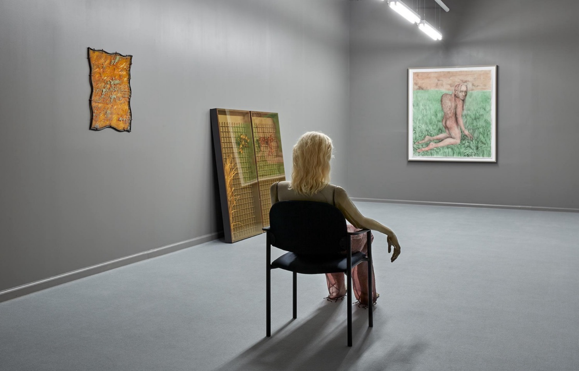
Ein Brief aus Glas, 2023 Exhibition view at Framgent Gallery, New York, USA