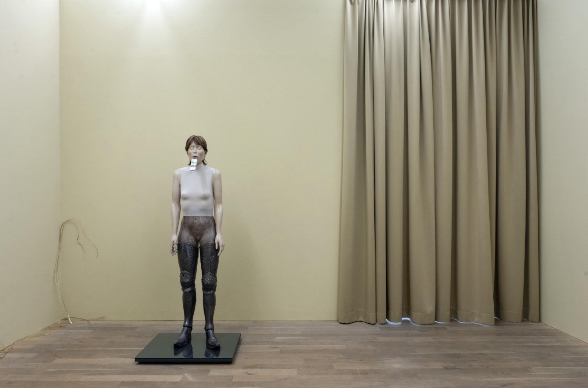
Der Rest ist Schweigen (The Rest is Silence), 2021 Installation view at Project Space Gallery Peter Kilchmann, Zurich