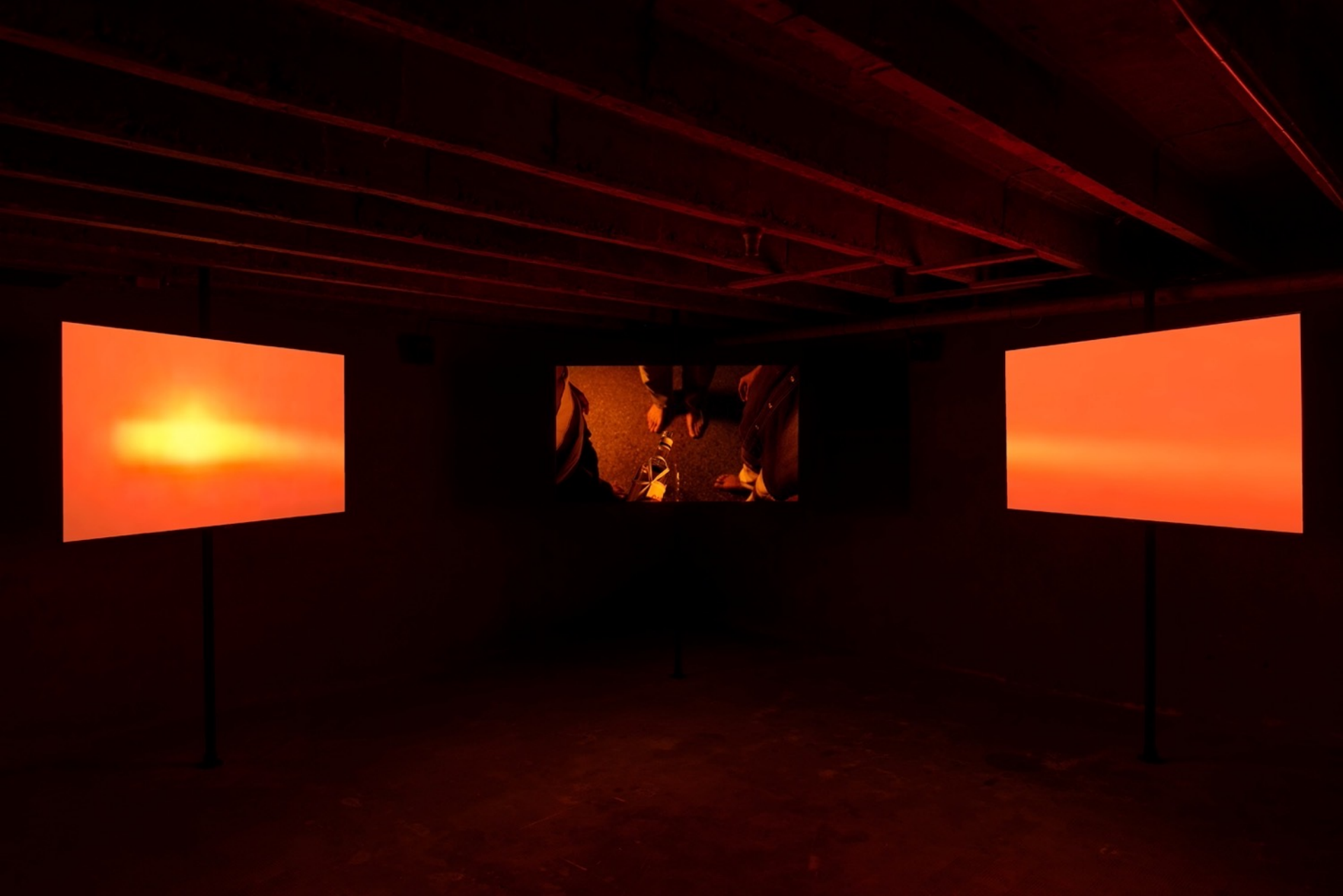
Unless , 2021 Installation view at Cherish, Geneva