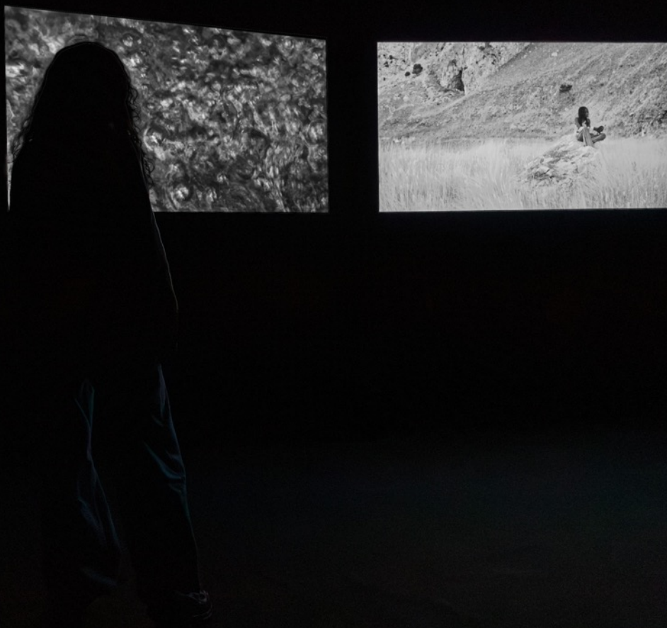
Spill I-III, 2022 Installation view at Archivio Storico Comunale, Palermo