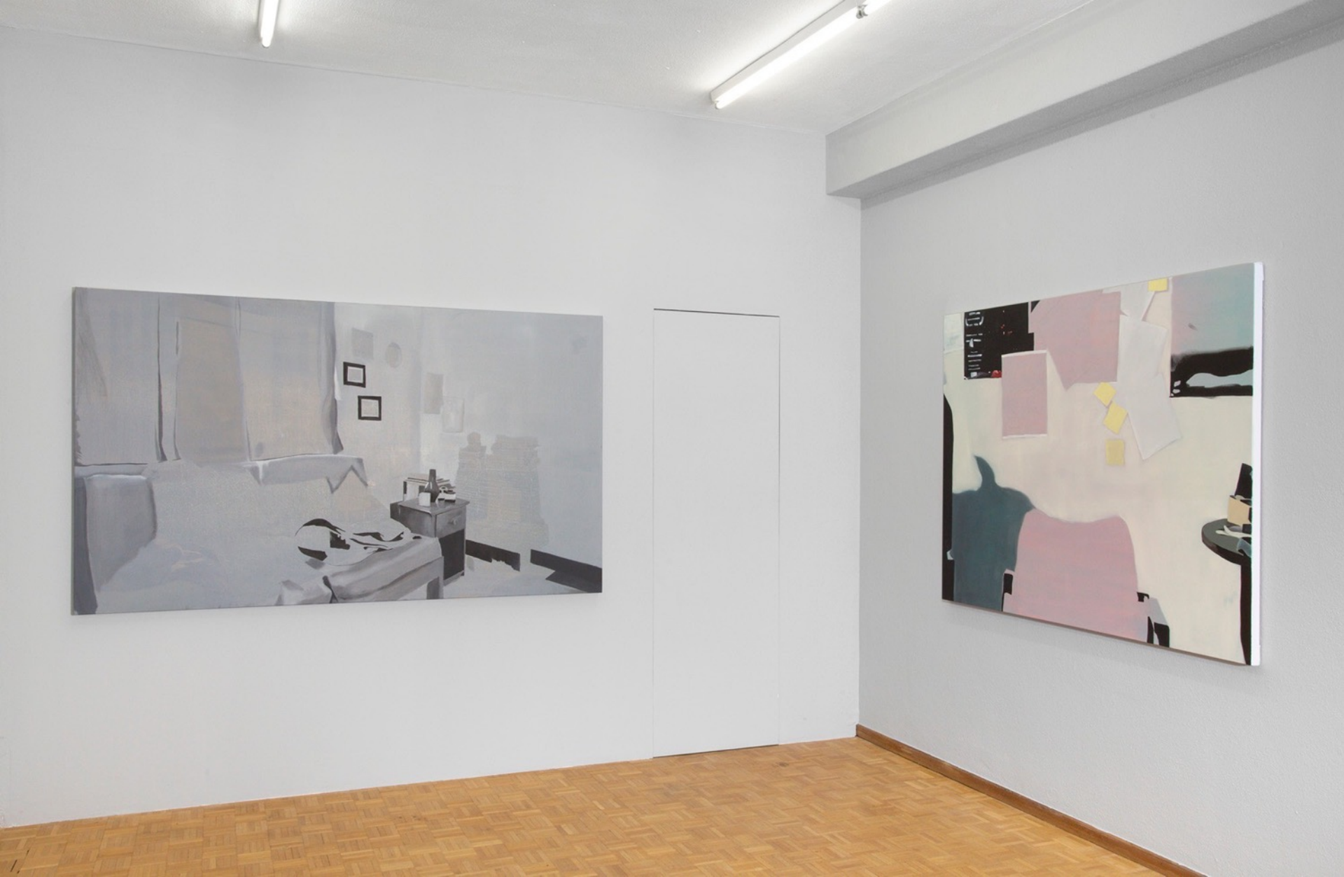
Beautiful and tough as chestnut/ stanchions against our nightmare of weakness, 2022

Installation view at Sentiment, Zurich