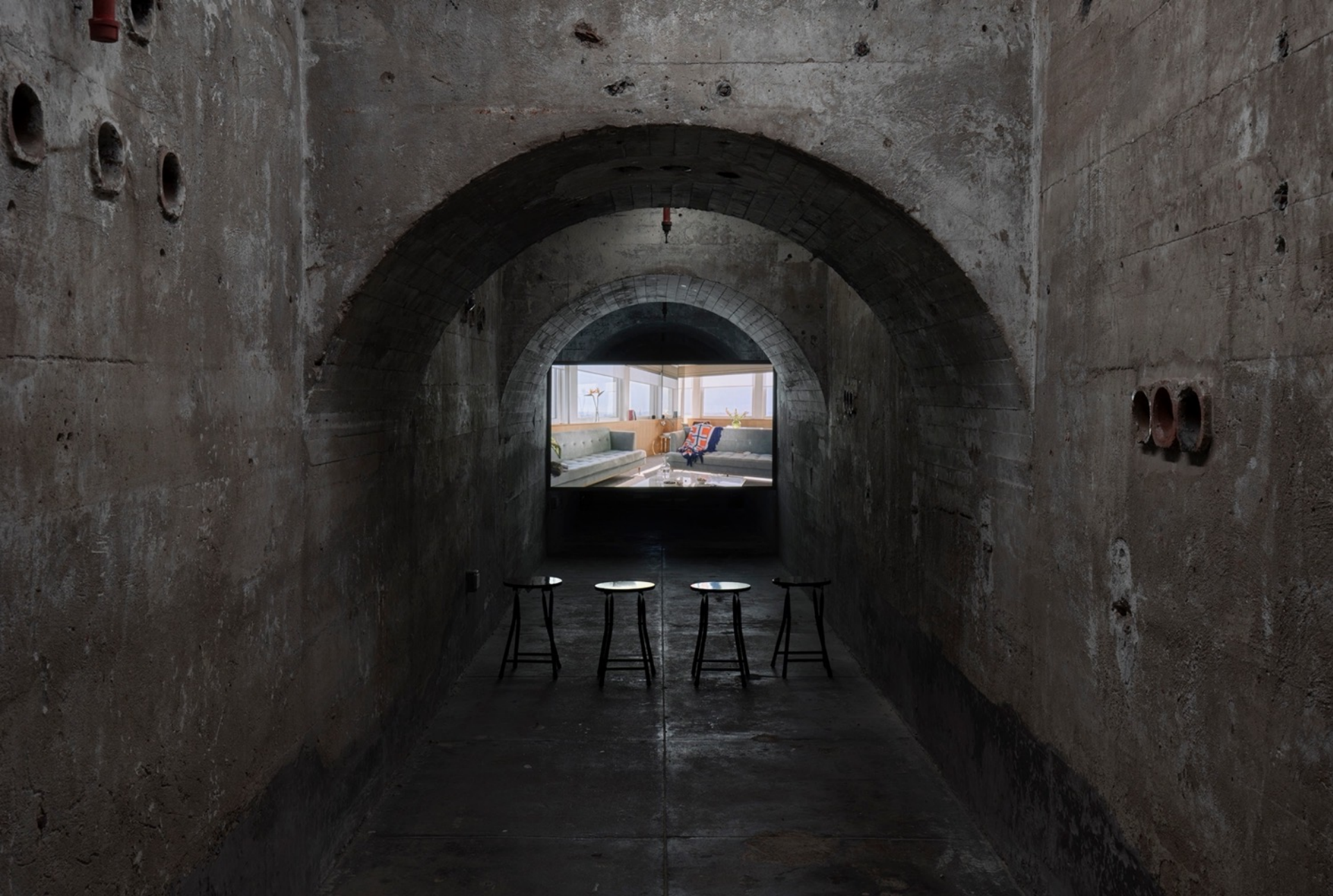
Moment 2, 2022 Installation view at CFGNY at SculptureCenter, New York City