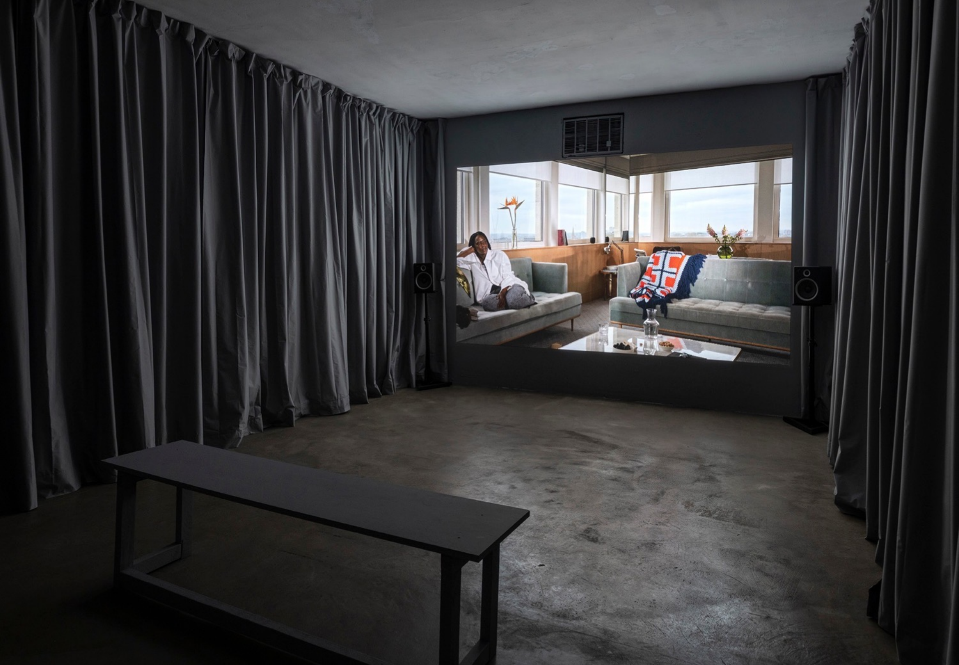
Moment 2, 2022 Installation view at Cordova, Barcelona