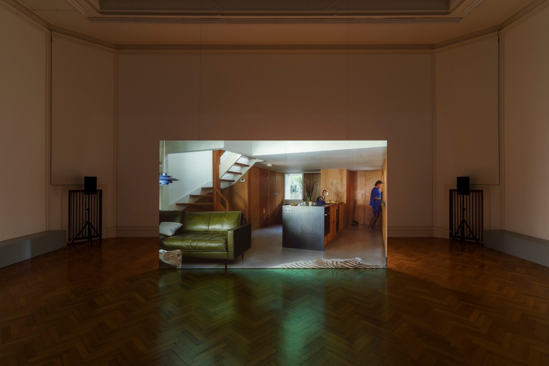
Close-Up / Quiet as it's kept / Quiet as it's kept / Close-Up, 2023 Installation view at Kunsthalle Bern