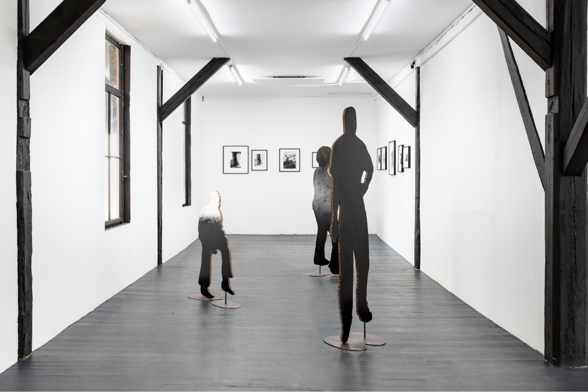
Untitled (for scale), 2021 Installation view at Kunstverein Last Tango, Zurich