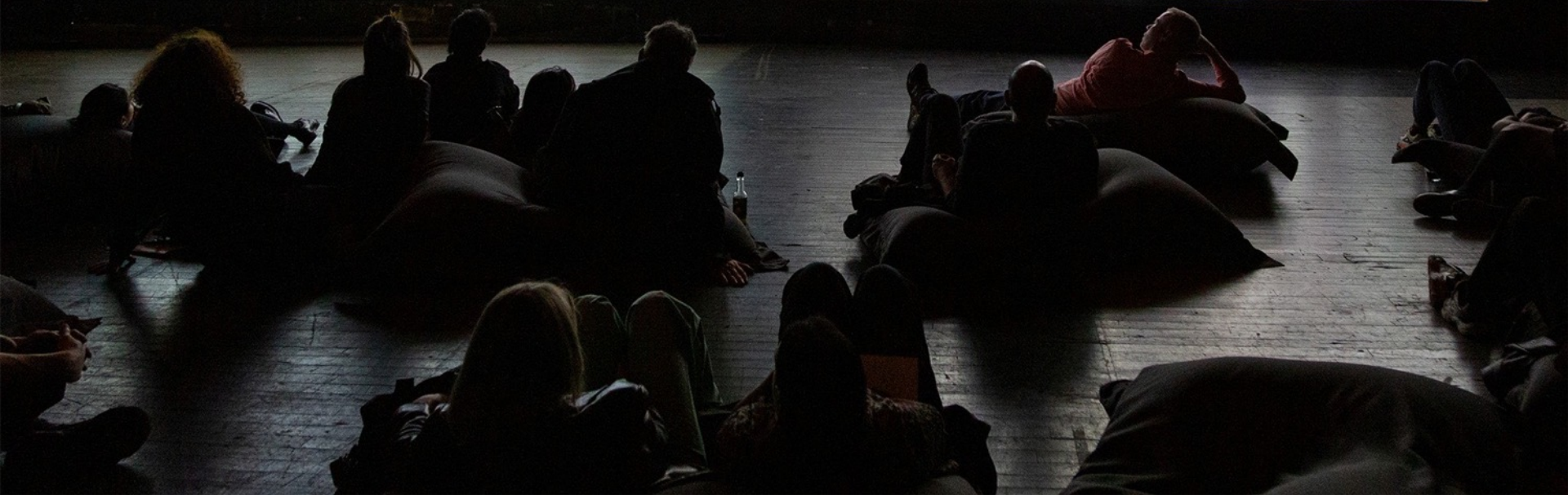
Moment , 2022 Installation view at ICA London