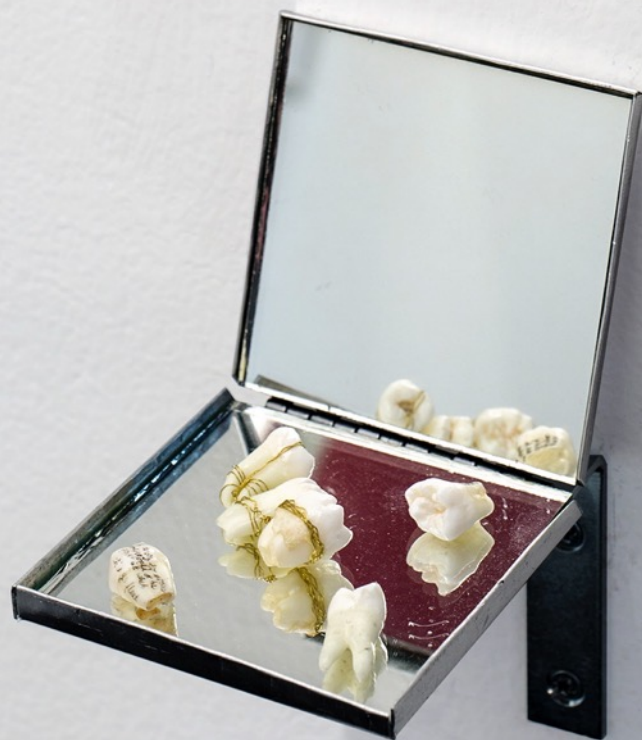
Thicc and Slippery, 2020 Ink on human teeth, wire, aluminium, mirror 7 x 7 x 7cm