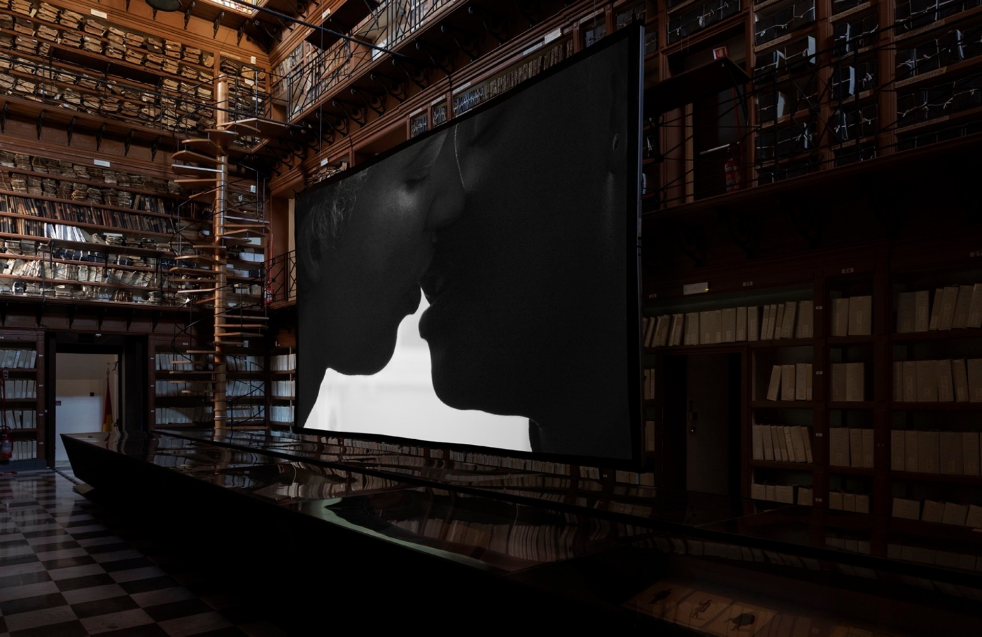
Spill I-III, 2022 Installation view at Archivio Storico Comunale, Palermo