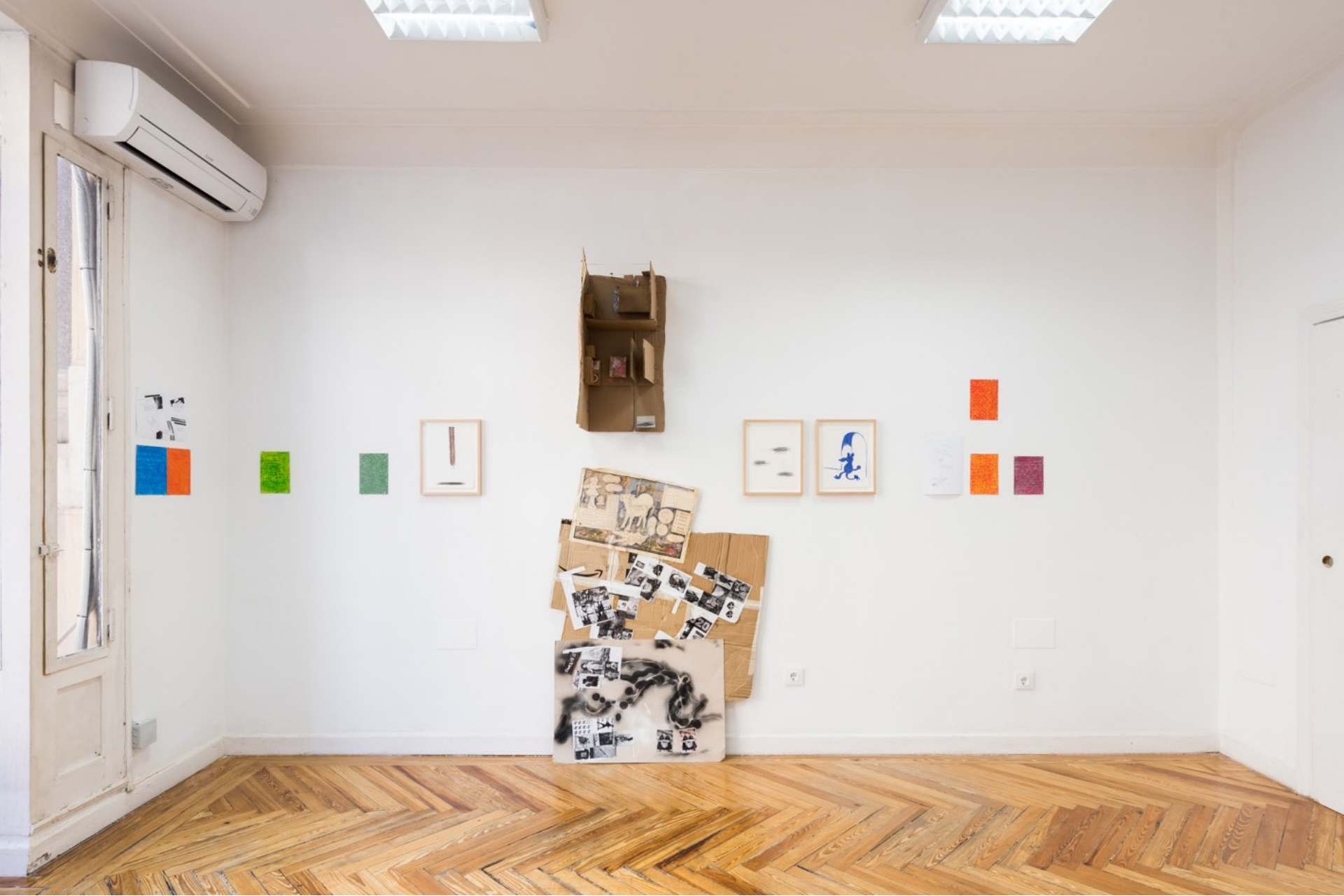
Maybe intensely so, or not at all, but definitely mistaken - unhinged, unbound, 2021