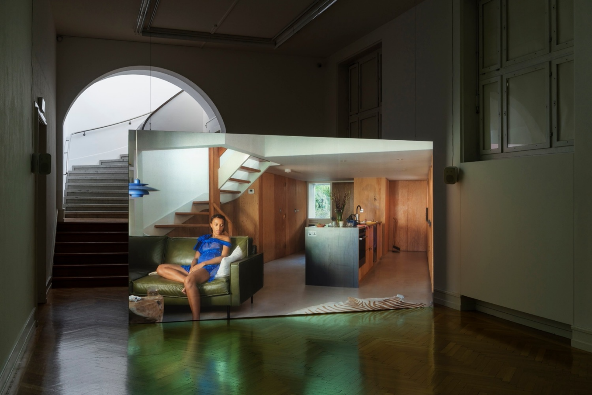
Close-Up / Quiet as it's kept / Quiet as it's kept / Close-Up, 2023