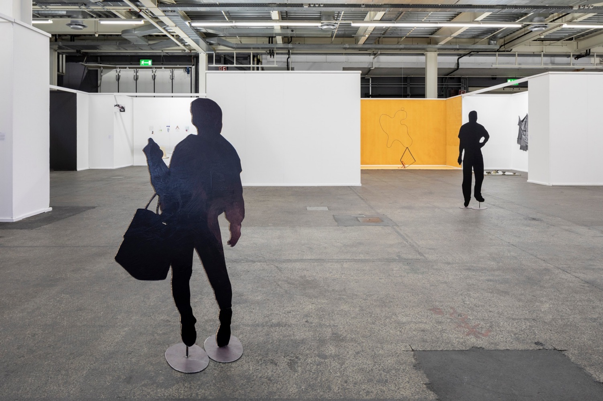
Untitled (for scale), 2021 Installation view at Messe Basel