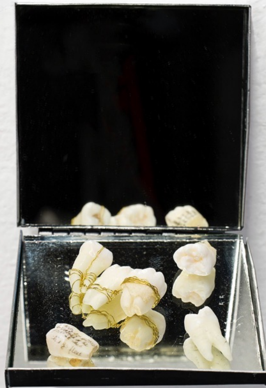
Thicc and Slippery, 2020

Ink on human teeth, wire, aluminium, mirror 7 x 7 x 7cm