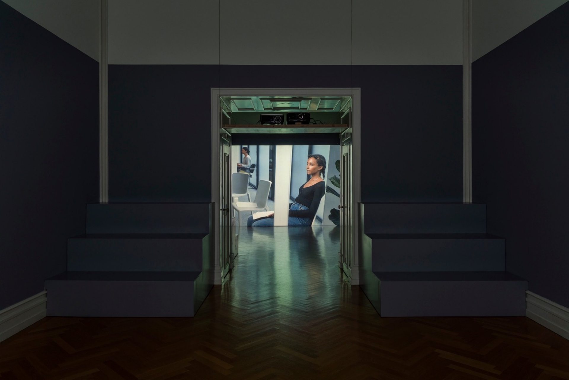
Close-Up / Quiet as it's kept / Quiet as it's kept / Close-Up, 2023 Installation view at Kunsthalle Bern