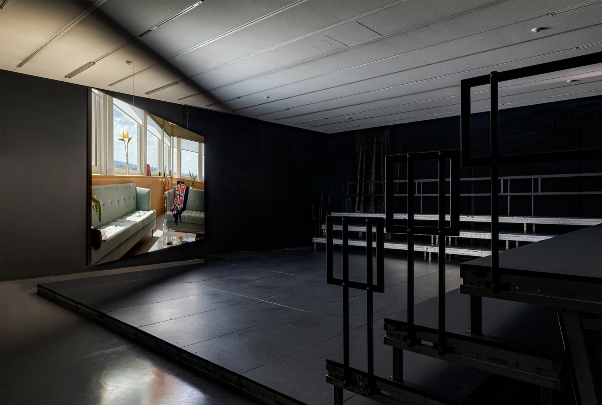
Moment 2, 2022 Installation view at schwarzescafé, Luma Westbau, Zurich