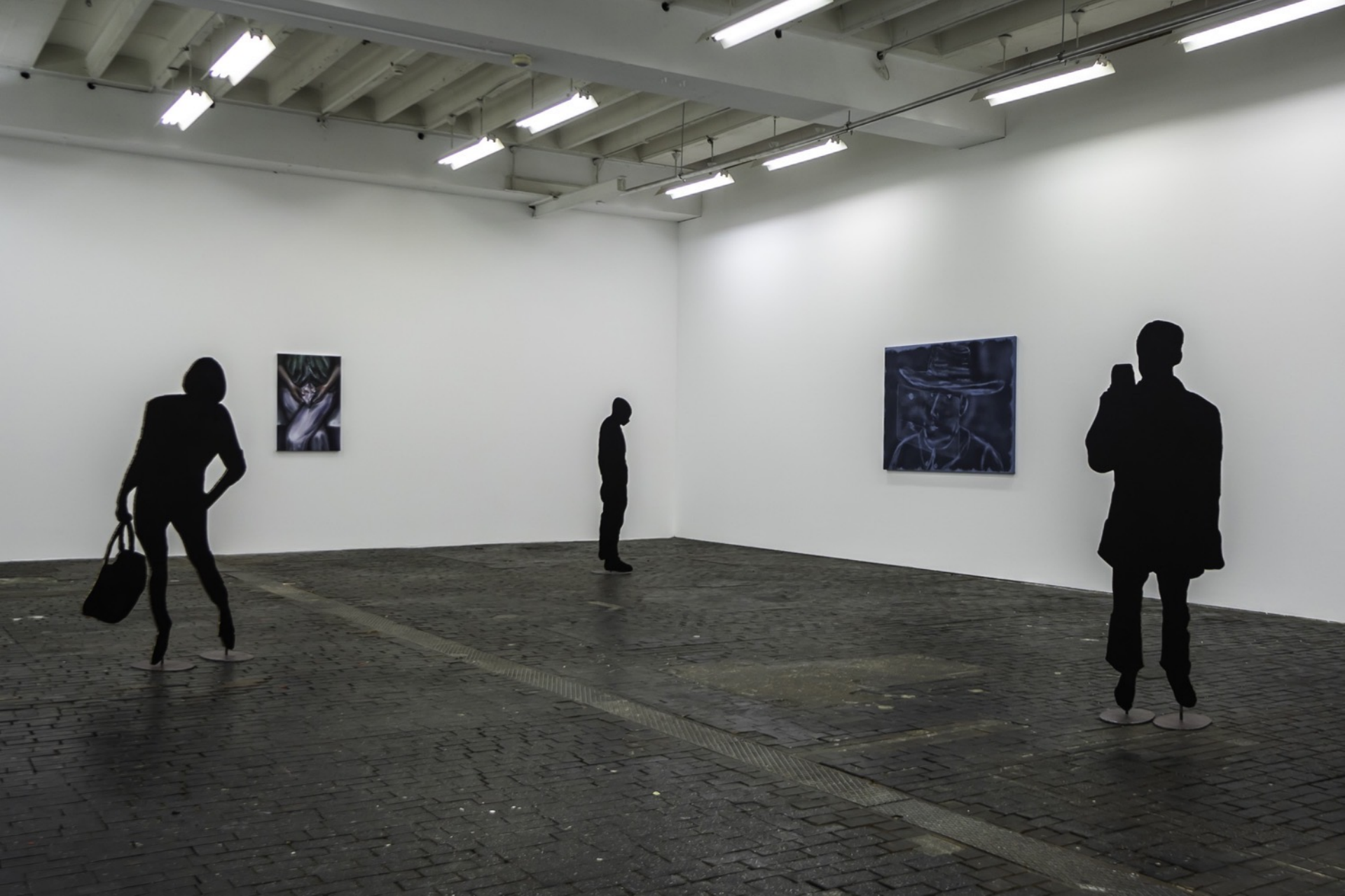
Untitled (for scale), 2022 Installation view at Centre d'Art Contemporain Geneva