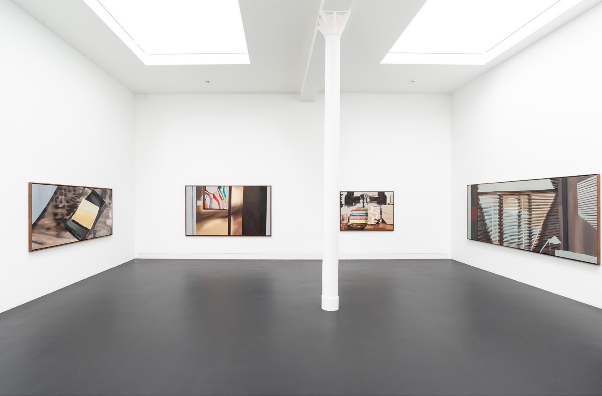
Love Letter, 2023 Installation view at Galerie Gregor Staiger, Zurich