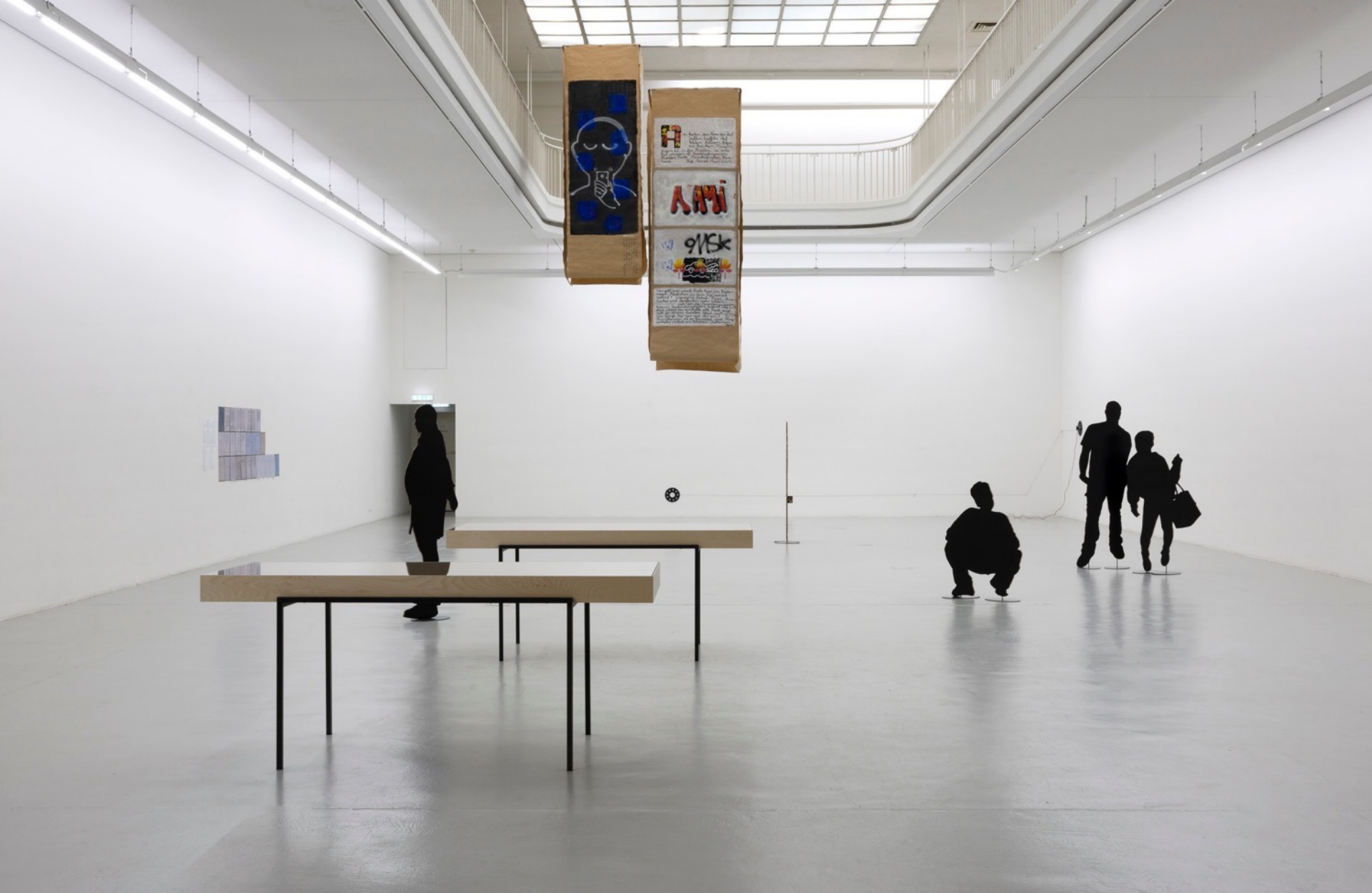
Untitled (for scale), 2023 Installation view at Biennale für Freiburg