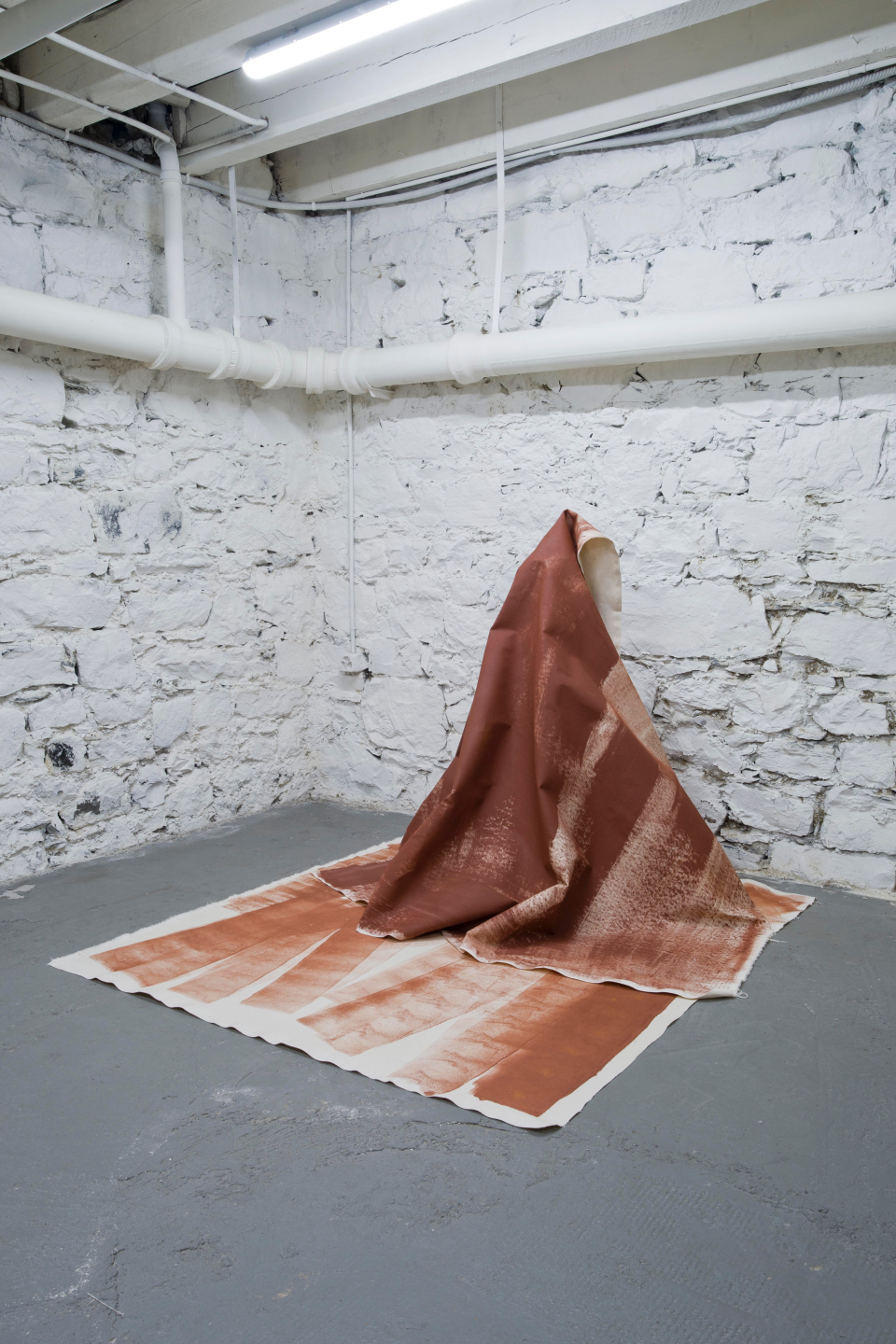
AZIZE FERIZI The Monk , 2023 Oil on canvas, metallic wire 150×160×160 cm