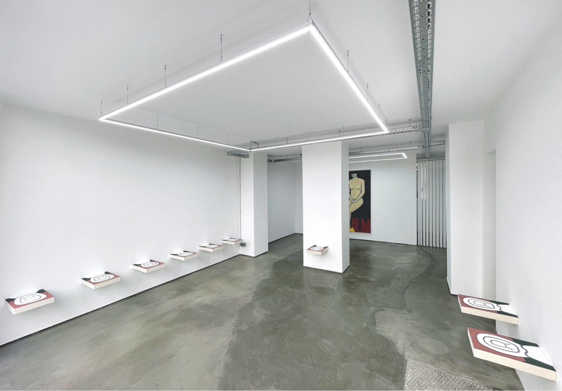
Installation view at Exo Exo, Paris 2024