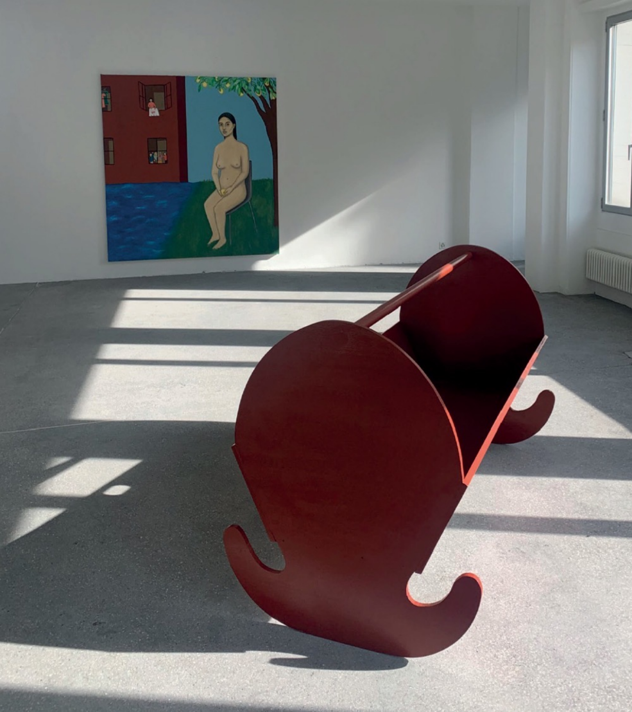
Installation view at Karma International, Zurich 2021