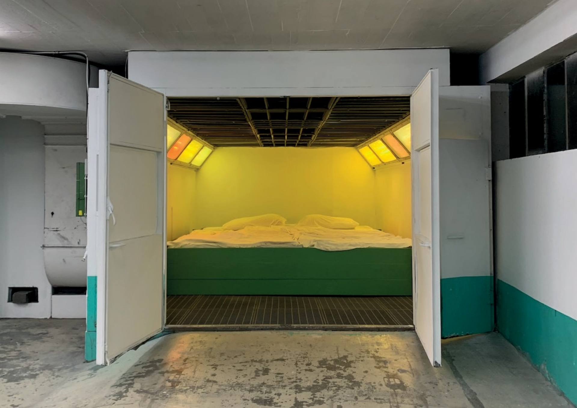
Installation view at Limbo Space, Geneva 2021