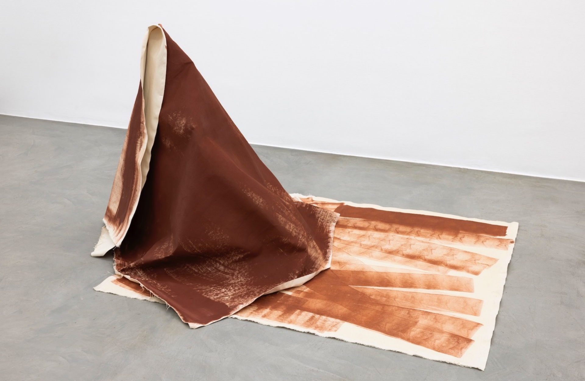
AZIZE FERIZI The Monk , 2023 Oil on canvas, metallic wire 150×160×160 cm