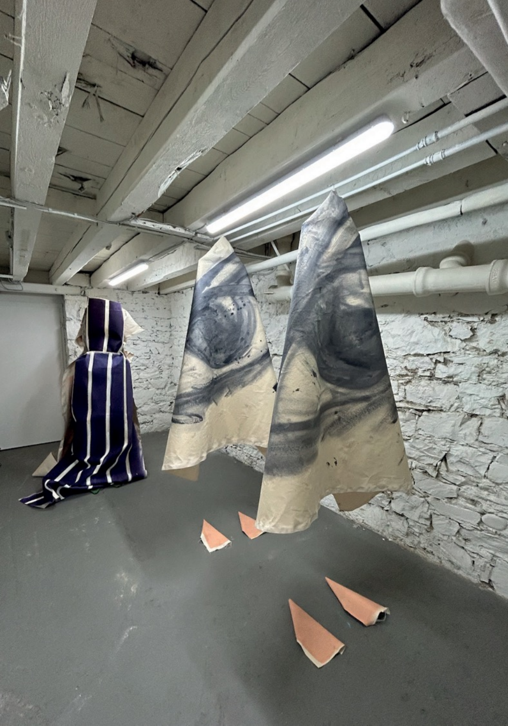
Installation view at Lovay Fine Arts, Geneva 2023