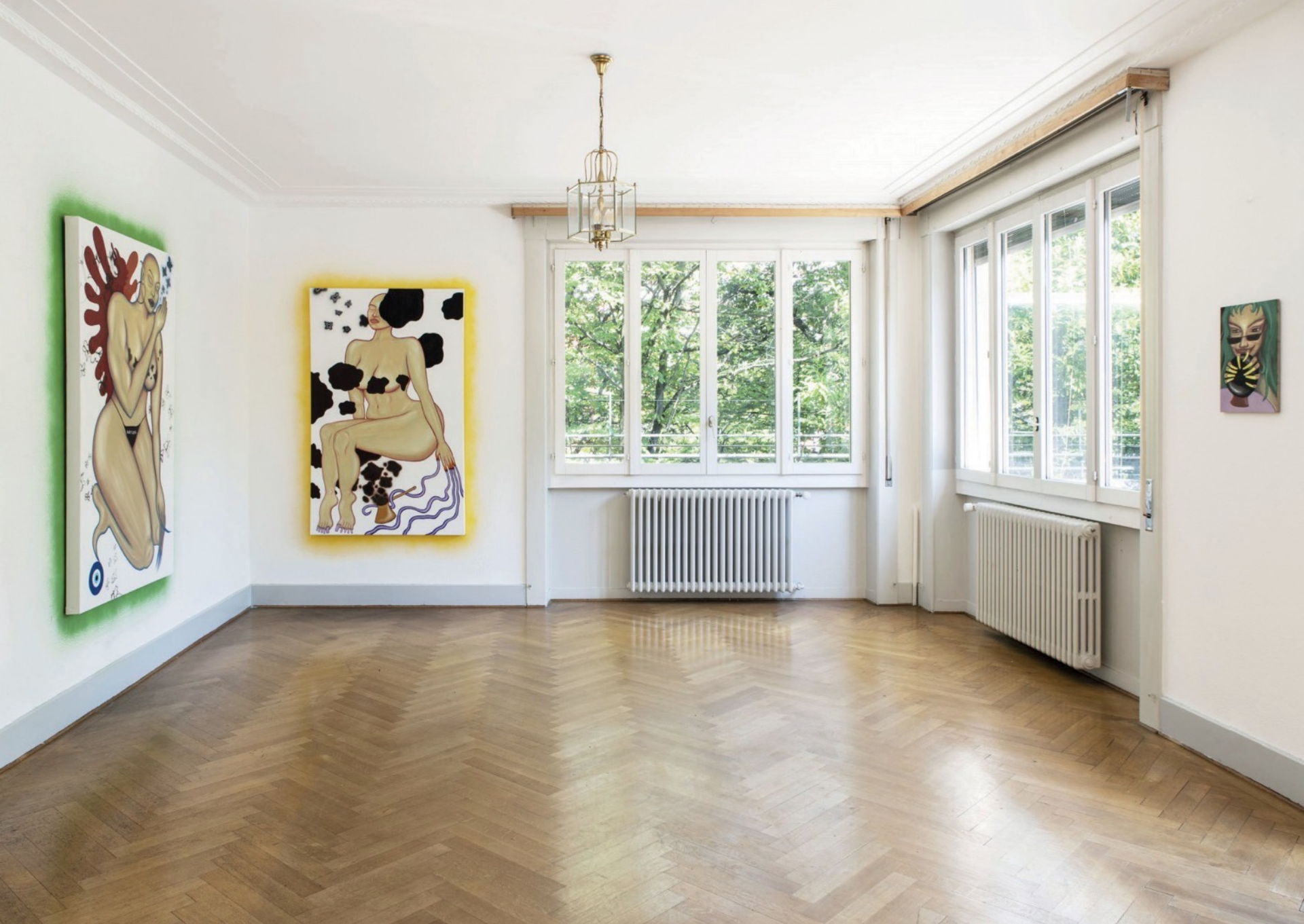
Installation view at Cherish, Geneva 2020