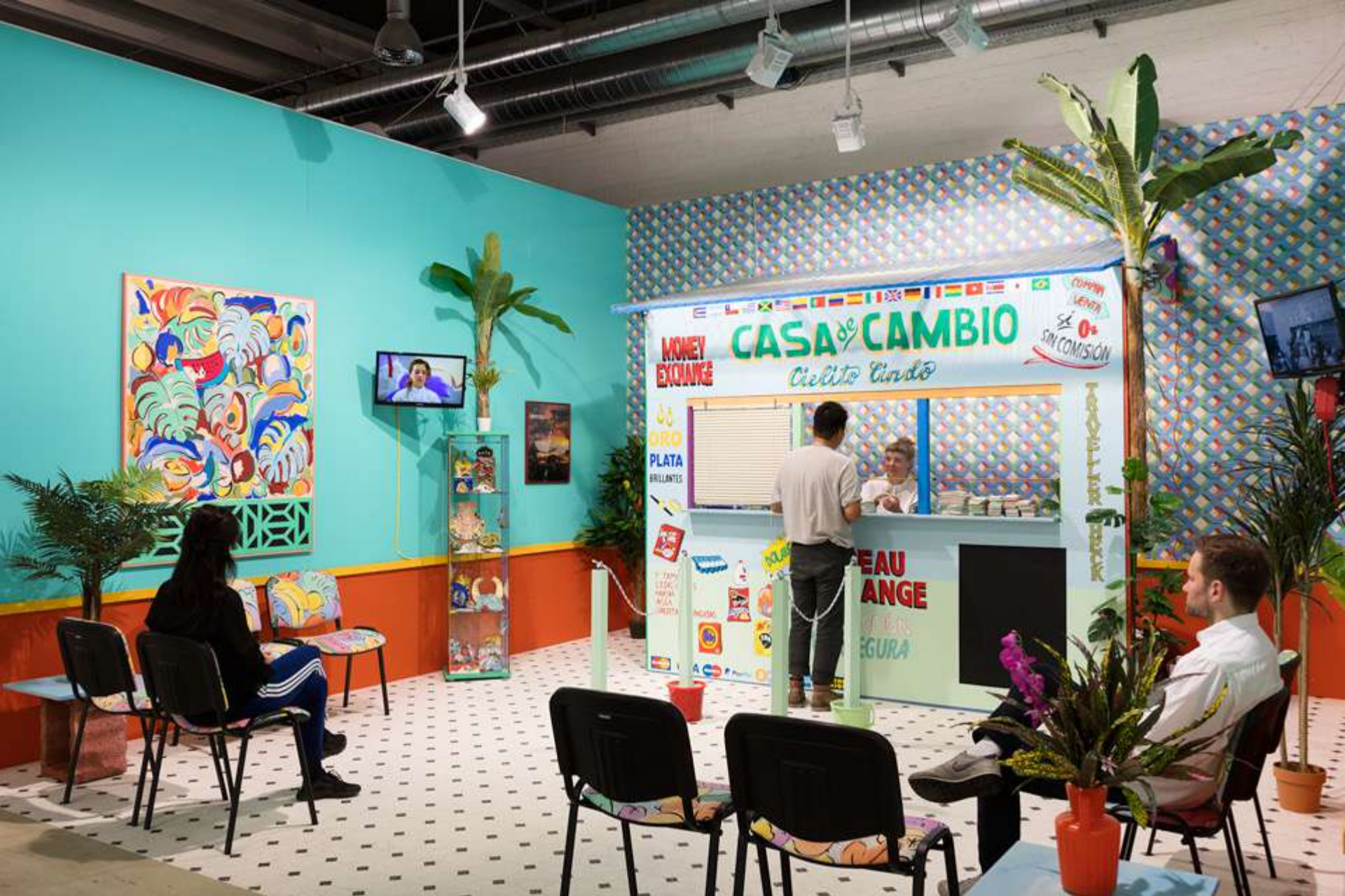
Casa de Cambio, 2016 Installation view at Art Basel Statements, Basel