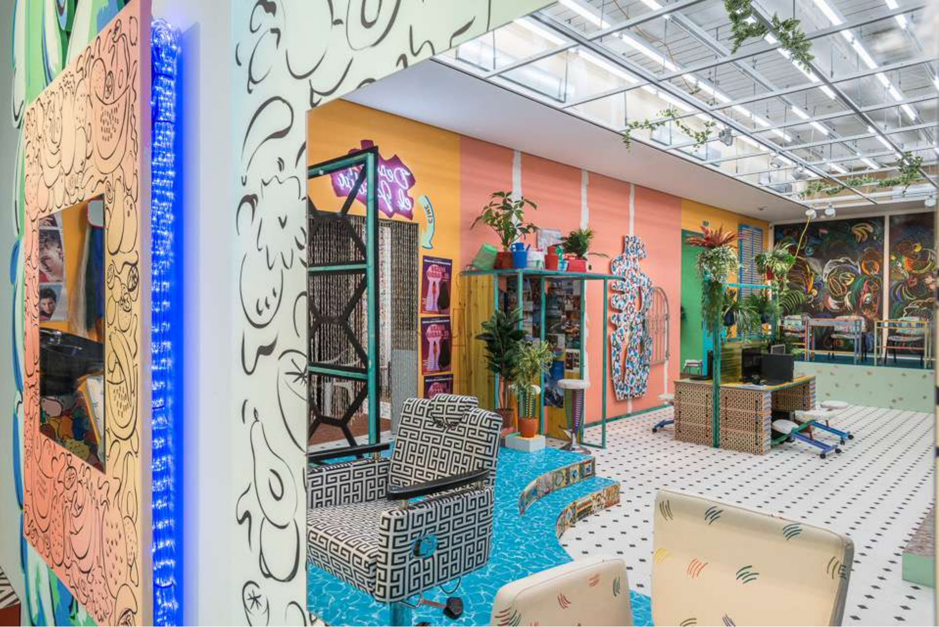
Amazonas Shopping Center, 2017 Installation view at Hamburger Bahnhof - Museum für Gegenwart, Berlin