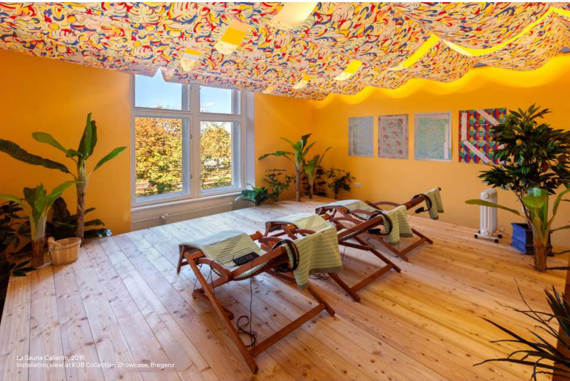
La Sauna Caliente , 2016 Installation view at KUB Collection Showcase, Bregenz