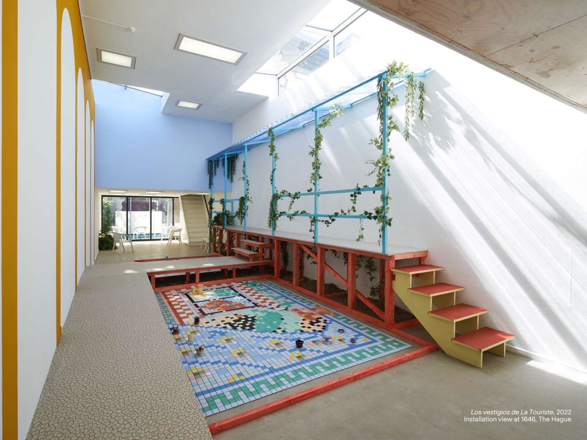
Los vestigios de La Touriste, 2022 Installation view at 1646, The Hague