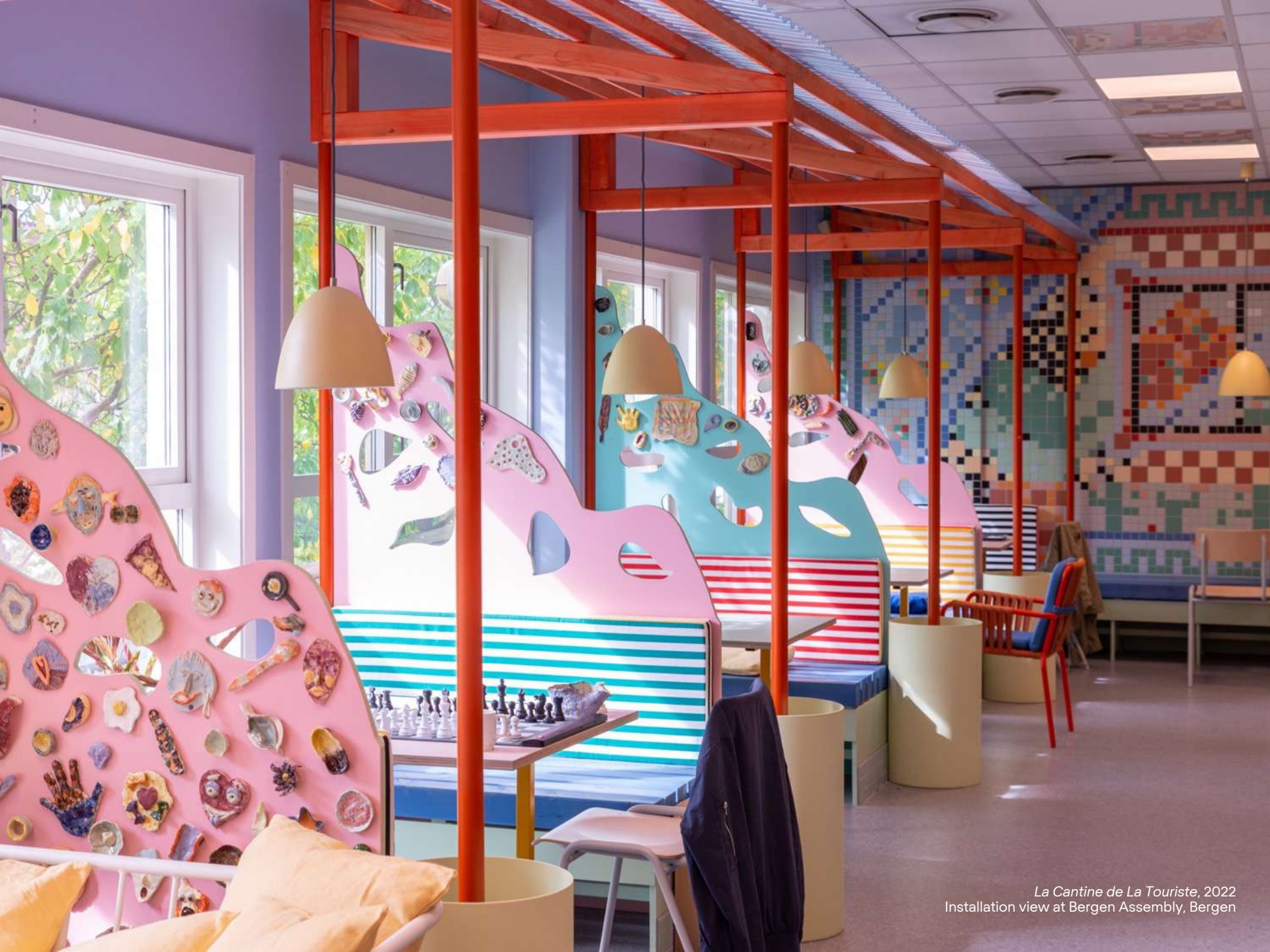
La Cantine de La Touriste, 2022 Installation view at Bergen Assembly, Bergen