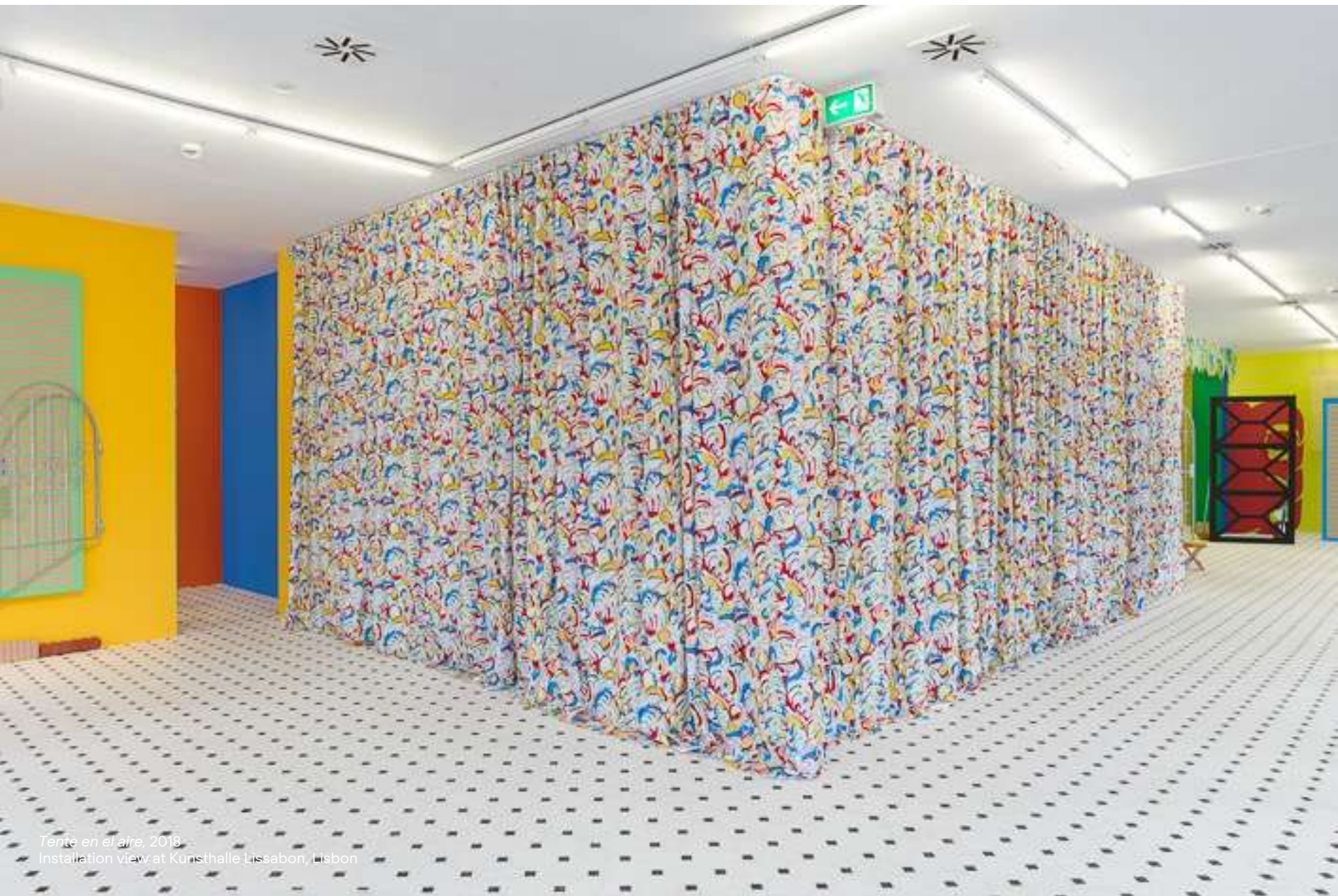
Tente en el aire , 2018 Installation view at Kunsthalle Lissabon, Lisbon