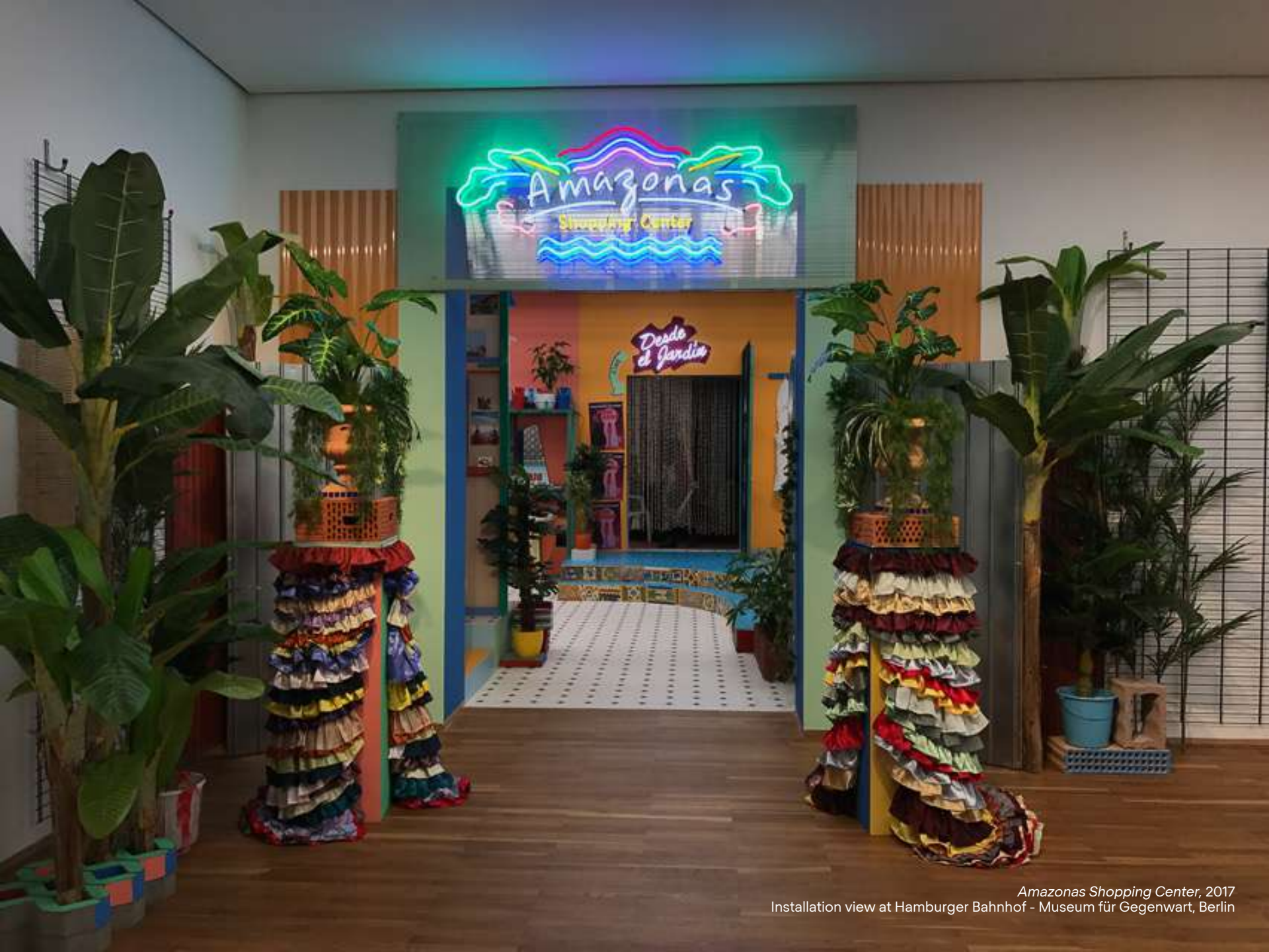
Amazonas Shopping Center, 2017 Installation view at Hamburger Bahnhof - Museum für Gegenwart, Berlin