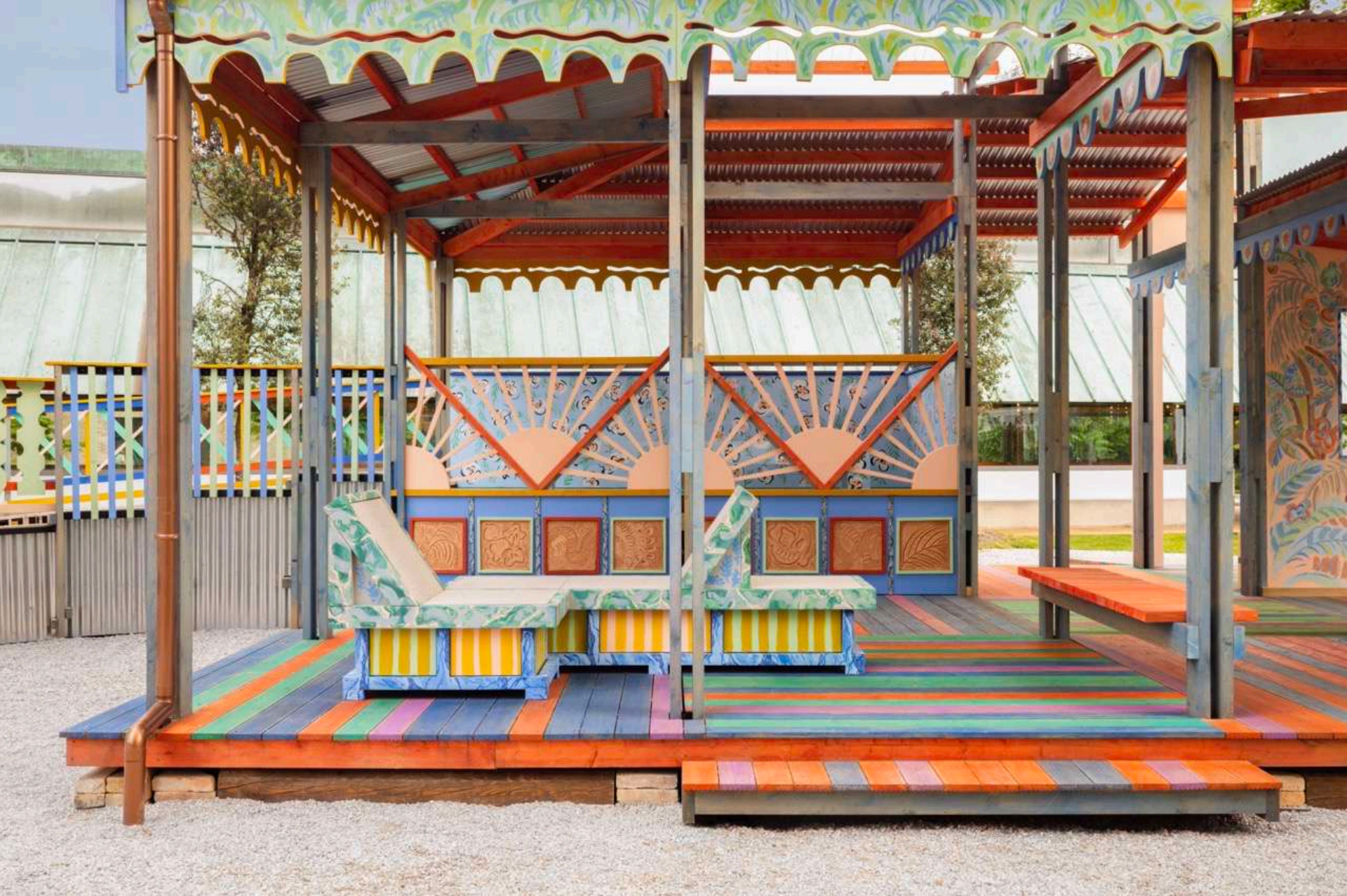
Pabellón criollo , 2024 Installation view at the 60th International Art Exhibition of La Biennale di Venezia, 'Foreigners Everywhere', curated by Adriano Pedrosa. Courtesy of the artist; Chertlütde, Berlin; Crèvecoeur, Paris and Francesca Minini, Milan. Photo by Andrea Rossetti