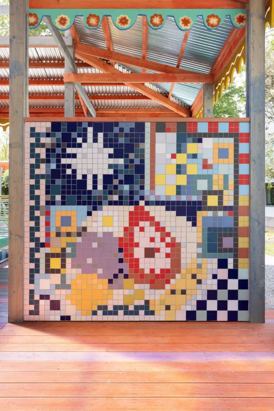
Pabellón criollo, 2024

Installation view at the 60th International Art Exhibition of La Biennale di Venezia, 'Foreigners Everywhere', curated by Adriano Pedrosa.