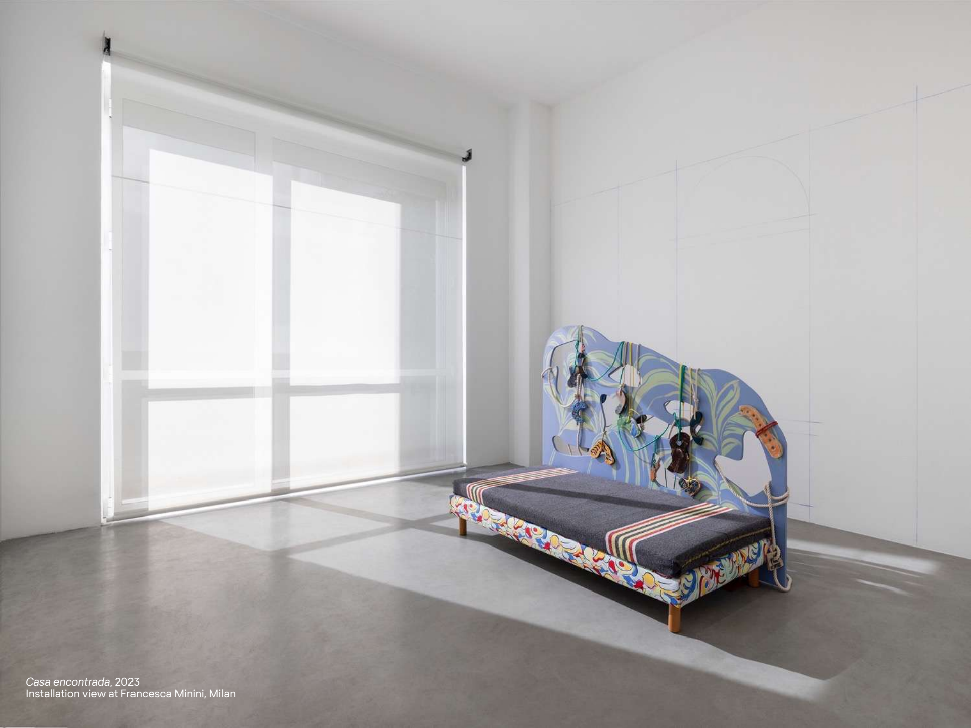
Casa encontrada, 2023 Installation view at Francesca Minini, Milan