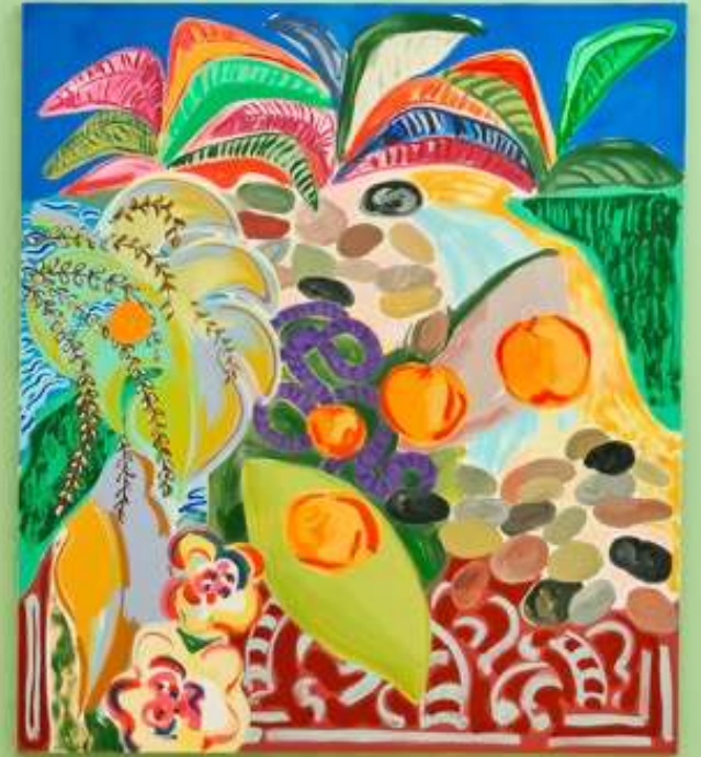
Se empeñaban en tapar las grietas, pero las paredes seguían sudando 2020 Installation view at Villa Arson, Nice