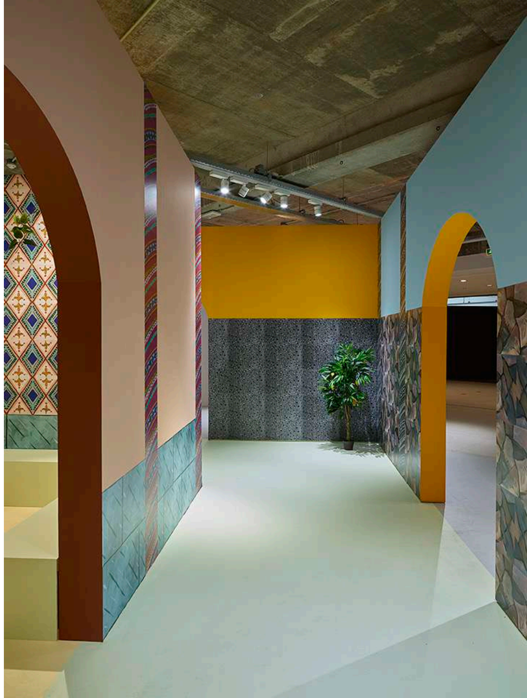
El Patio, Sensory Spaces 15, 2018 Installation view at Boijmans van Beuningen Museum, Rotterdam