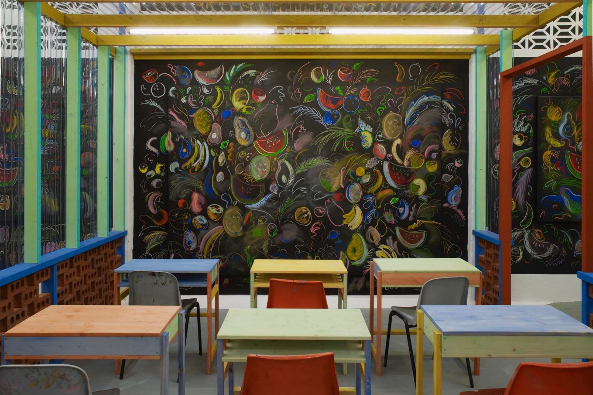
La Escuela del Sur , 2015 Installation view at Studio Voltaire, London