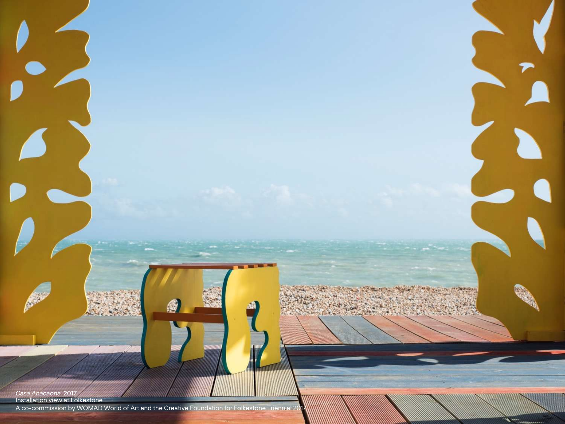
Casa Anacaona, 2017 Installation view at Folkestone

A co-commission by WOMAD World of Art and the Creative Foundation for Folkestone Triennial 2017