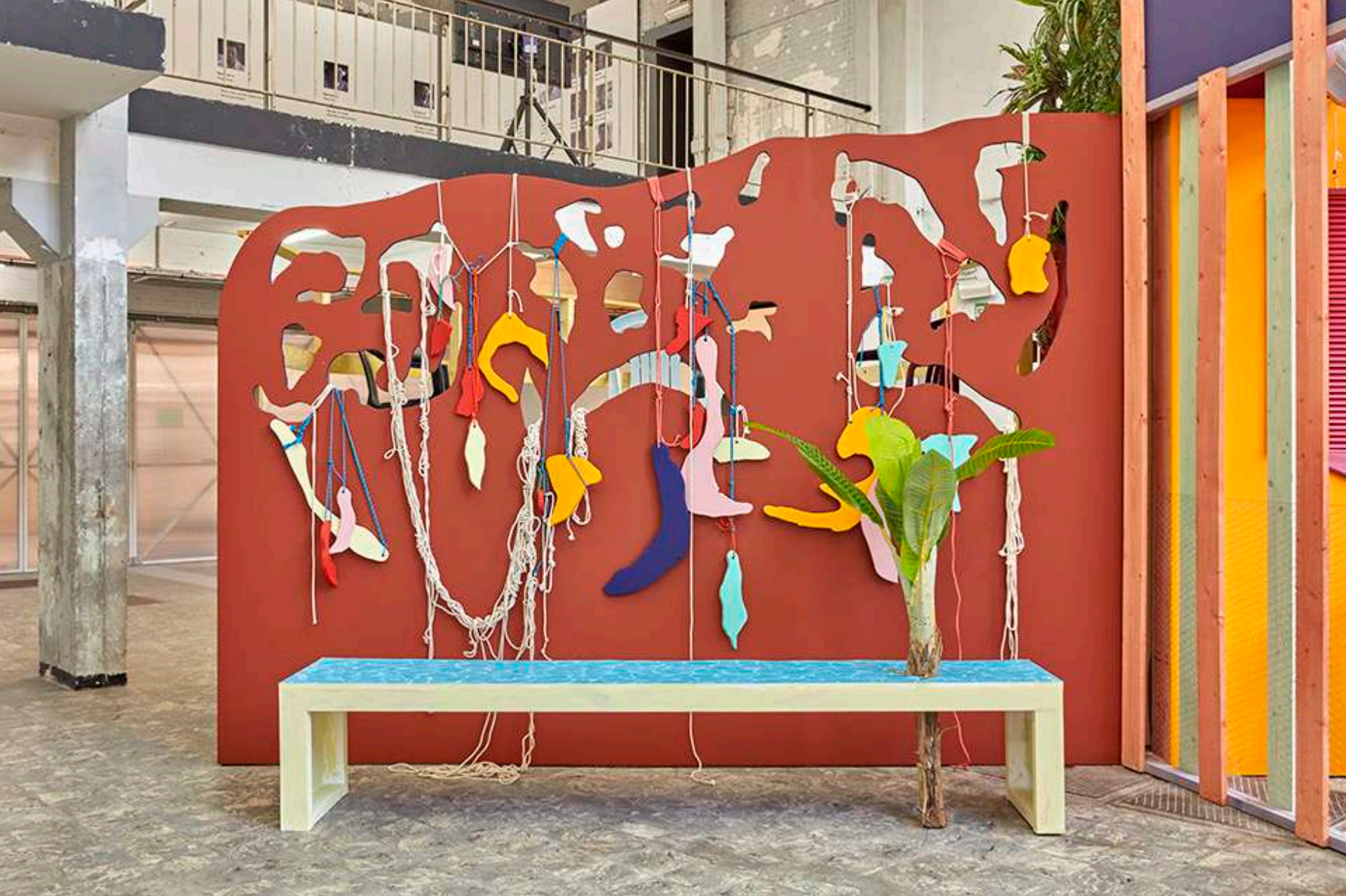
Isla , 2019 Installation view at Extra City, Antwerp