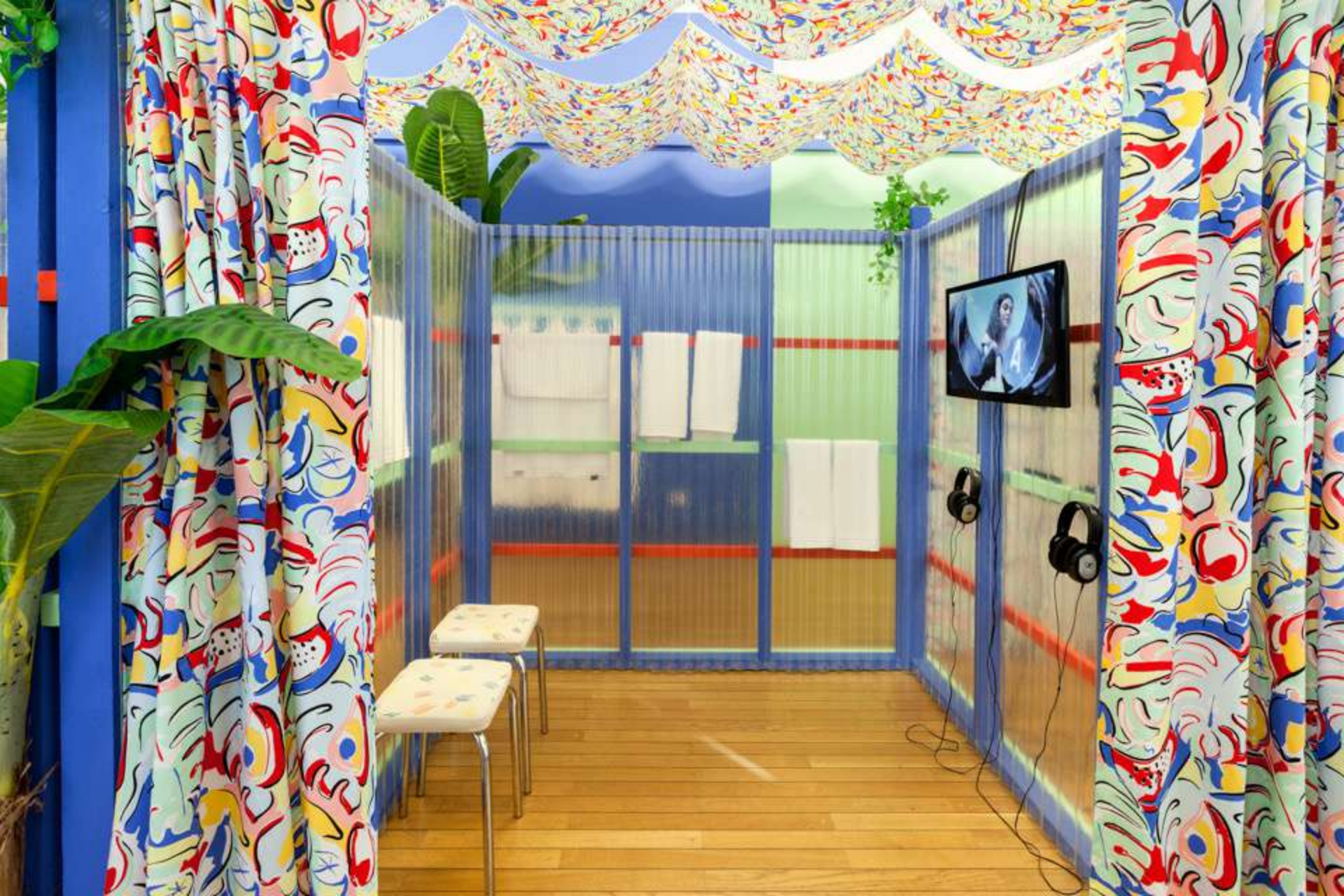
La Sauna Caliente , 2016 Installation view at KUB Collection Showcase, Bregenz