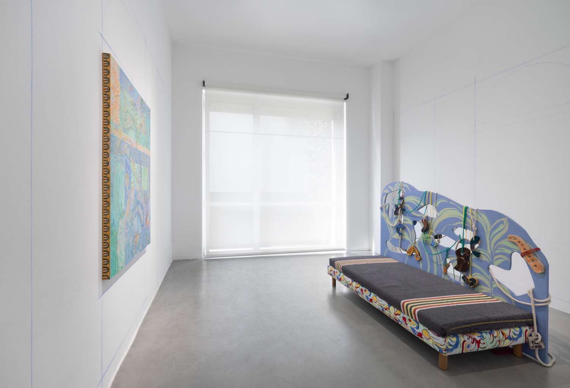
Casa encontrada , 2023 Installation view at Francesca Minini, Milan