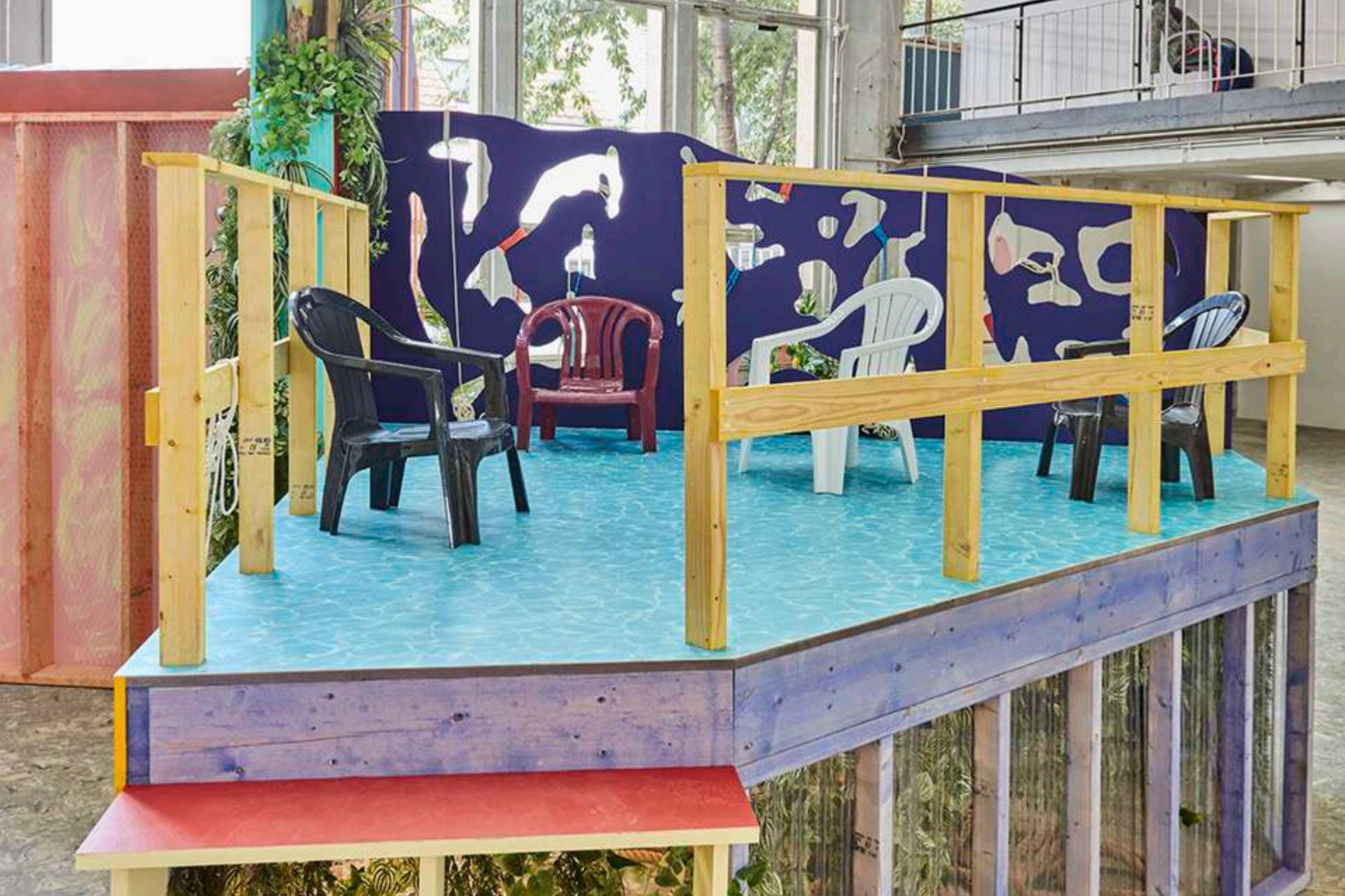
Isla , 2019 Installation view at Extra City, Antwerp