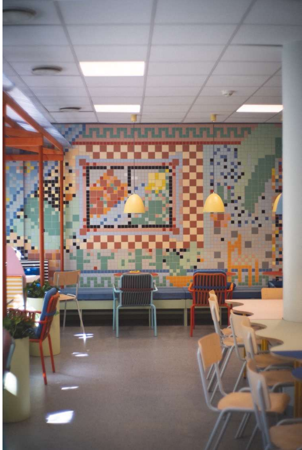
La Cantine de La Touriste , 2022 Installation view at Bergen Assembly, Bergen