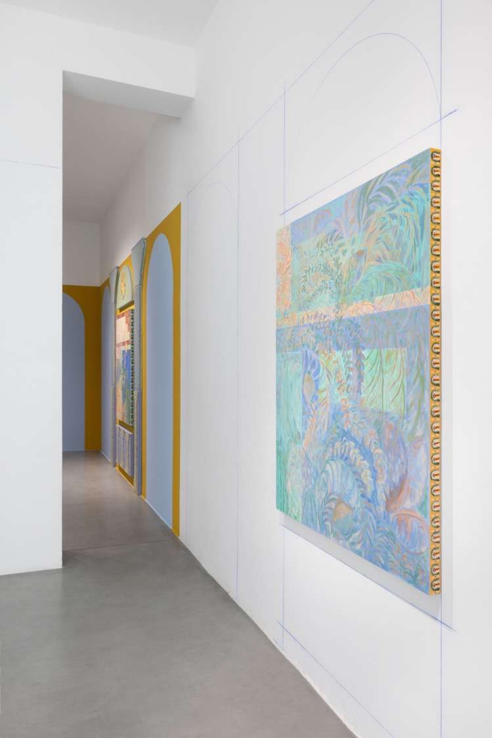
Casa encontrada , 2023 Installation view at Francesca Minini, Milan