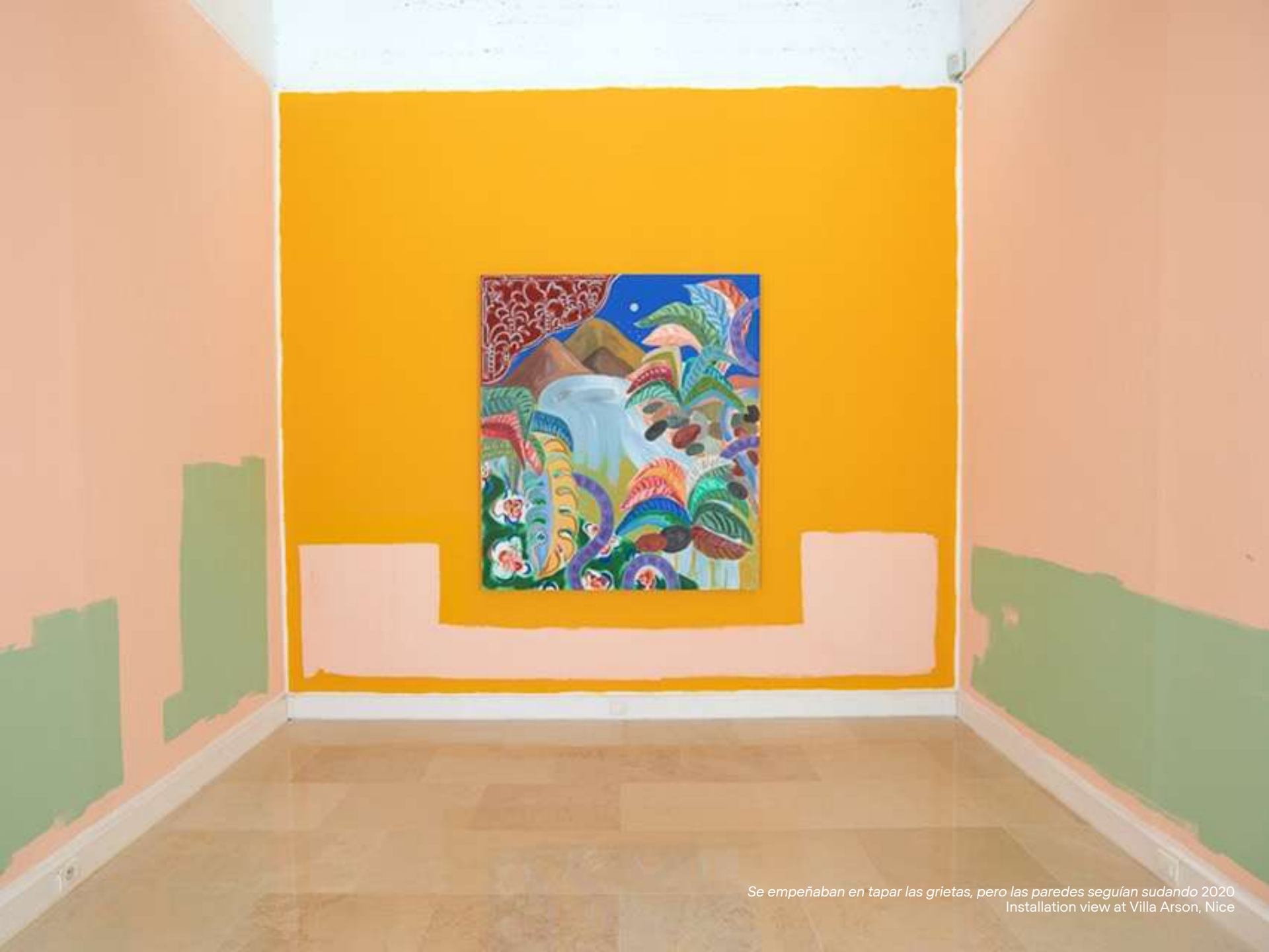
Se empeñaban en tapar las grietas, pero las paredes seguían sudando 2020 Installation view at Villa Arson, Nice