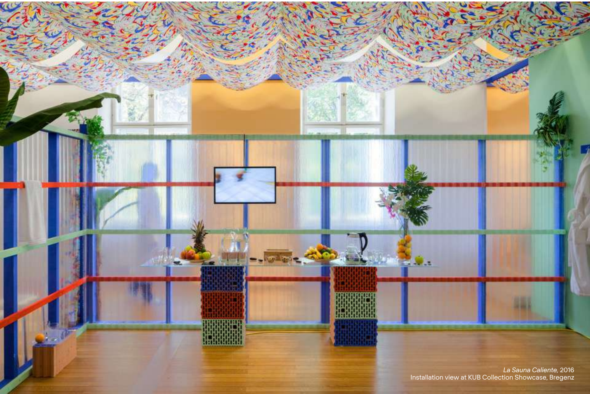
La Sauna Caliente , 2016 Installation view at KUB Collection Showcase, Bregenz