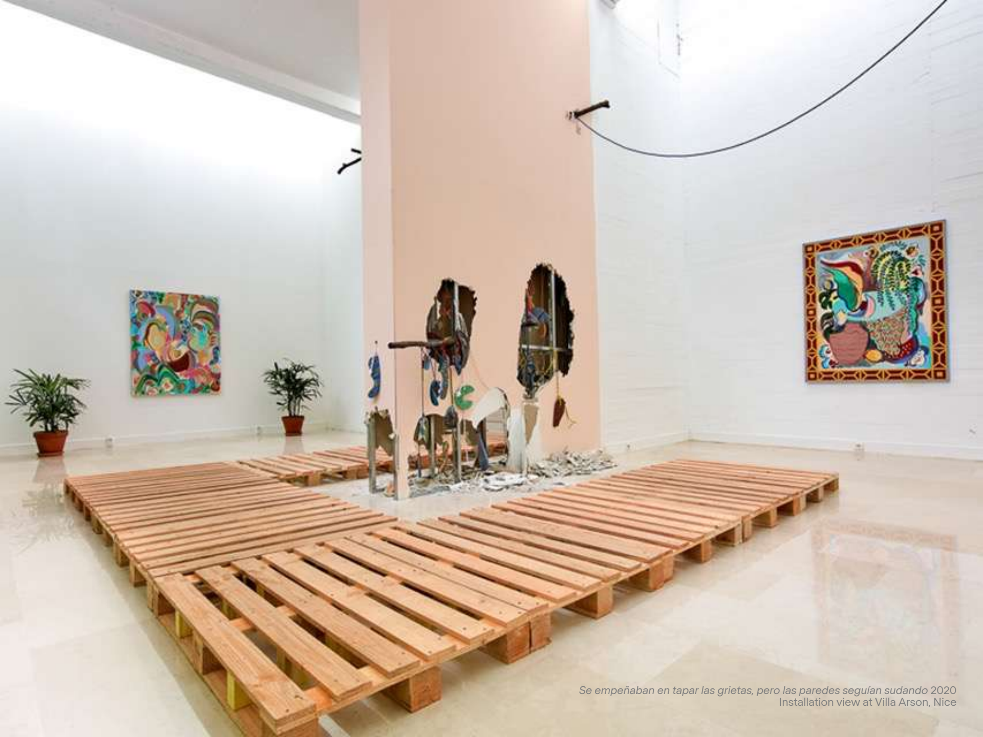
Se empeñaban en tapar las grietas, pero las paredes seguían sudando 2020 Installation view at Villa Arson, Nice