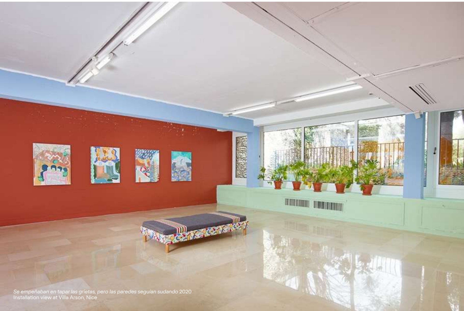
Se empeñaban en tapar las grietas, pero las paredes seguían sudando 2020 Installation view at Villa Arson, Nice