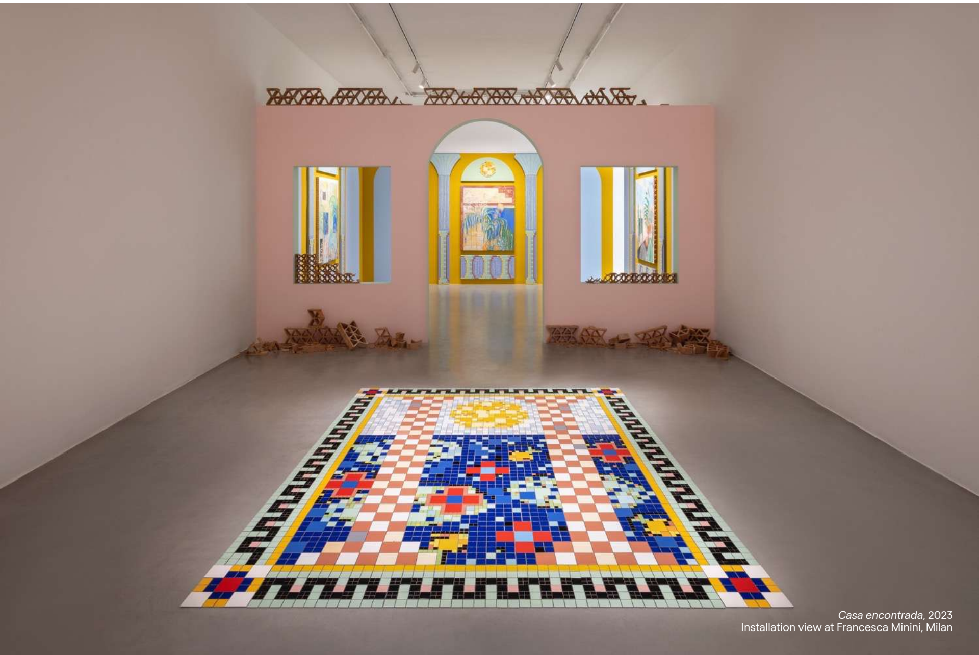
Casa encontrada , 2023 Installation view at Francesca Minini, Milan