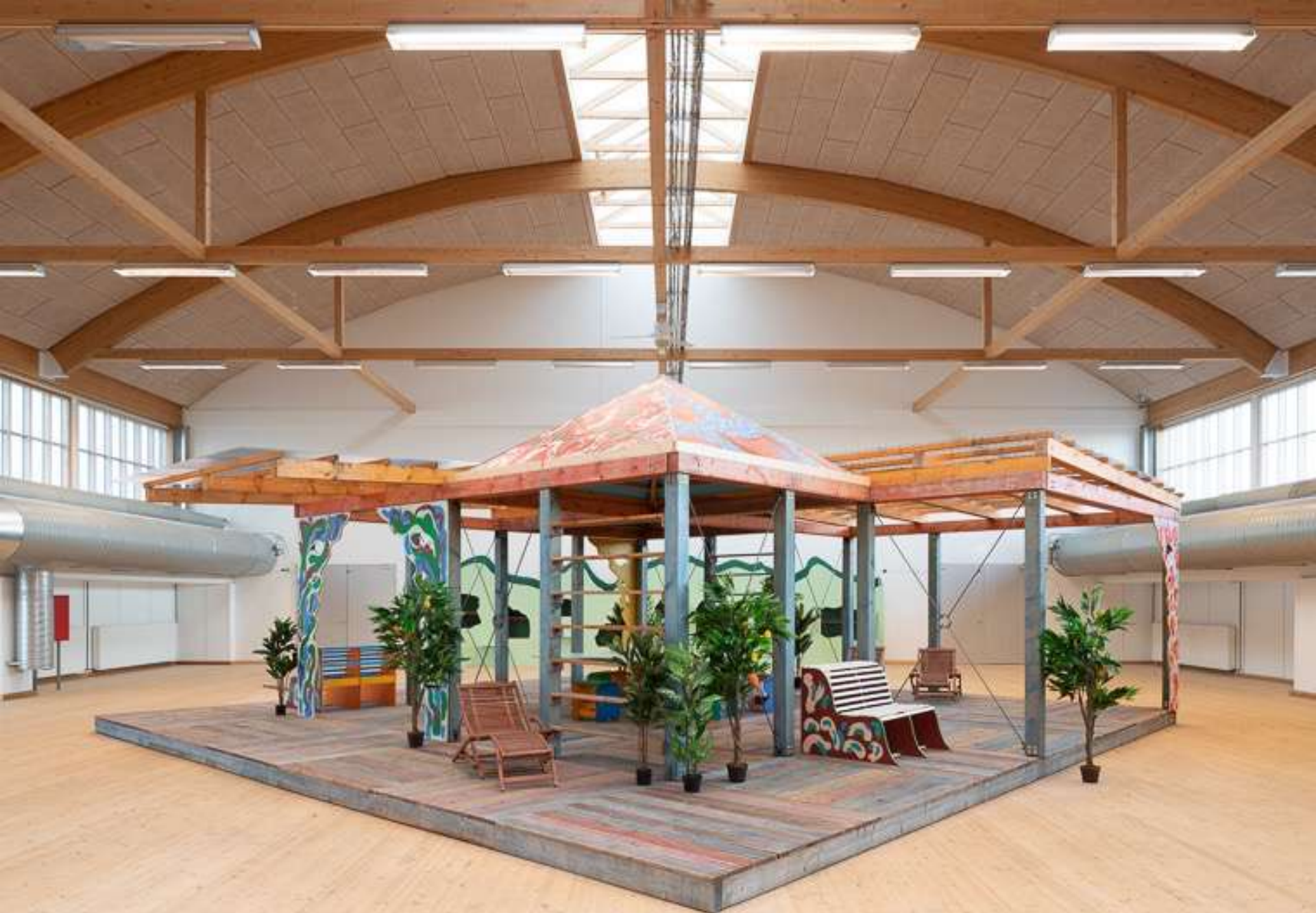
El barco de piedra (The Clay Ship) , 2020 Installation view at Contemporary Copenhagen, Copenhagen