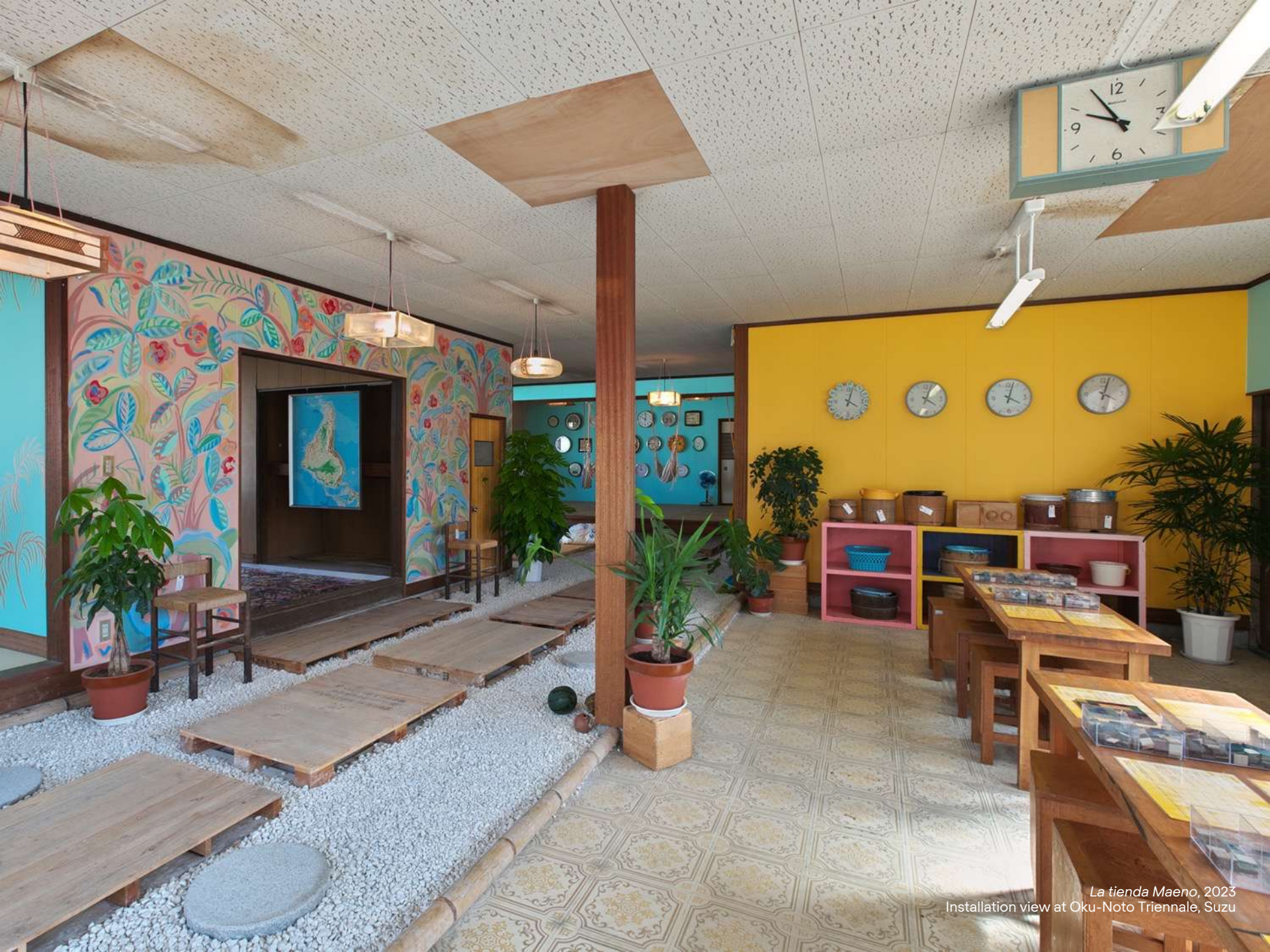
La tienda Maeno, 2023 Installation view at Oku-Noto Triennale, Suzu