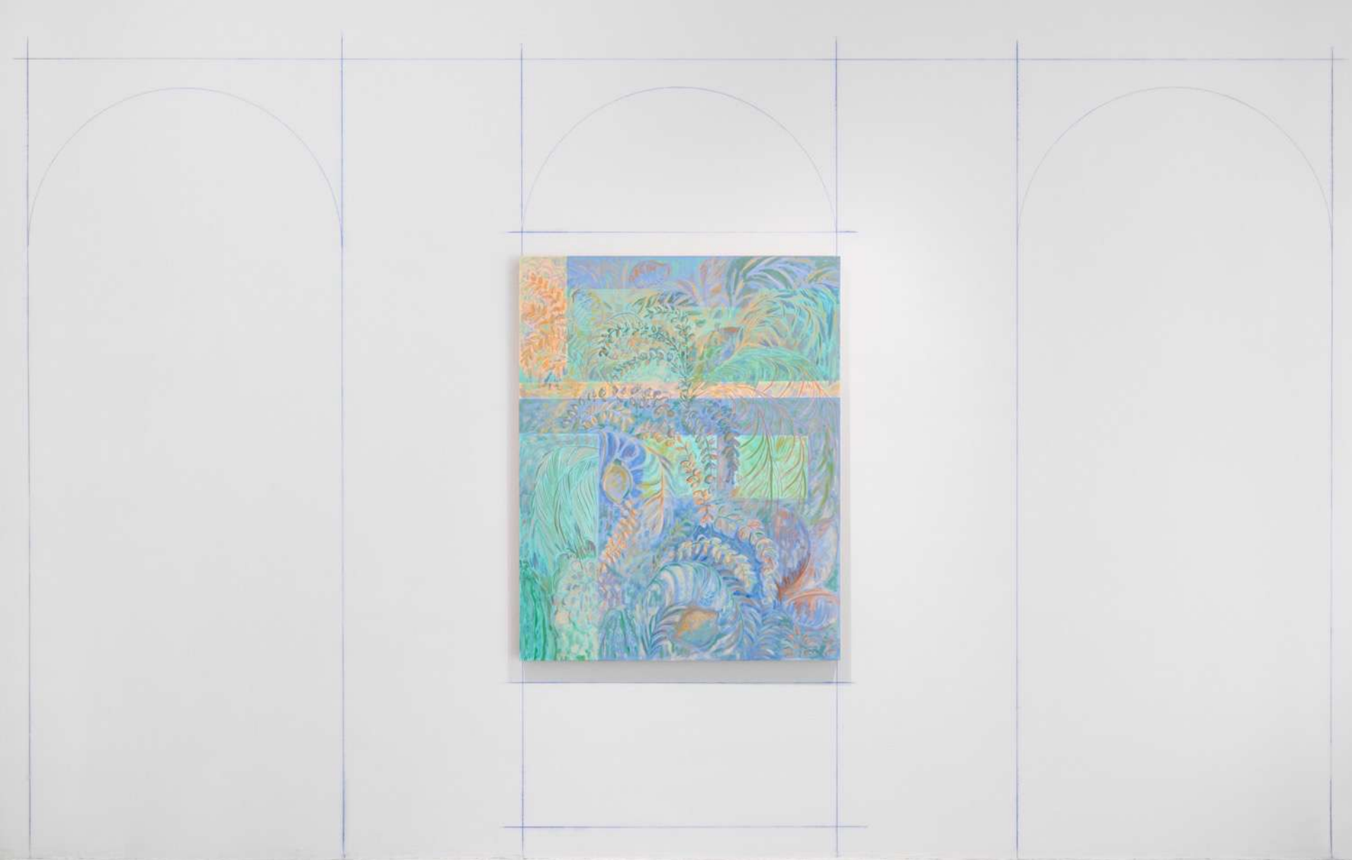
Casa encontrada , 2023 Installation view at Francesca Minini, Milan