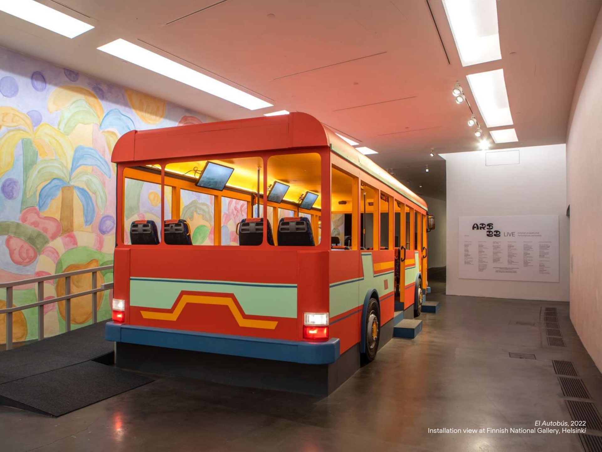
El Autobús, 2022 Installation view at Finnish National Gallery, Helsinki