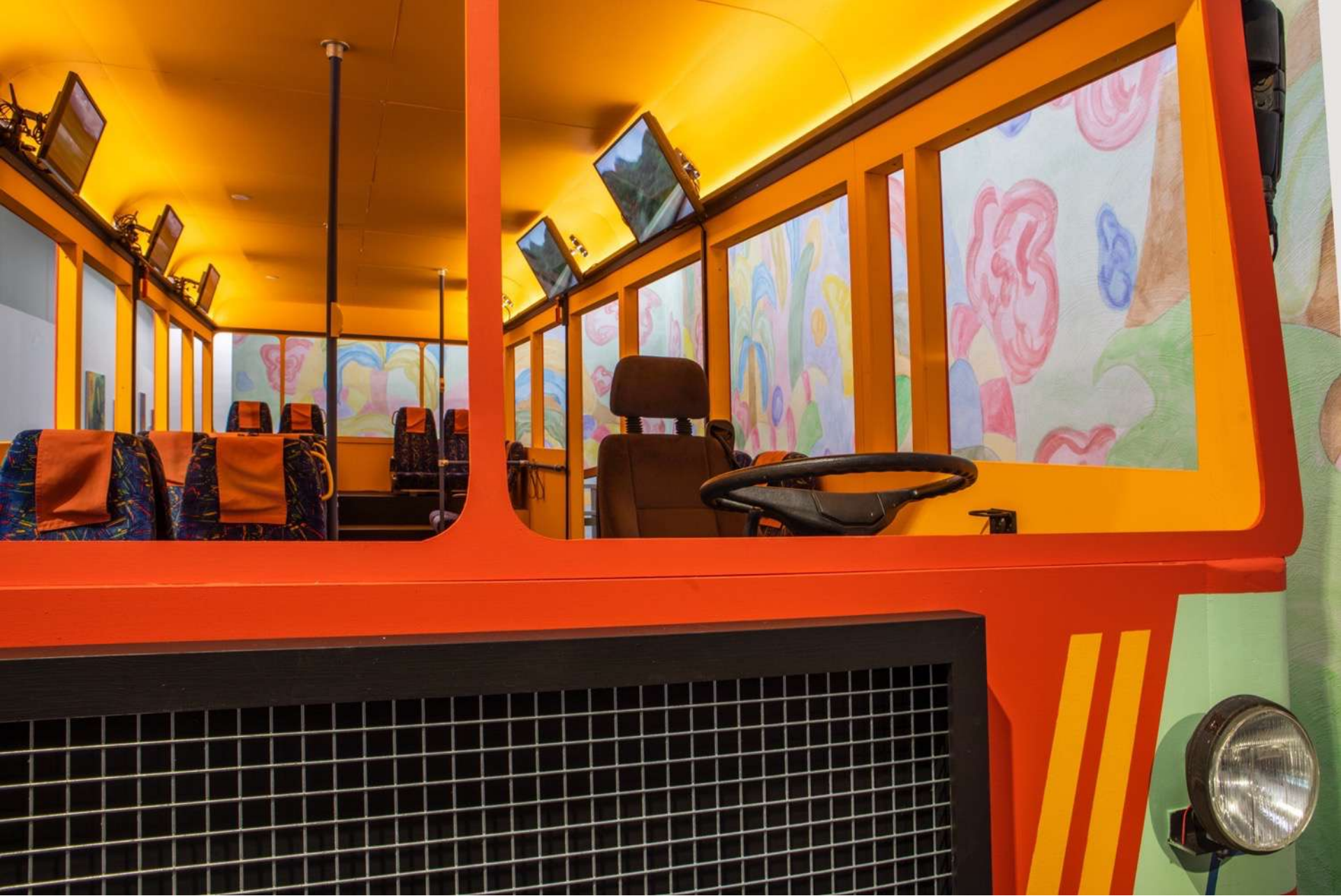
El Autobús , 2022 Installation view at Finnish National Gallery, Helsinki