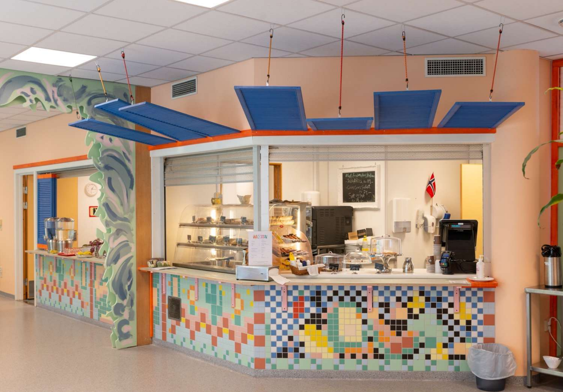
La Cantine de La Touriste, 2022 Installation view at Bergen Assembly, Bergen