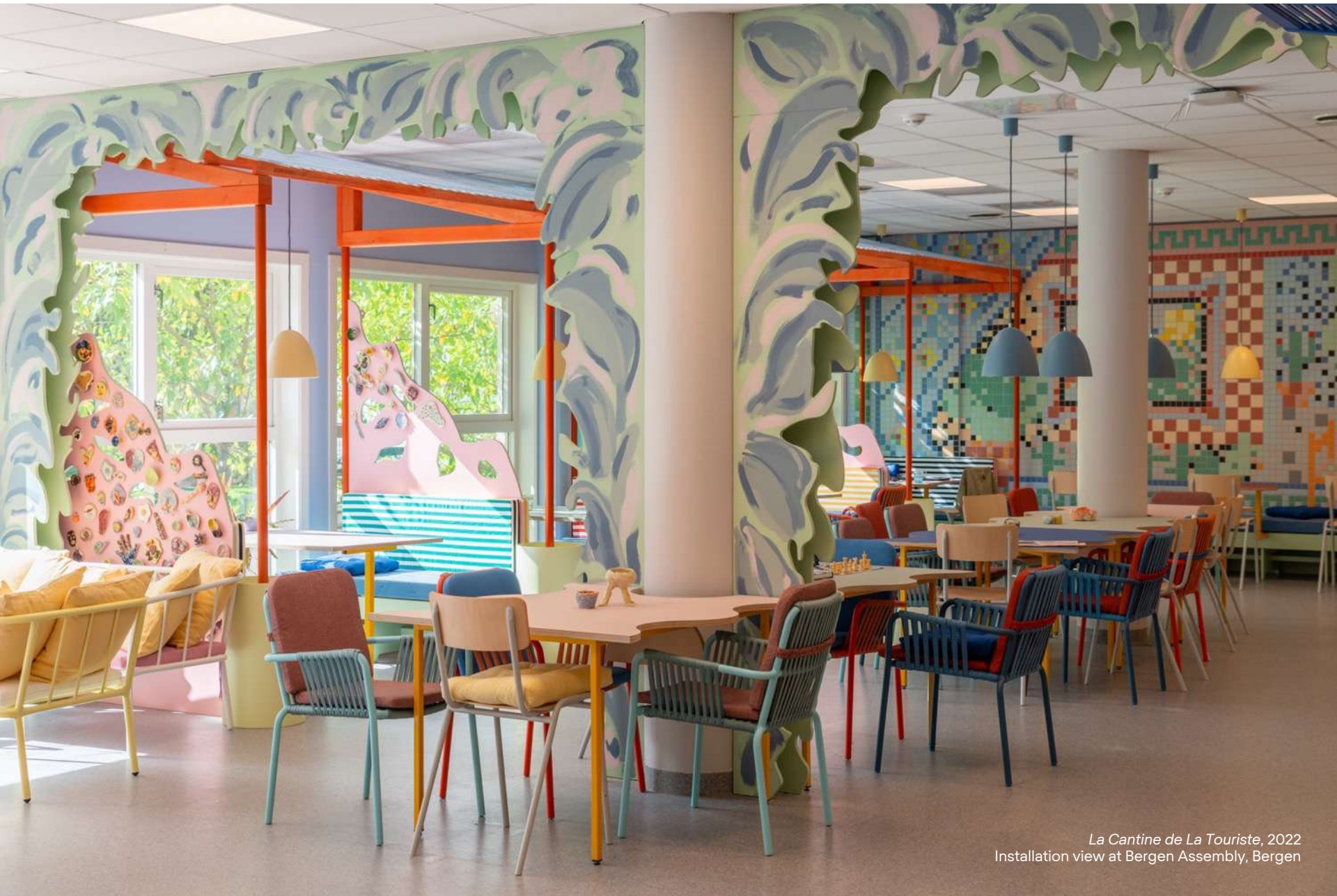
La Cantine de La Touriste, 2022 Installation view at Bergen Assembly, Bergen