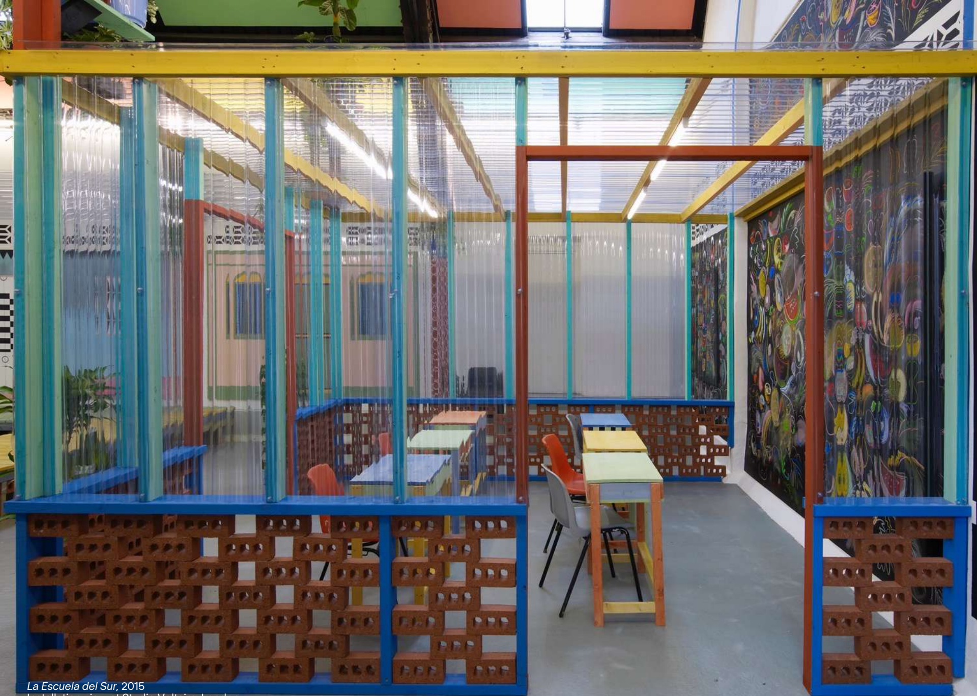
La Escuela del Sur , 2015 Installation view at Studio Voltaire, London