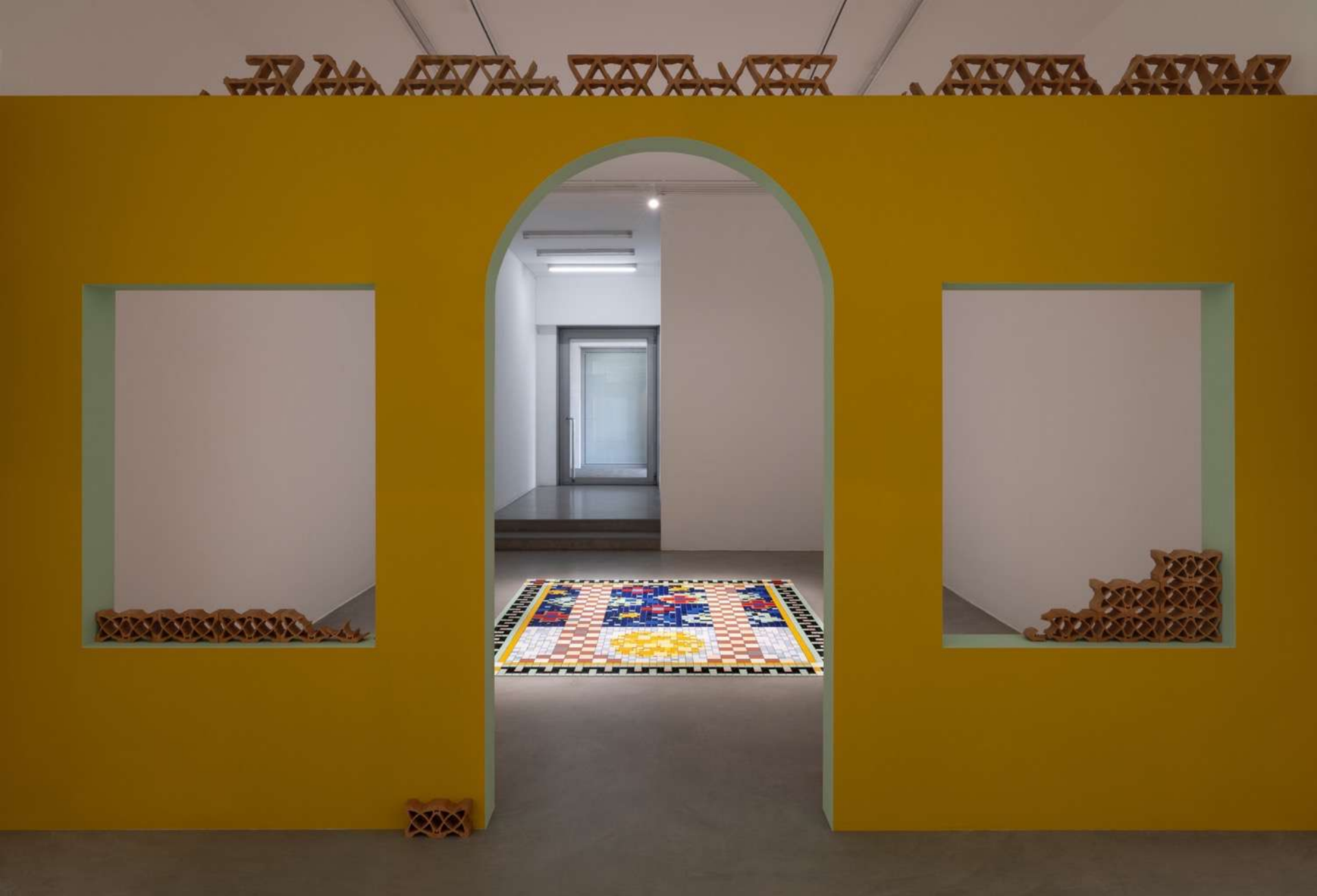
Casa encontrada , 2023 Installation view at Francesca Minini, Milan