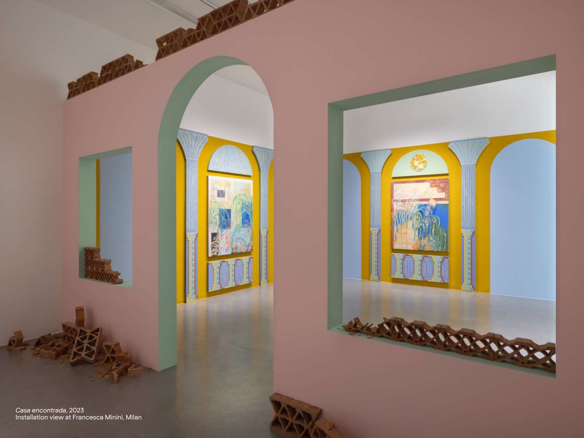
Casa encontrada , 2023 Installation view at Francesca Minini, Milan