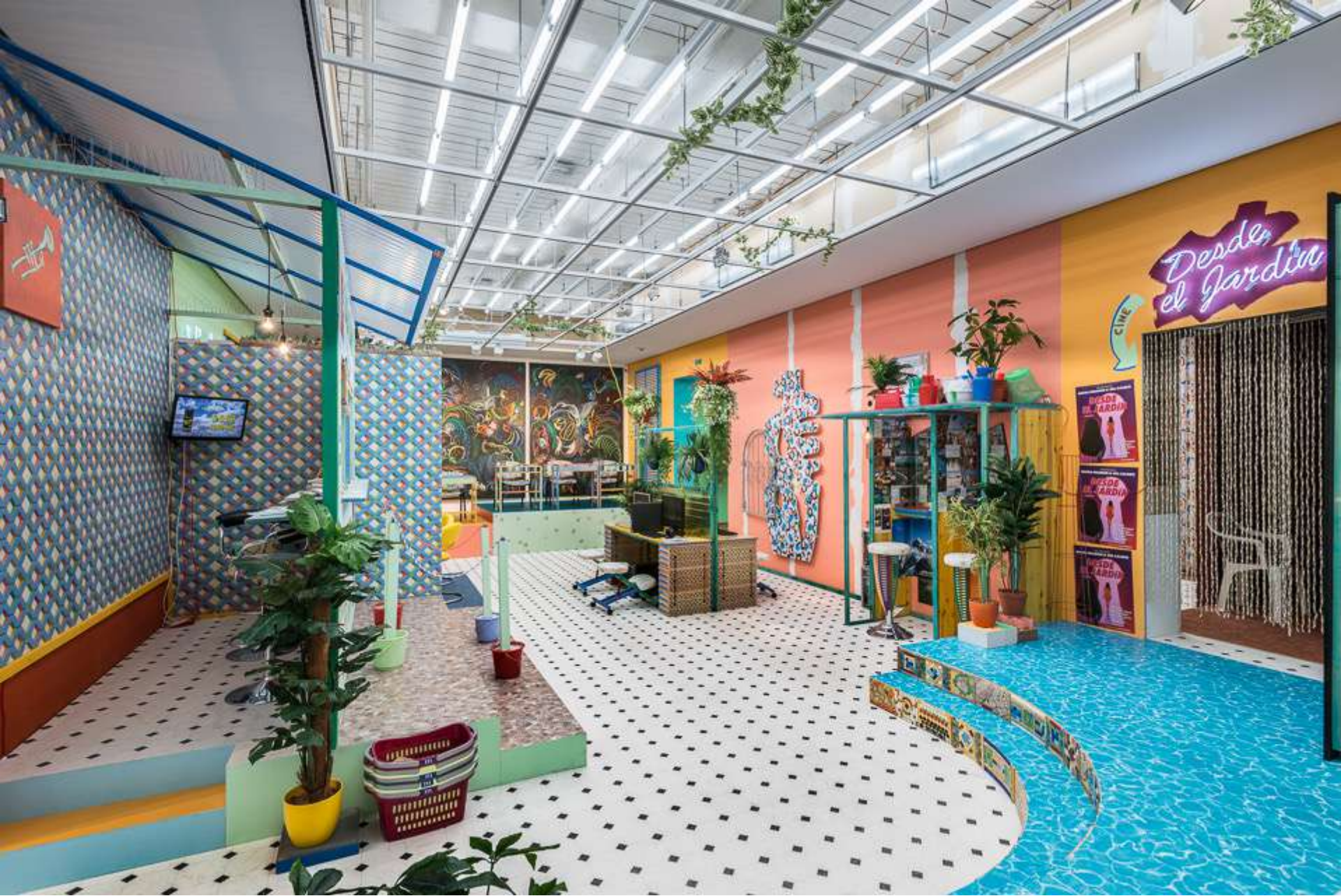
Amazonas Shopping Center, 2017 Installation view at Hamburger Bahnhof - Museum für Gegenwart, Berlin