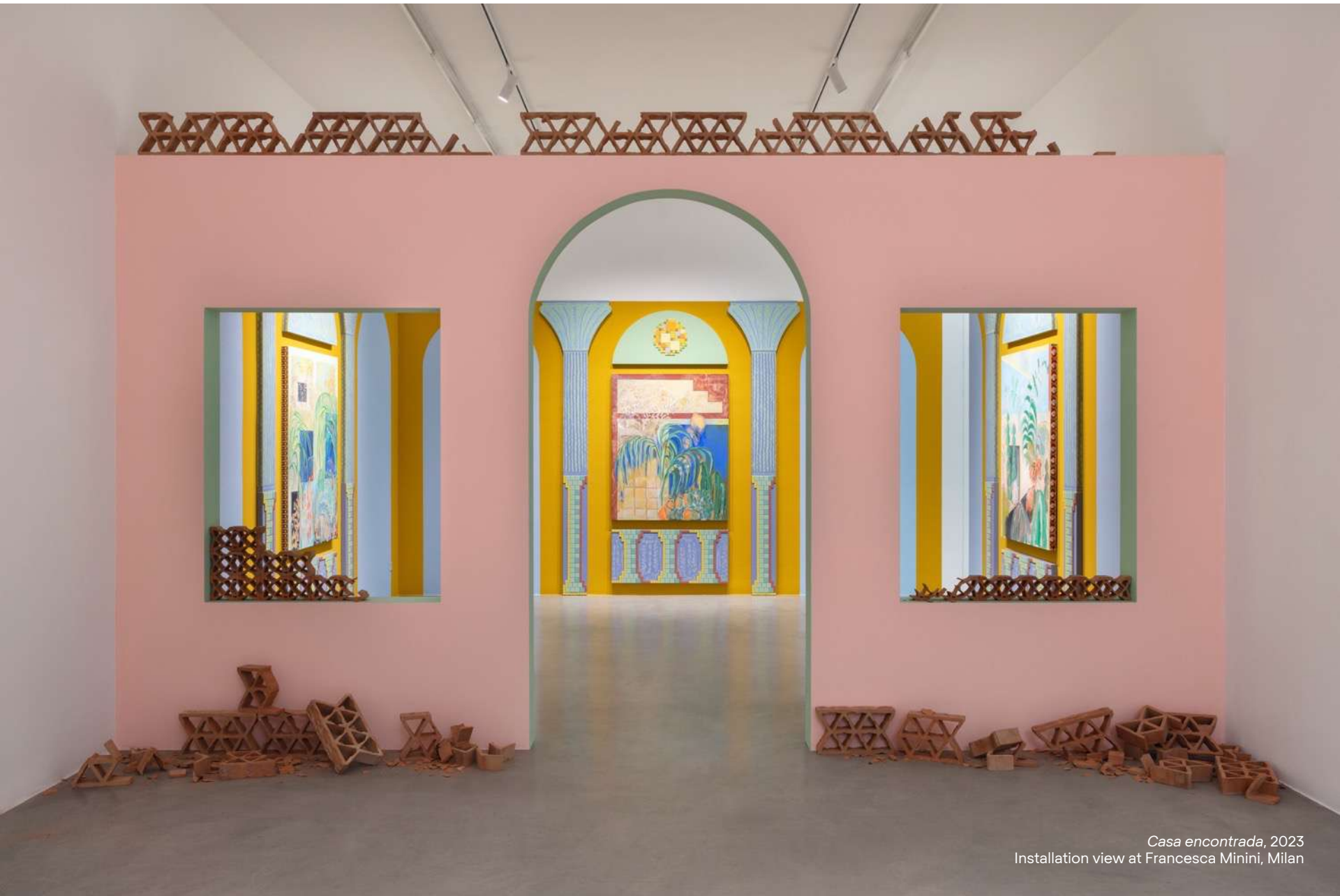
Casa encontrada, 2023 Installation view at Francesca Minini, Milan