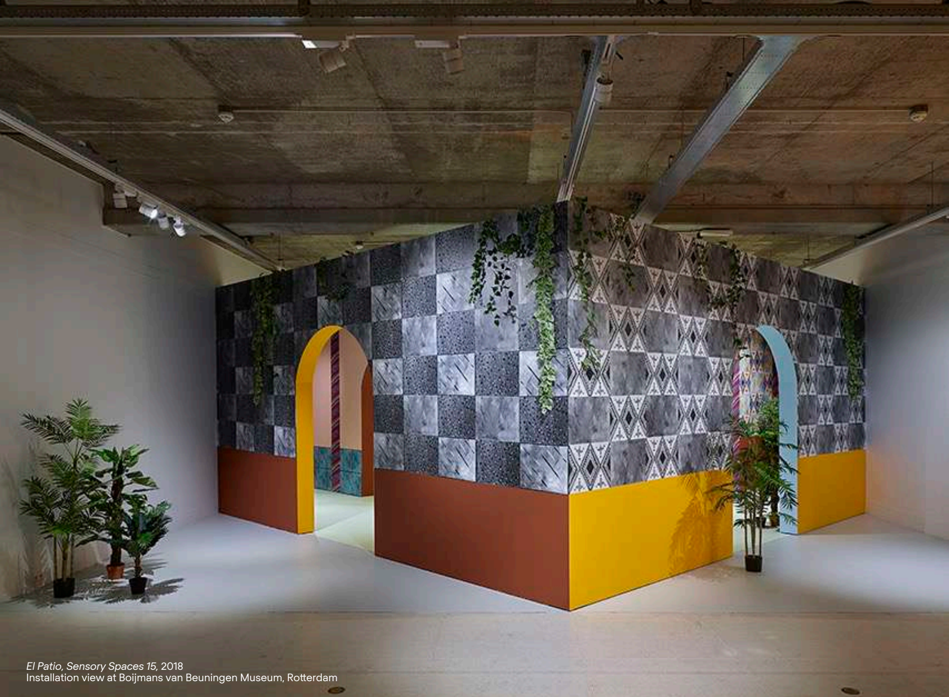
El Patio, Sensory Spaces 15, 2018 Installation view at Boijmans van Beuningen Museum, Rotterdam