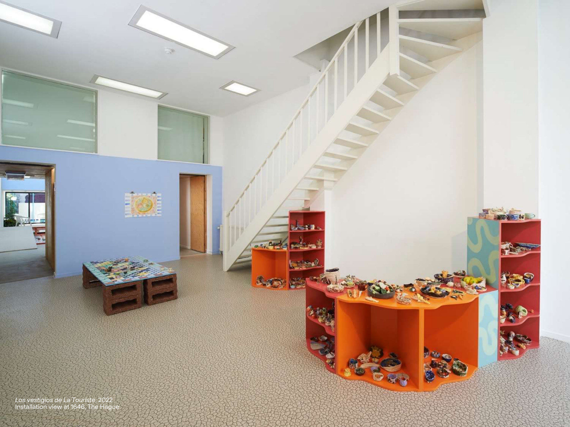
Los vestigios de La Touriste , 2022 Installation view at 1646, The Hague