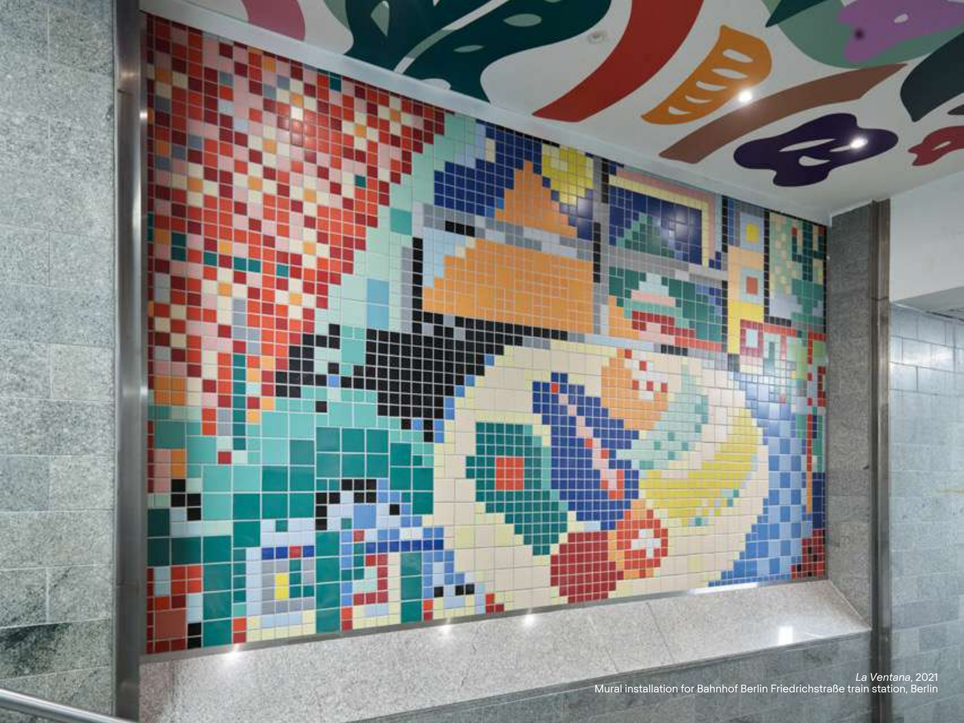
La Ventana, 2021 Mural installation for Bahnhof Berlin Friedrichstraße train station, Berlin