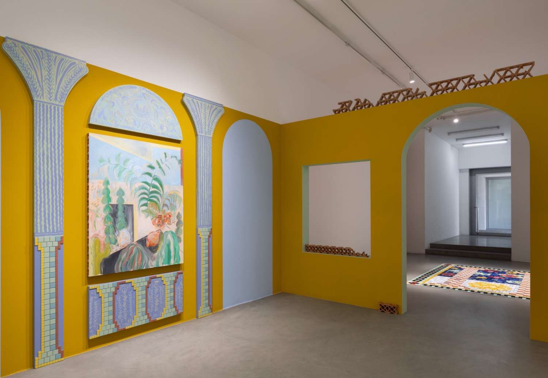
Casa encontrada , 2023 Installation view at Francesca Minini, Milan