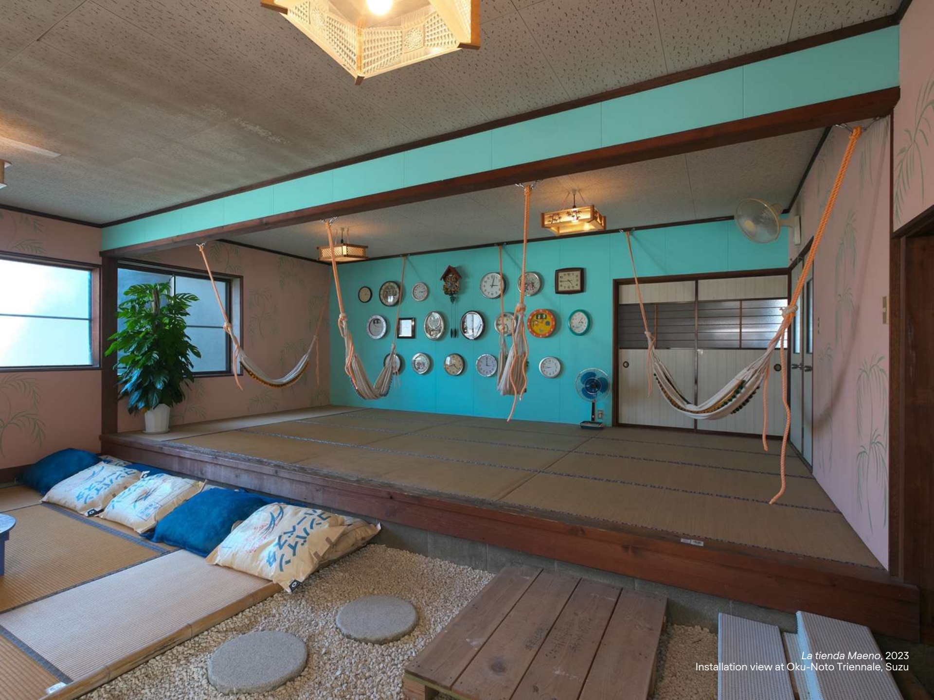
La tienda Maeno, 2023 Installation view at Oku-Noto Triennale, Suzu