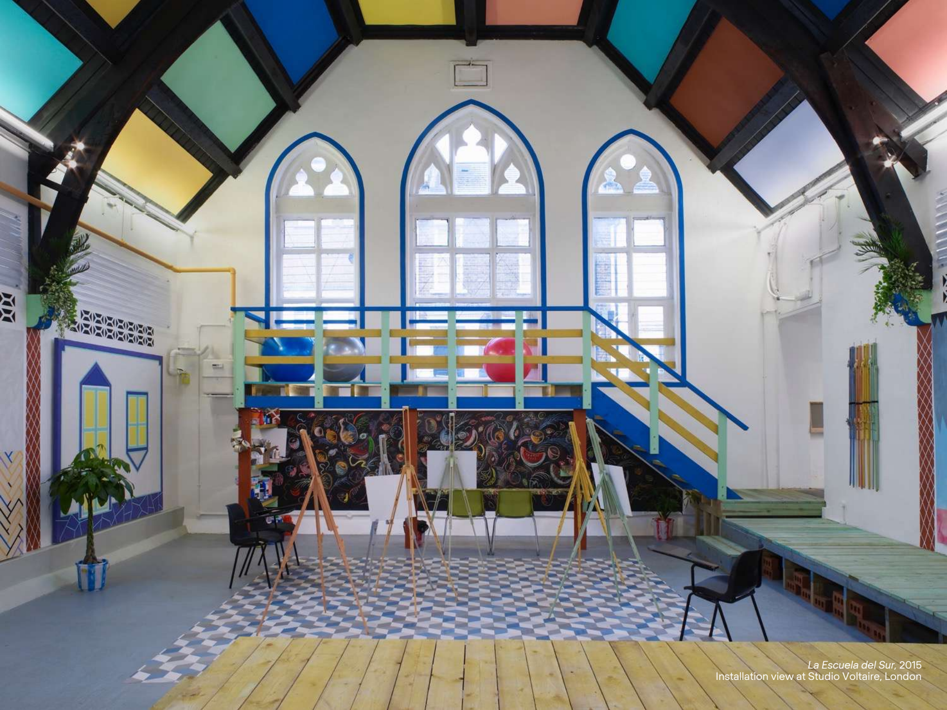
La Escuela del Sur , 2015 Installation view at Studio Voltaire, London