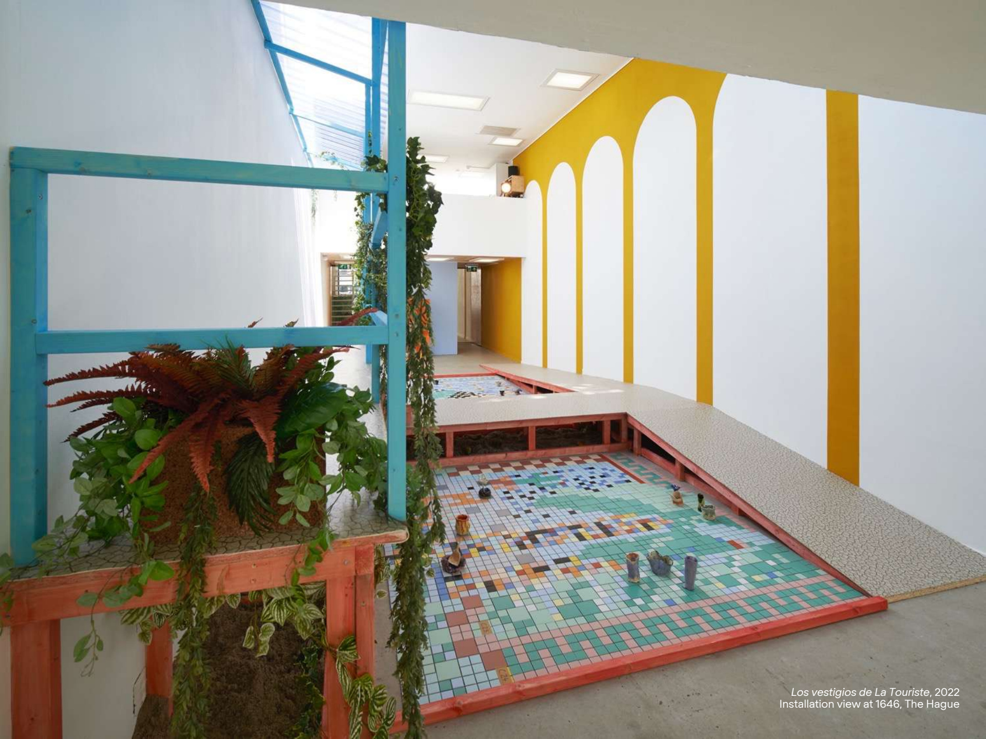
Los vestigios de La Touriste , 2022 Installation view at 1646, The Hague