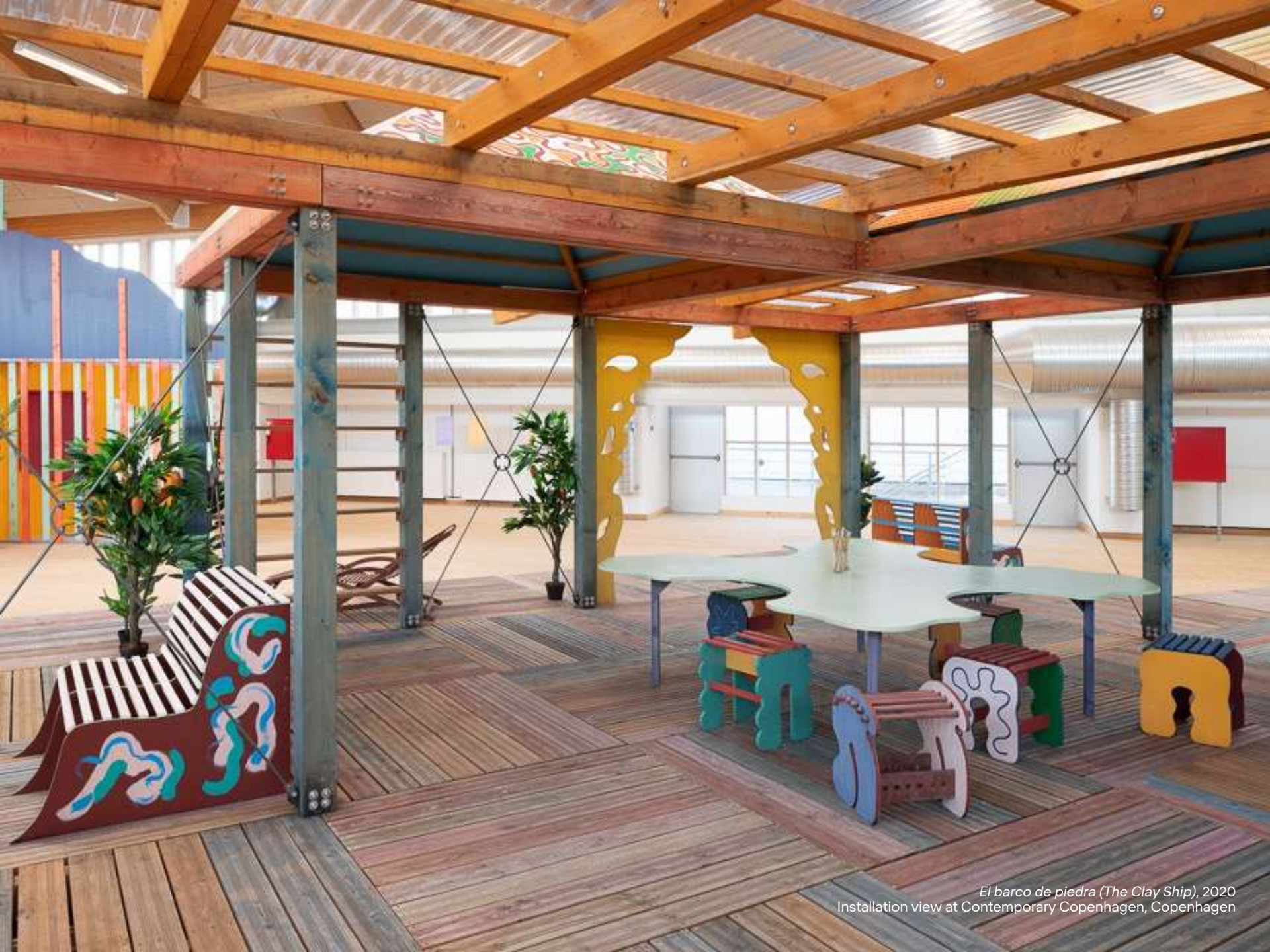
El barco de piedra (The Clay Ship), 2020 Installation view at Contemporary Copenhagen, Copenhagen