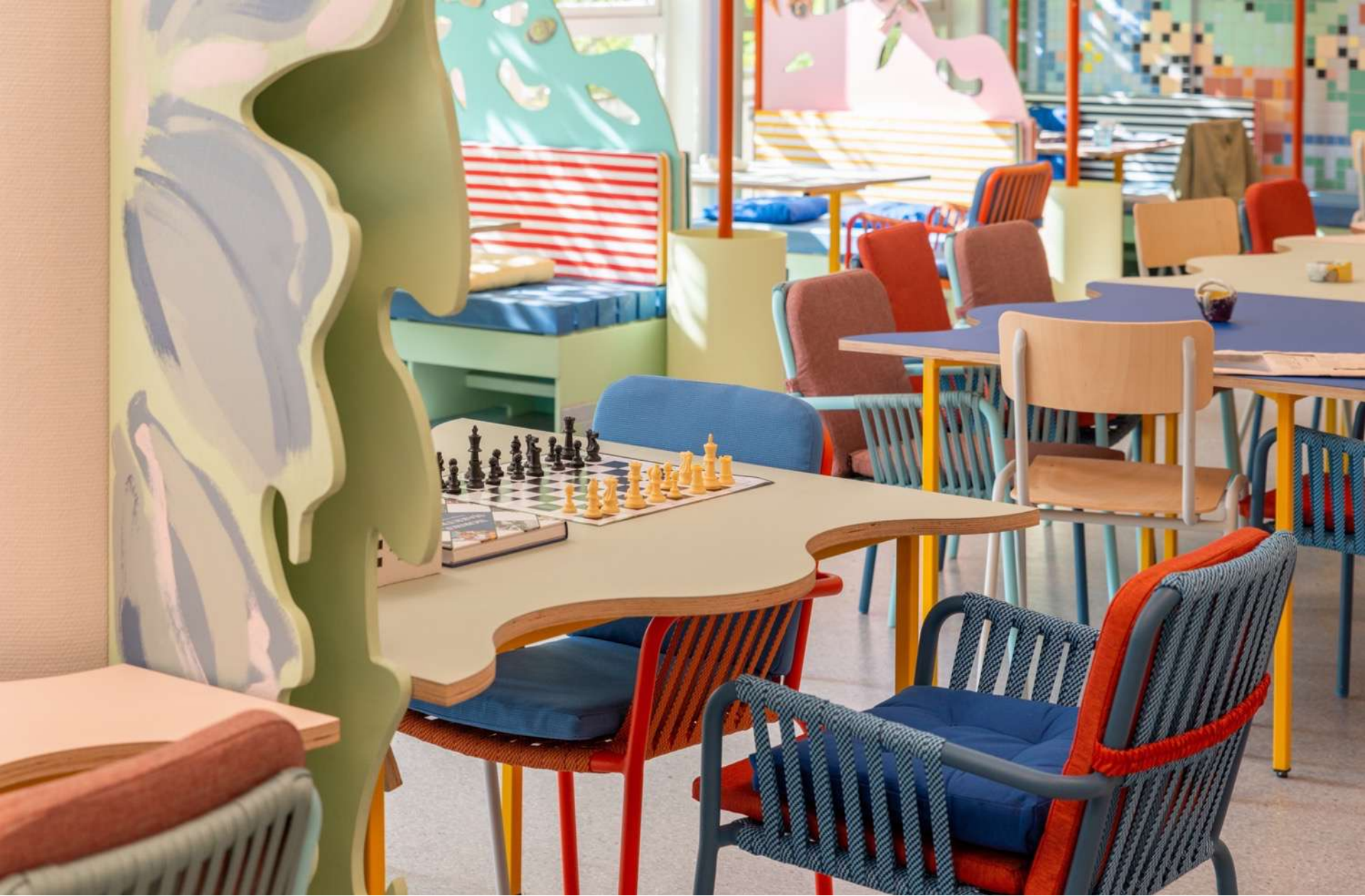
La Cantine de La Touriste, 2022 Installation view at Bergen Assembly, Bergen