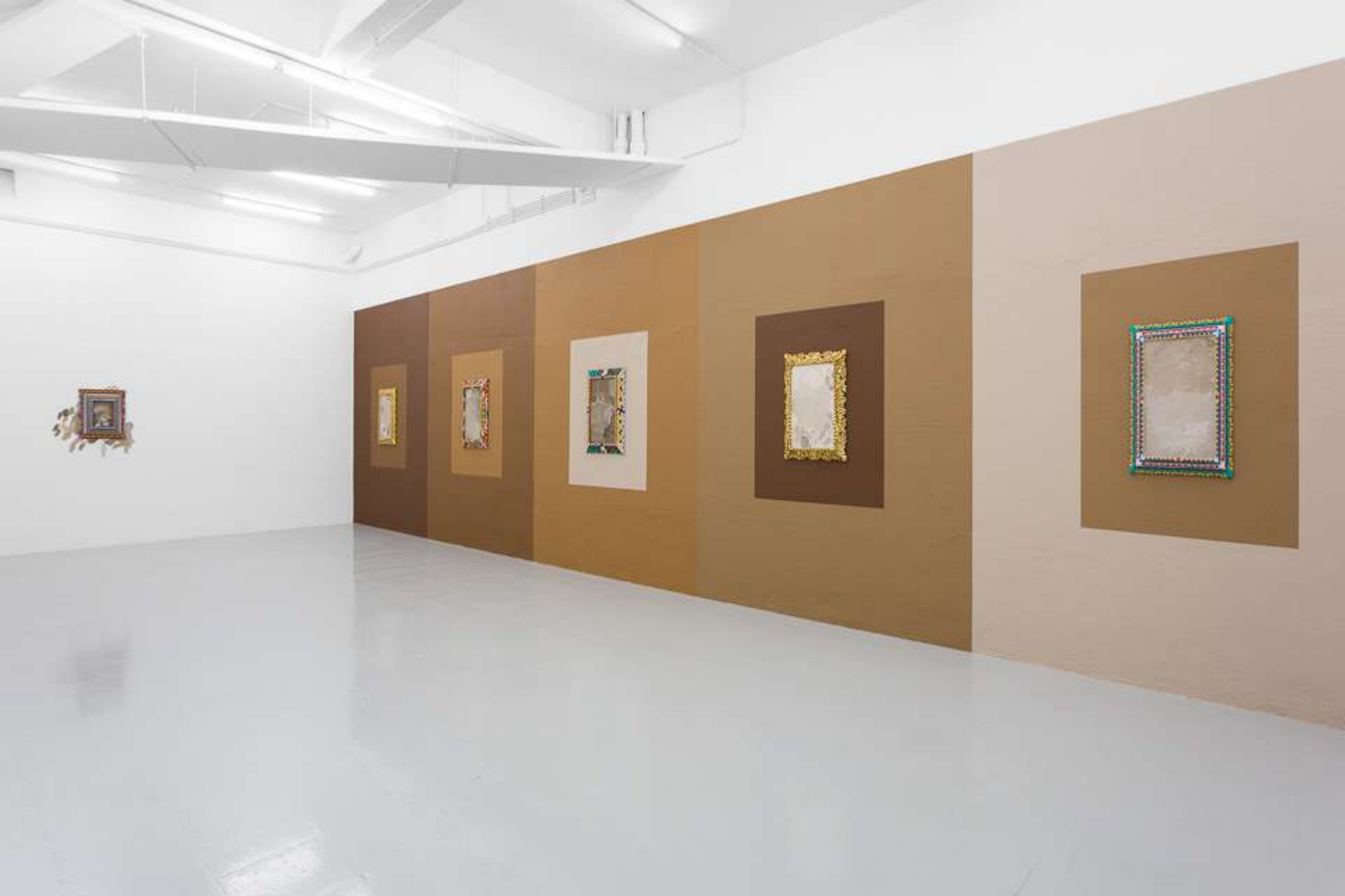
Tente en el aire , 2018 Installation view at Kunsthalle Lissabon, Lisbon