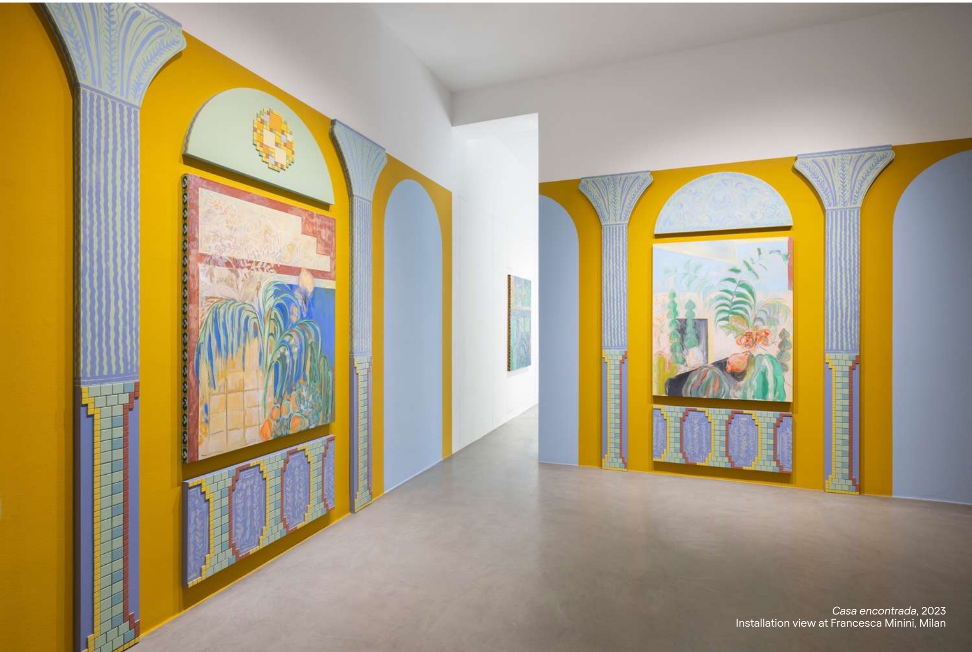
Casa encontrada , 2023 Installation view at Francesca Minini, Milan