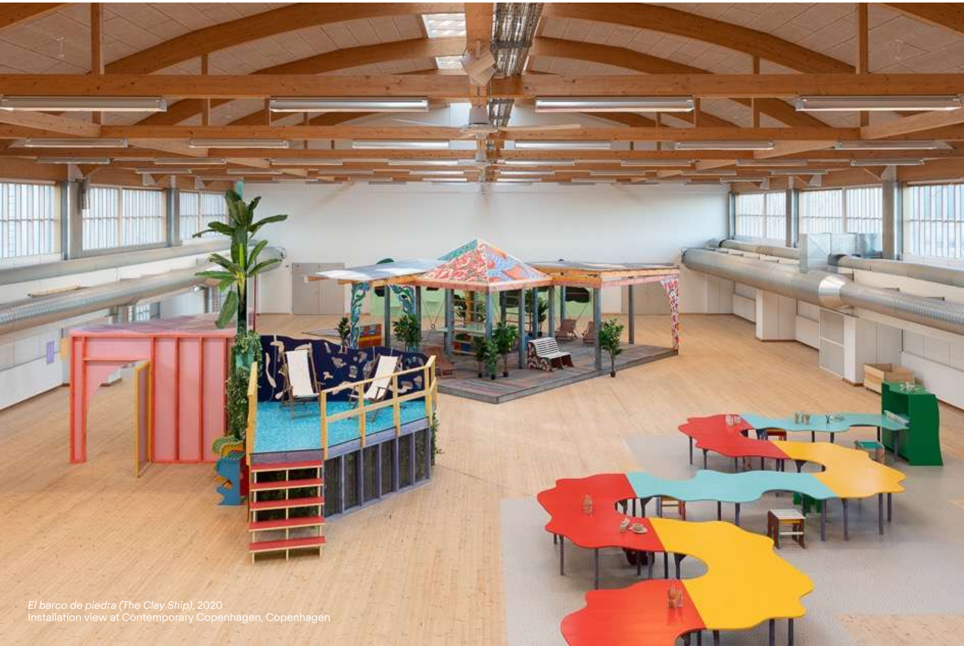
El barco de piedra (The Clay Ship) , 2020 Installation view at Contemporary Copenhagen, Copenhagen