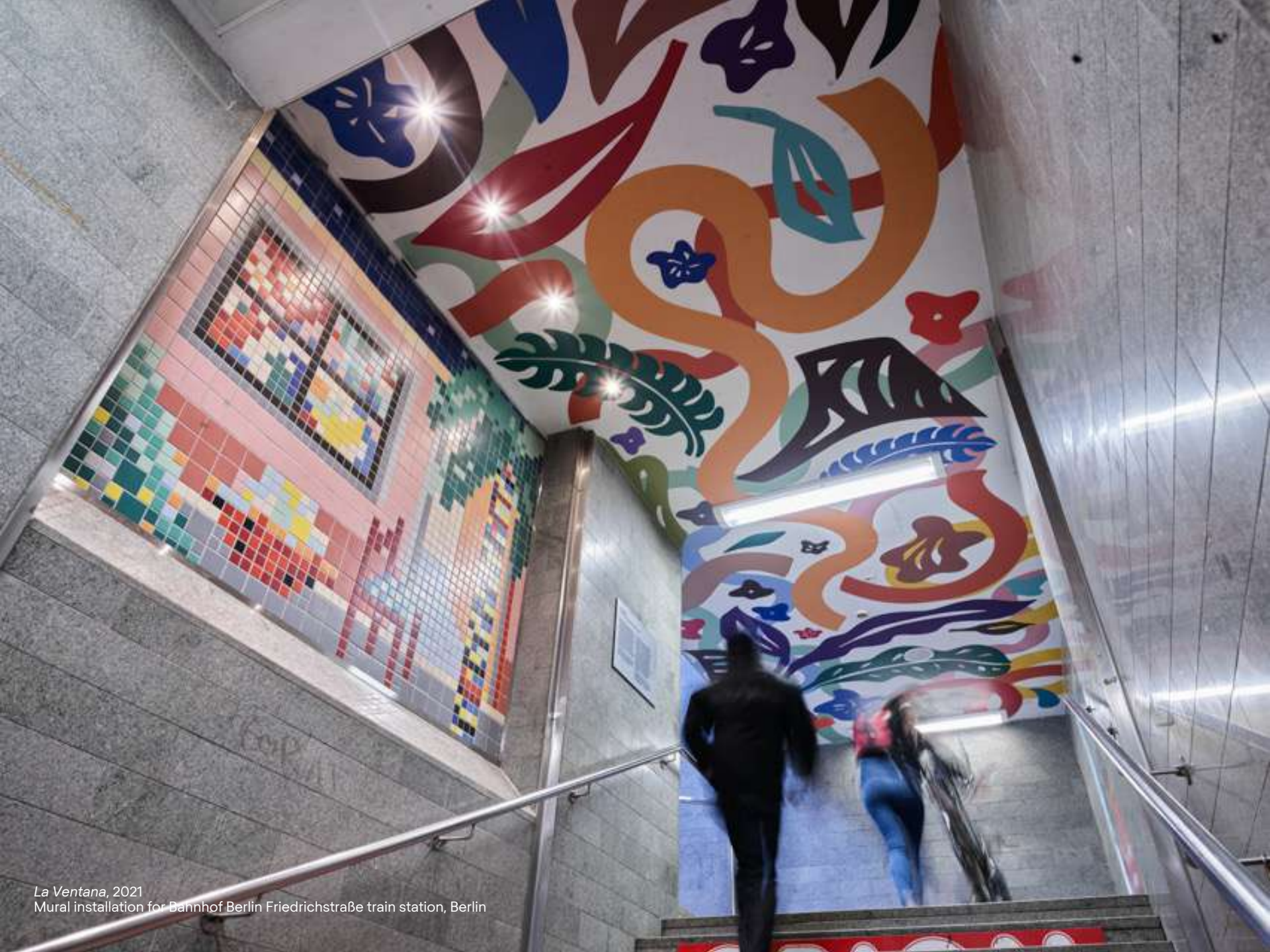
La Ventana , 2021 Mural installation for Bahnhof Berlin Friedrichstraße train station, Berlin