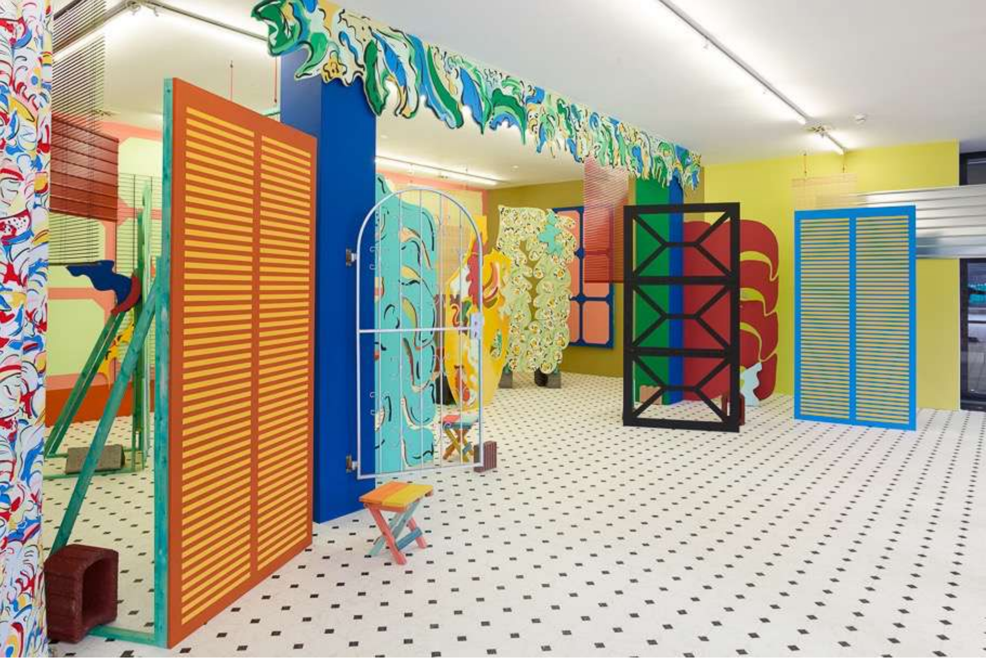
Interiores , 2017 Installation view at Dortmunder Kunstverein, Dortmund