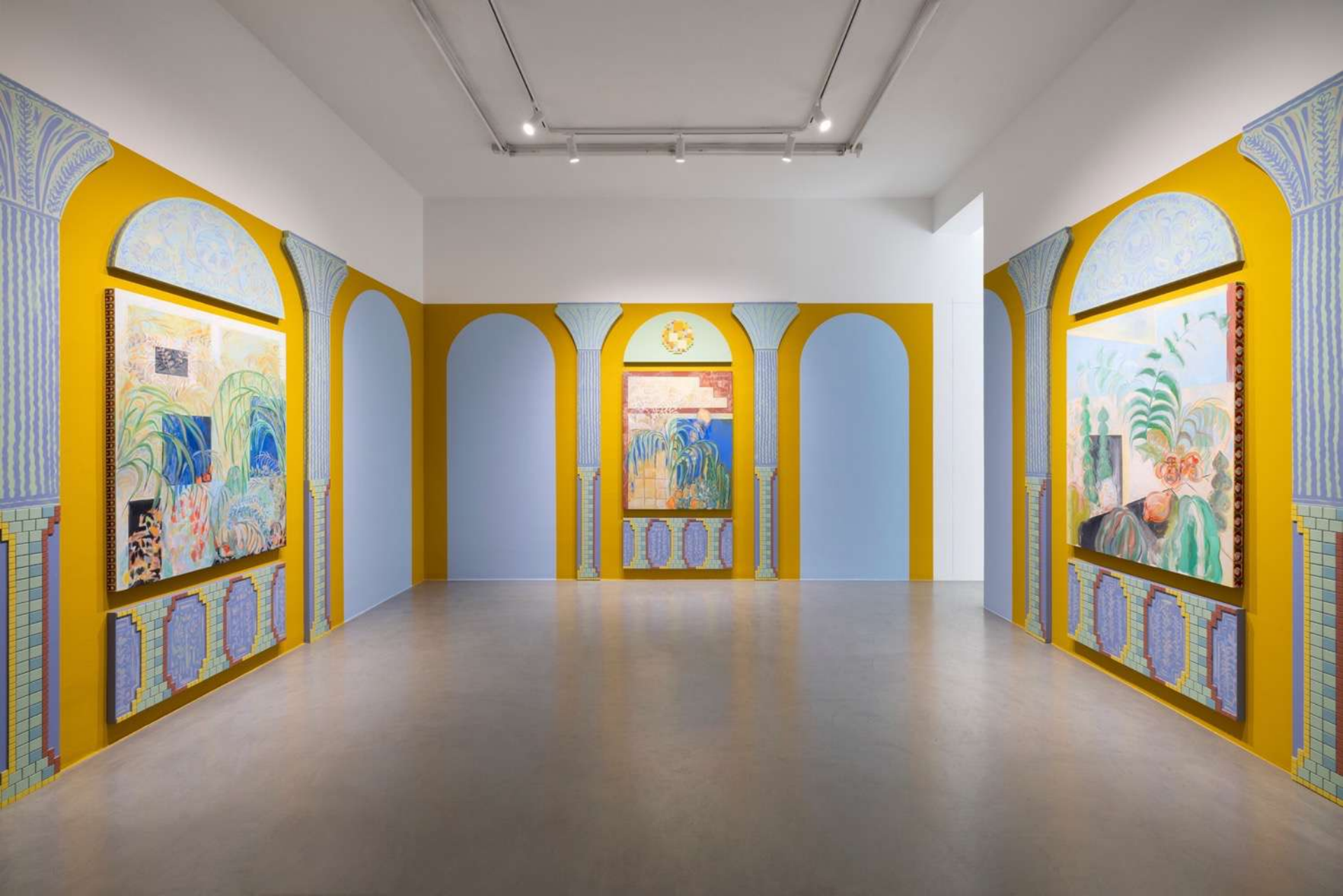
Casa encontrada , 2023 Installation view at Francesca Minini, Milan