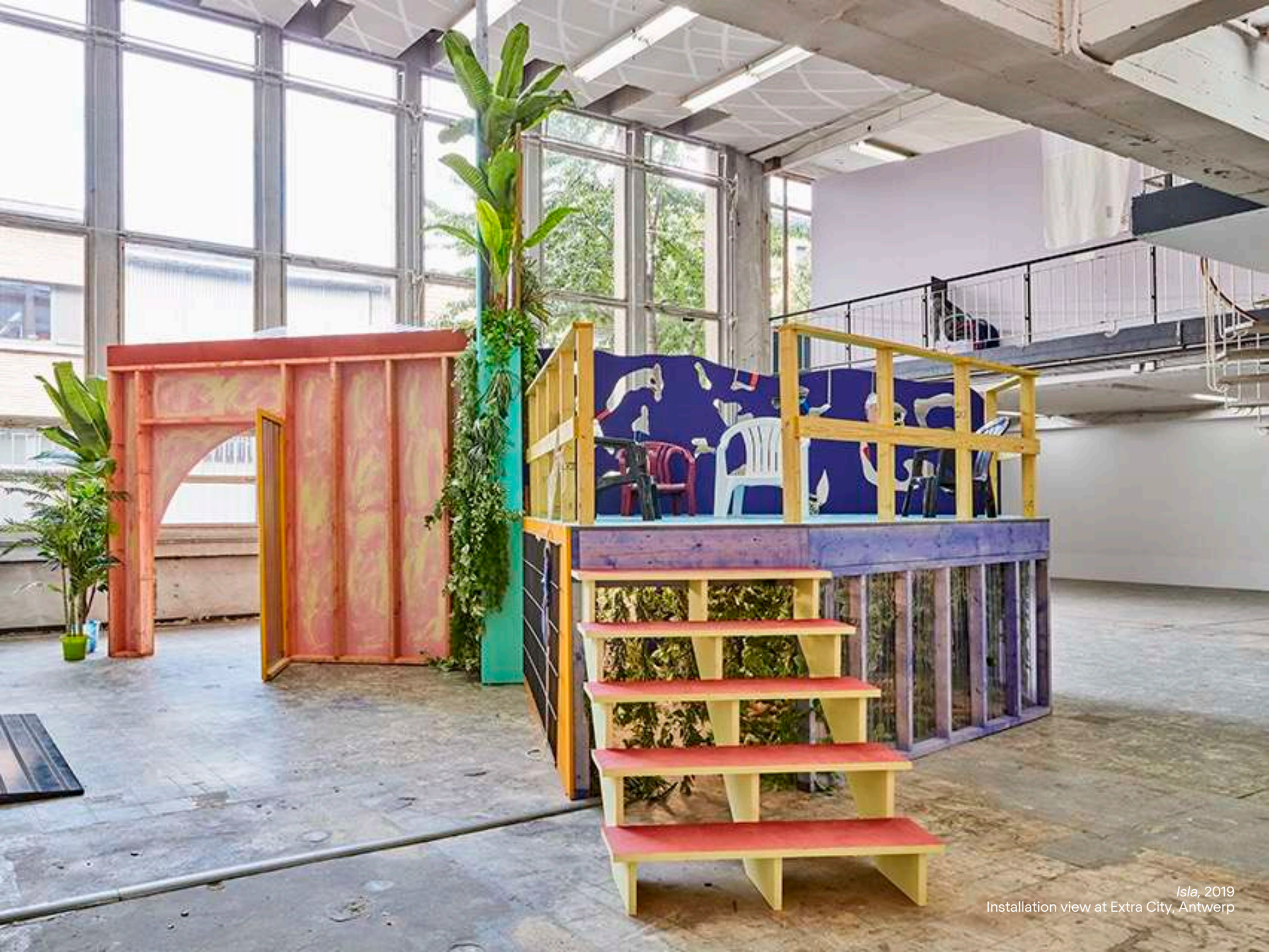
Isla , 2019 Installation view at Extra City, Antwerp