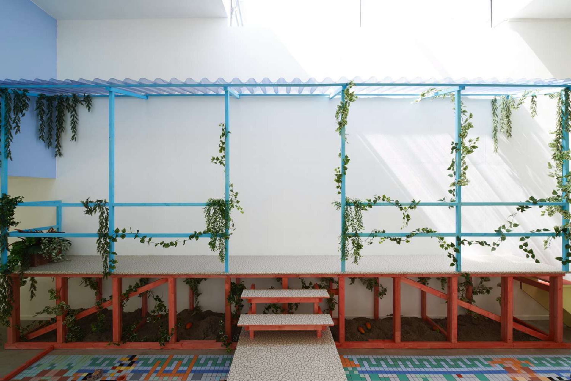
Los vestigios de La Touriste , 2022 Installation view at 1646, The Hague