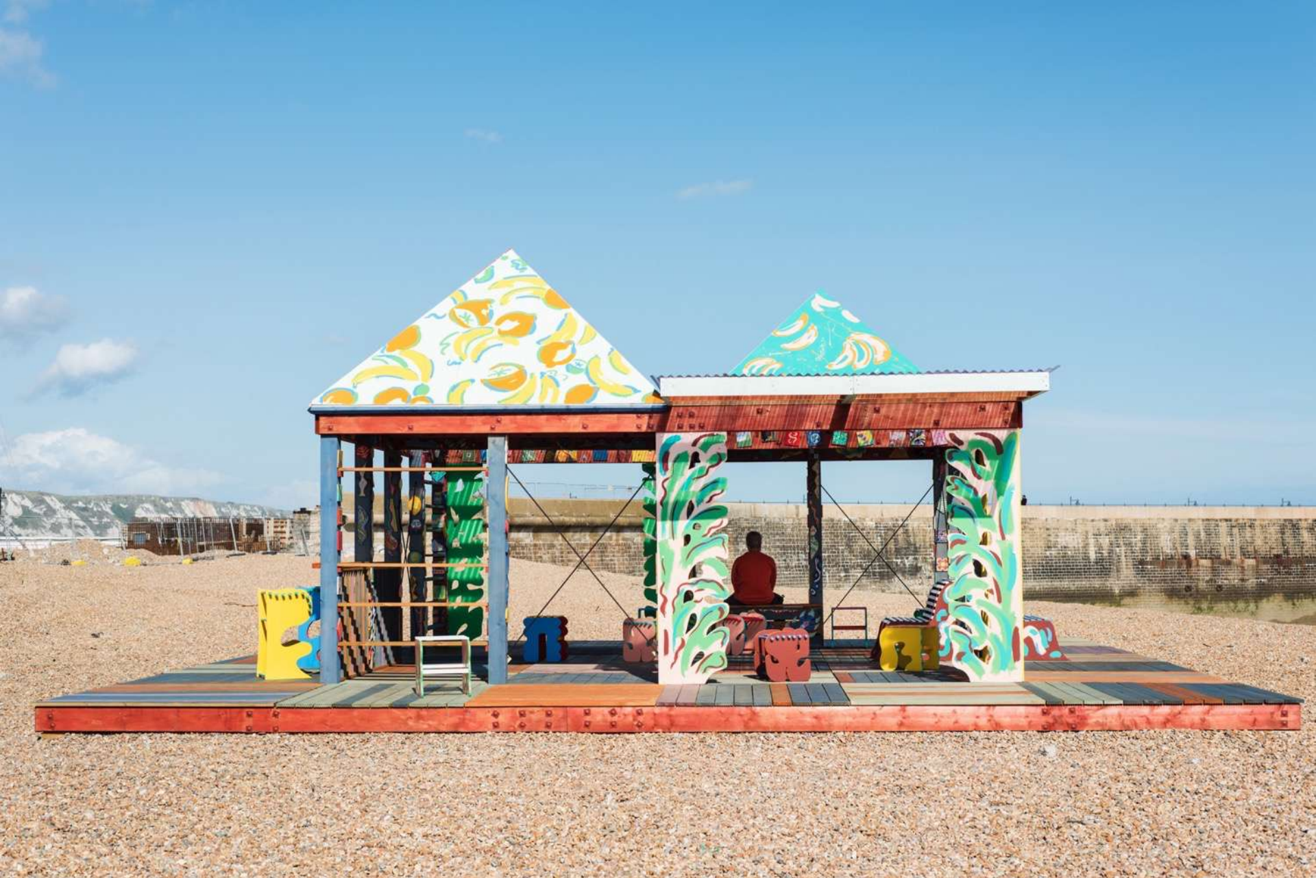
Casa Anacaona , 2017 Installation view at Folkestone

A co-commission by WOMAD World of Art and the Creative Foundation for Folkestone Triennial 2017