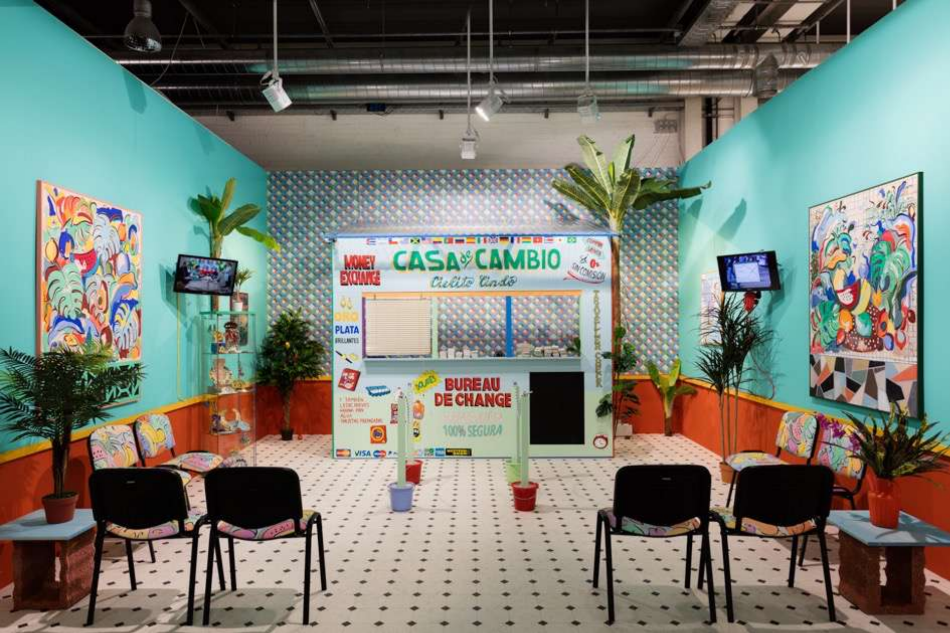
Casa de Cambio, 2016 Installation view at Art Basel Statements, Basel