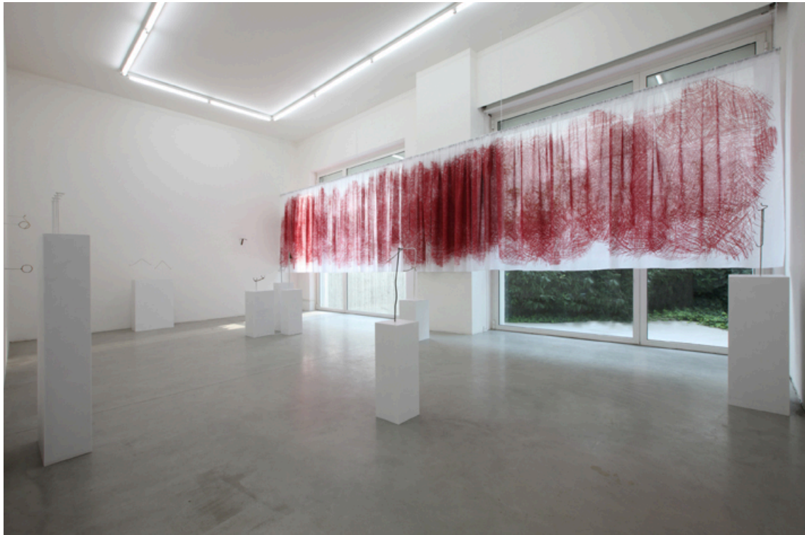
SIMON DYBBROE MØLLER Not Nature Near, 2008 Exhibition view at Francesca Minini, Milan