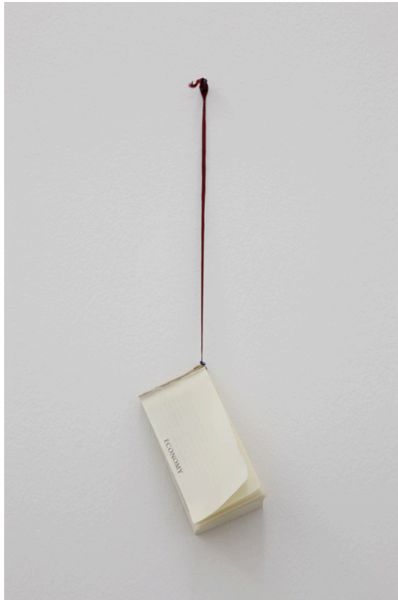
SIMON DYBBROE MØLLER Economy, 2008 Book 40 x 12 x 5,5 cm