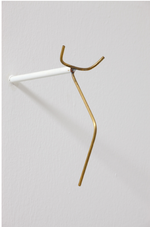
SIMON DYBBROE MØLLER 13 Problems # 7, 2008 Varnish, metal 8 x 8 x 20 cm