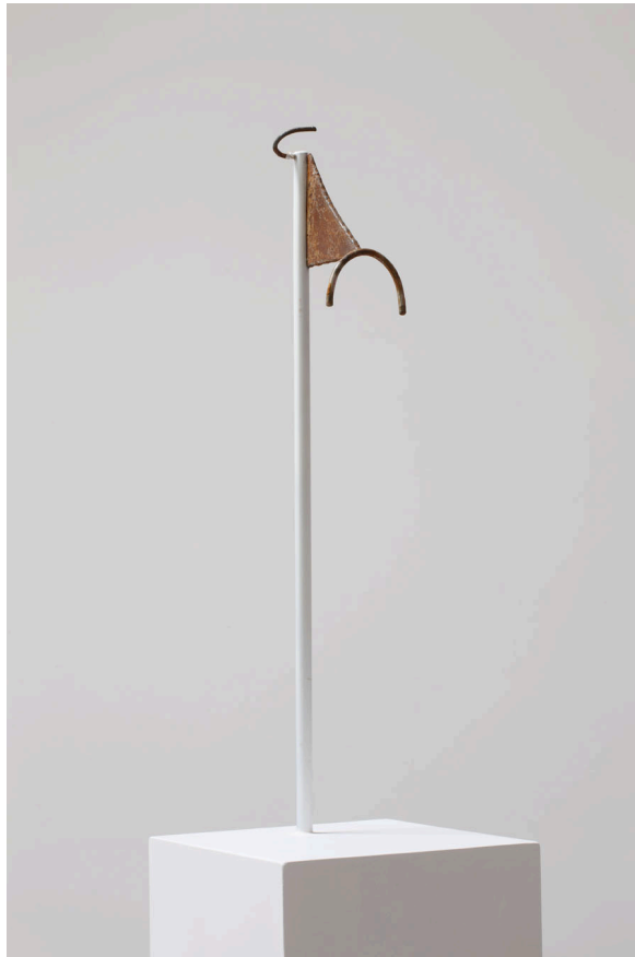
SIMON DYBBROE MØLLER 13 Problems # 10, 2008 Varnish, metal 5 x 13 x 52 cm