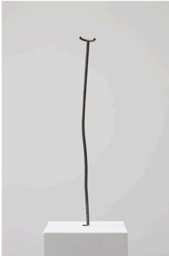
SIMON DYBBROE MØLLER 13 Problems # 2, 2008 Varnish, metal 4,5 x 3 x 50 cm