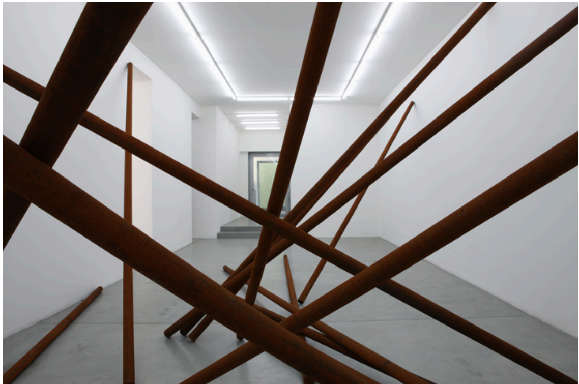
SIMON DYBBROE MØLLER Not Nature Near, 2008 Exhibition view at Francesca Minini, Milan