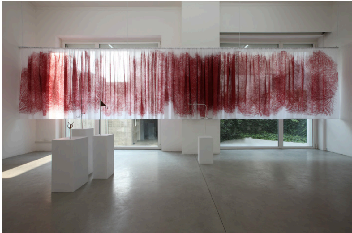
SIMON DYBBROE MØLLER Curtain for Louisiana (No More Moore), 2008 Silkscreen, polyester 180 x 1800 cm