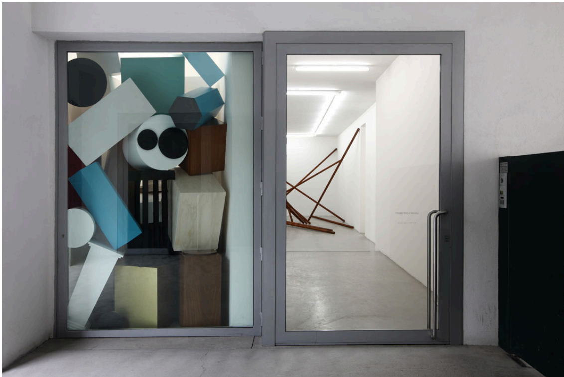
SIMON DYBBROE MØLLER Waiting for different times, 2008 Wood, acrylics Size variable