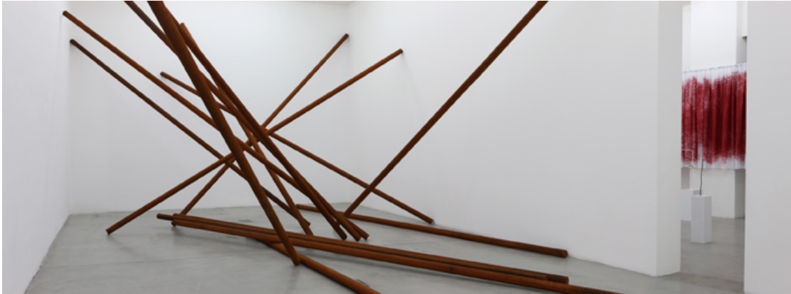
SIMON DYBBROE MØLLER Not Nature Near, 2008 Exhibition view at Francesca Minini, Milan