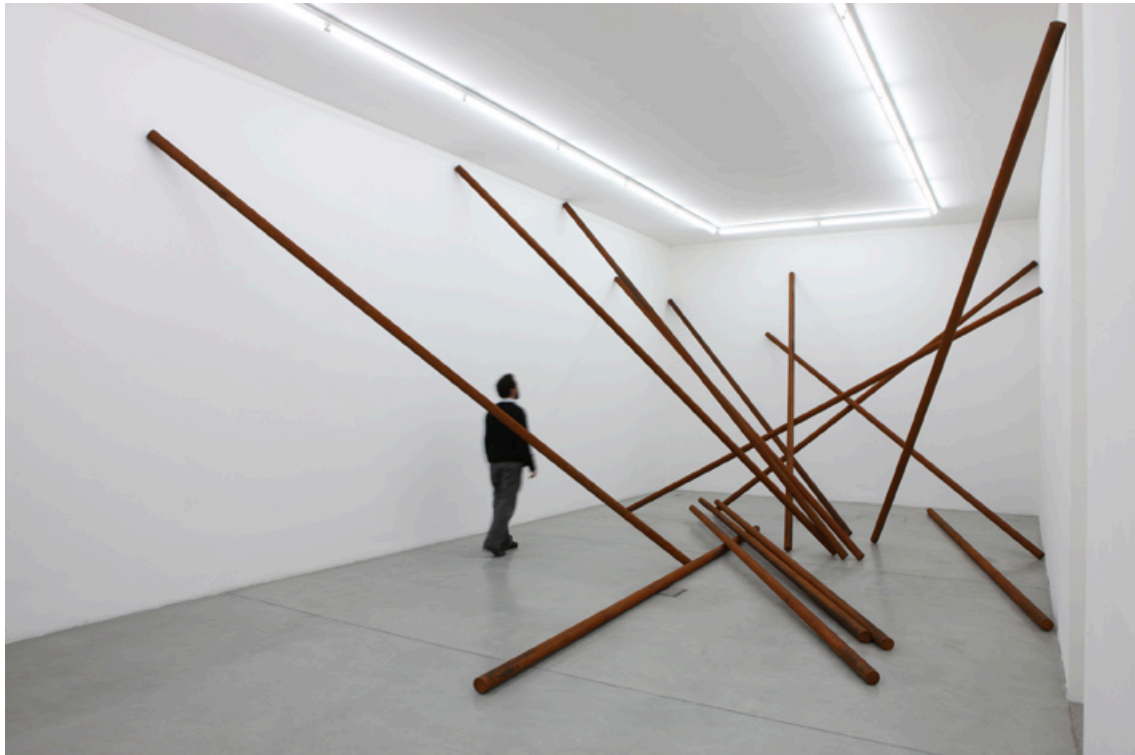
SIMON DYBBROE MØLLER Not Nature Near, 2008 Exhibition view at Francesca Minini, Milan