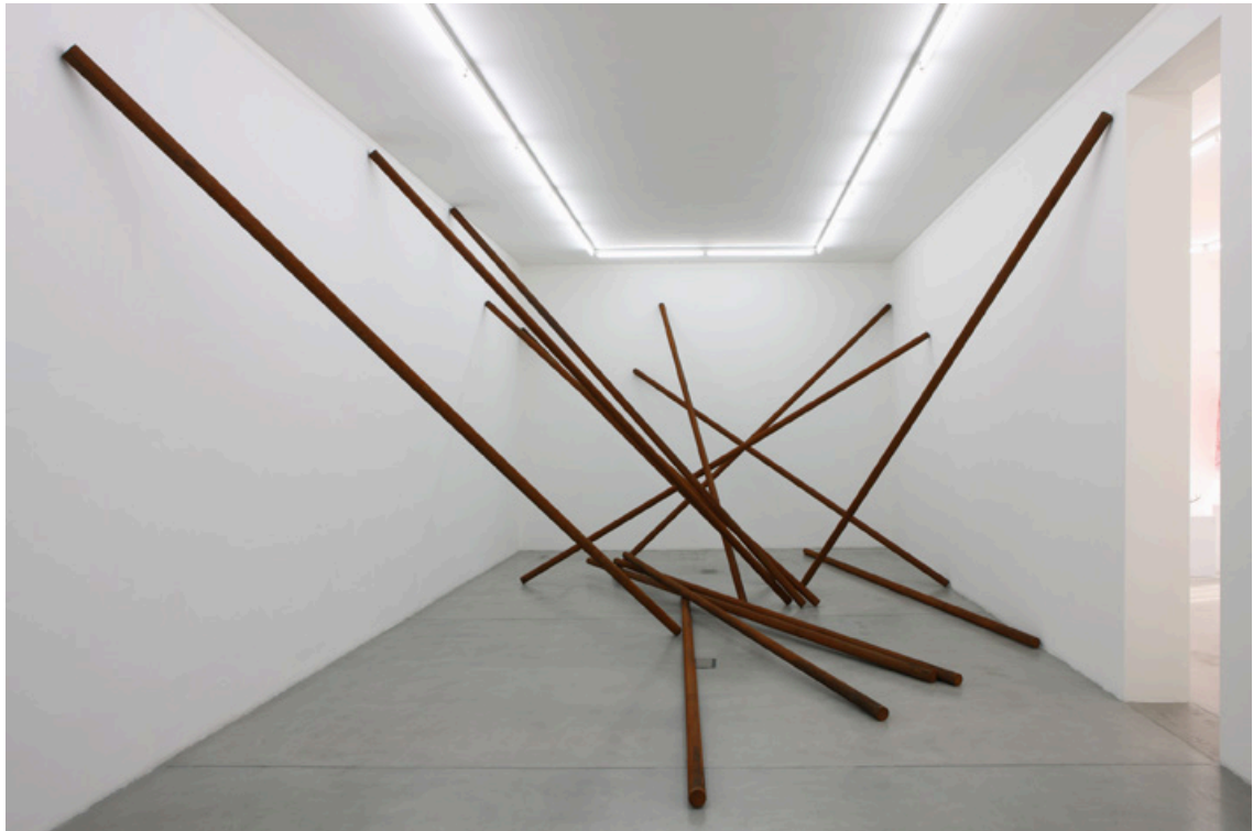
SIMON DYBBROE MØLLER Mass, Weight and Volume, 2008 Steel size variable