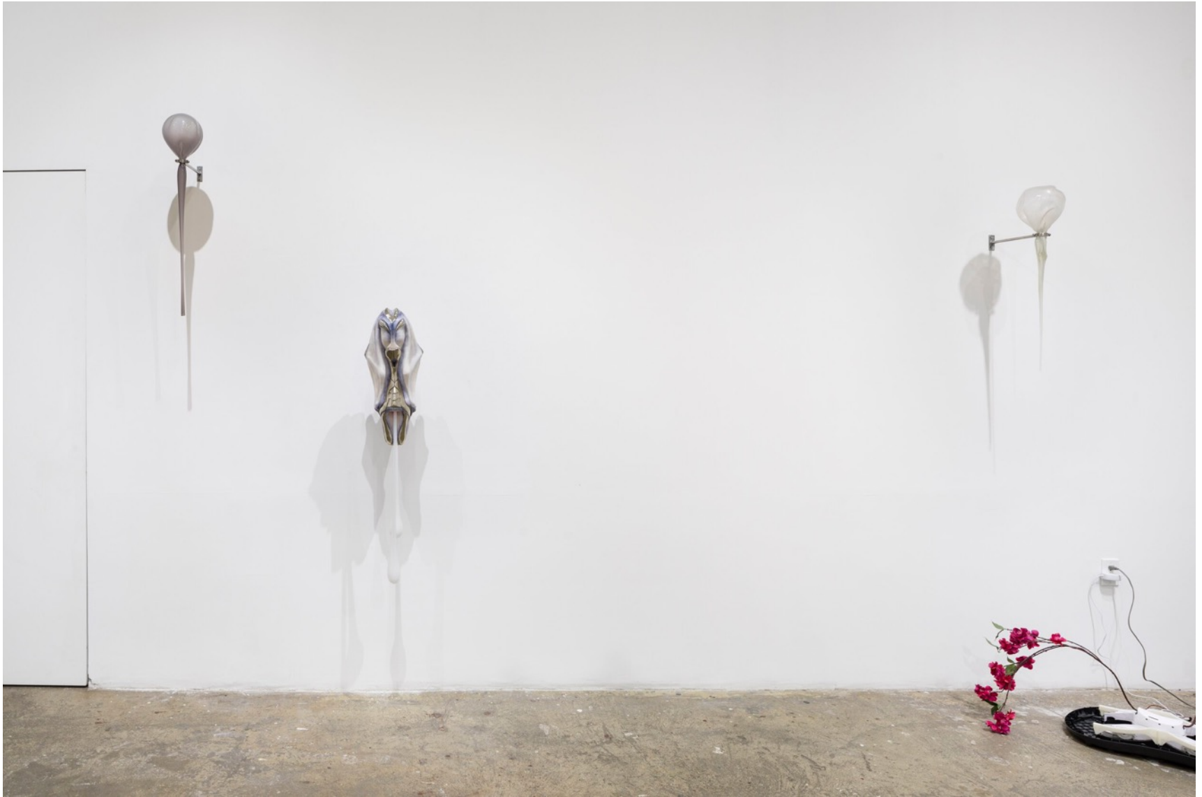
Her Kind , 2021 Installation view at Sargent's Daughters, New York