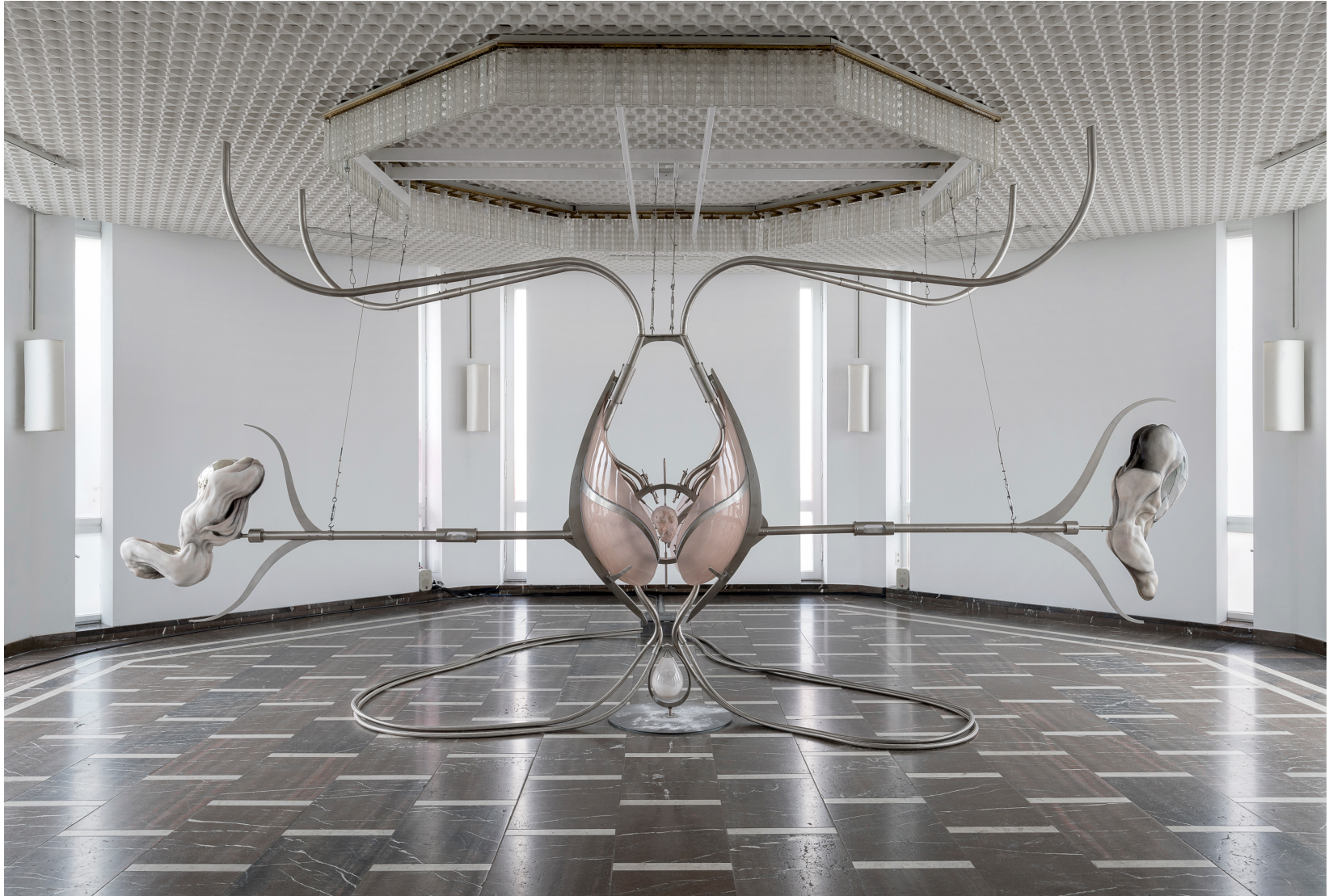
Metempsychosis: The Passion of Pneumatics, 2024 Installation view at Schinkel Pavillon, Berlin