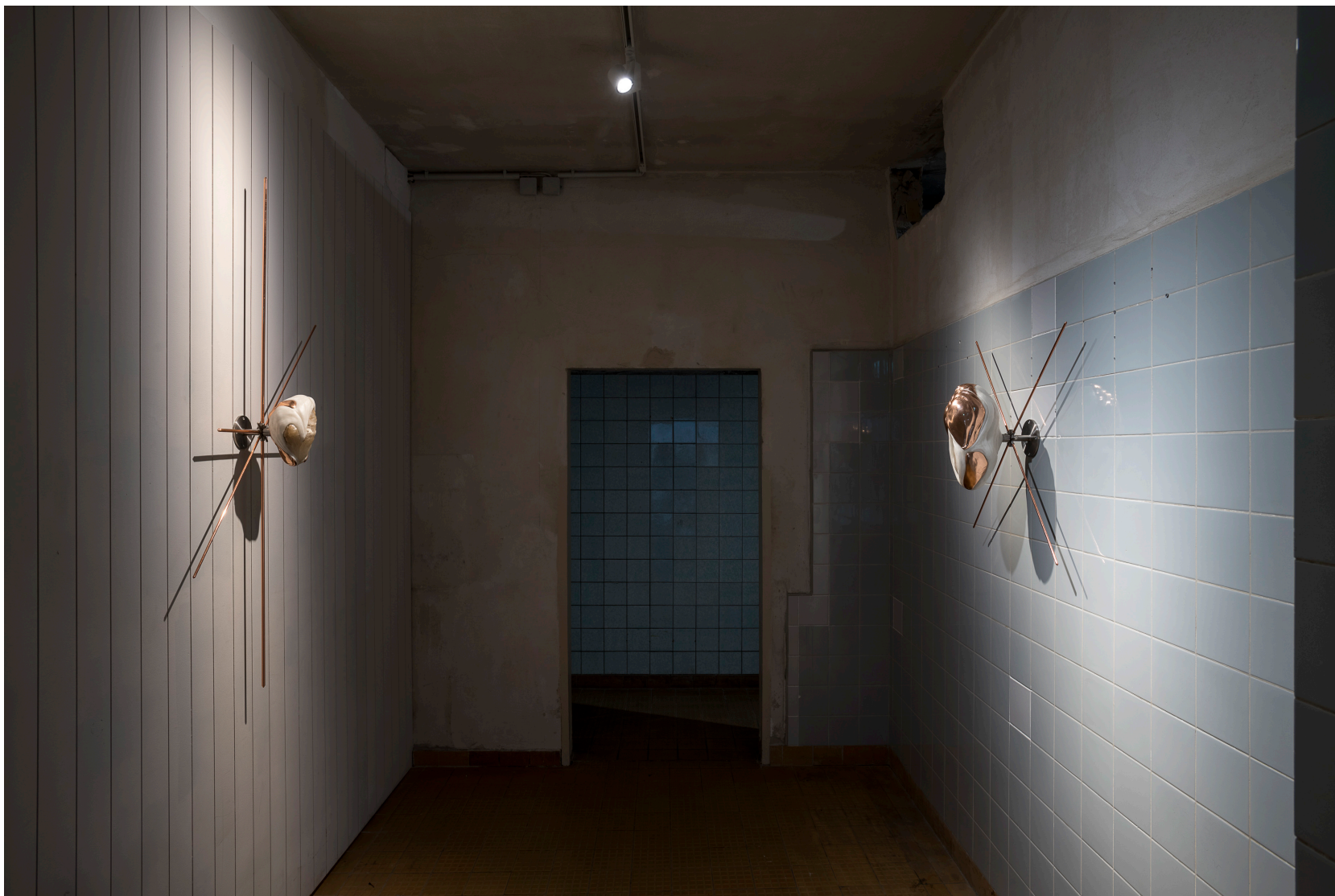
Metempsychosis: The Passion of Pneumatics, 2024 Installation view at Schinkel Pavillon, Berlin