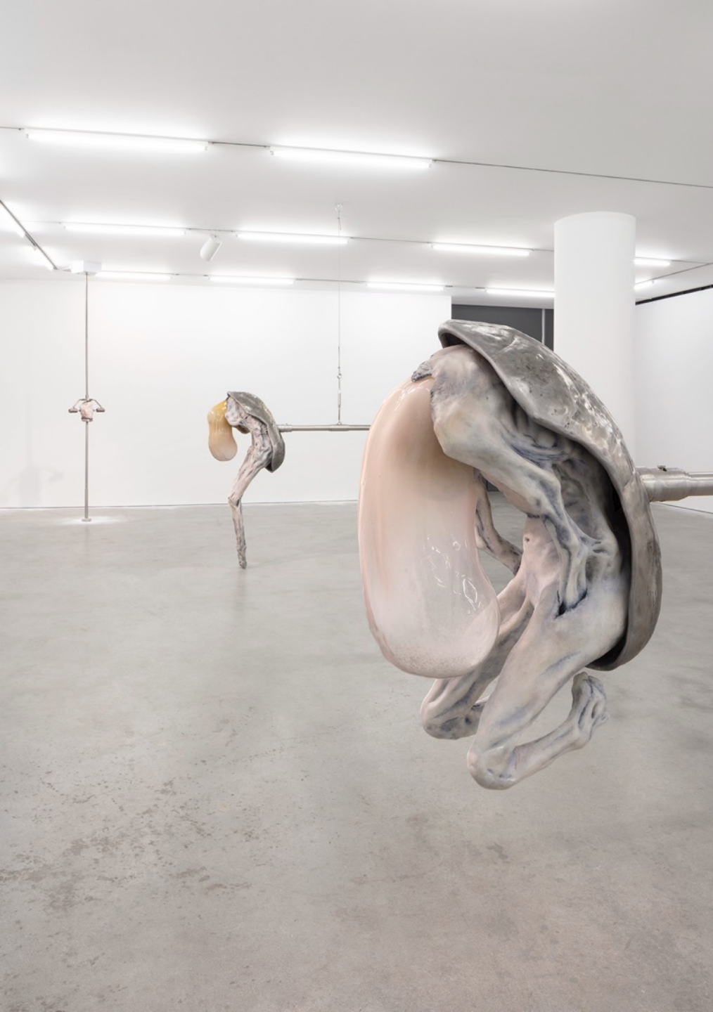
Through the hum of black velvet sleep, 2017 Installation view at Marlborough Contemporary, New York