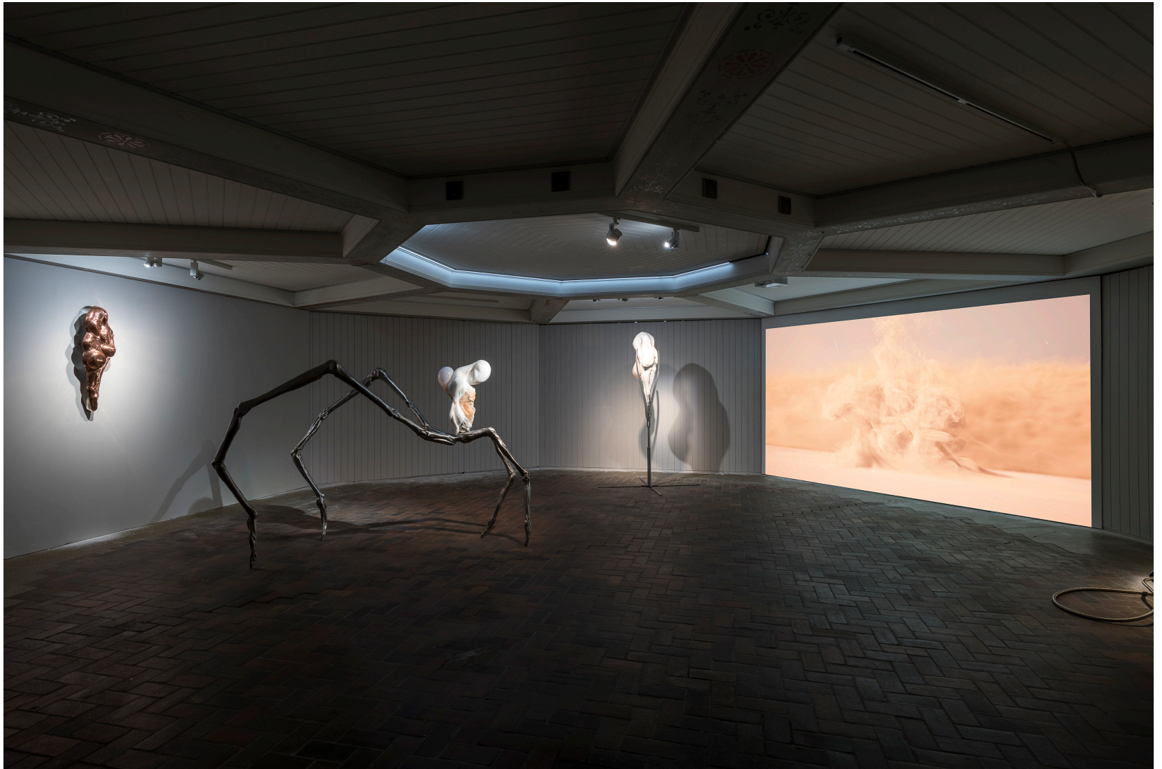
Metempsychosis: The Passion of Pneumatics, 2024 Installation view at Schinkel Pavillon, Berlin