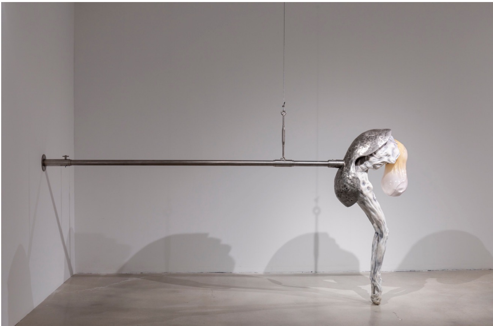
The Body Electric , 2020 Installation view at Museum of Art and Design, Miami Dade College, Miami