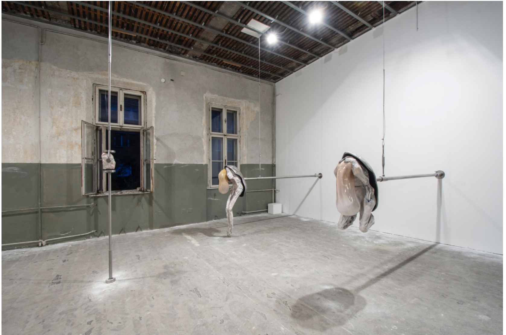
The Marvelous Cacophony , 2018 Installation view at Belgrade City Museum, Belgrade