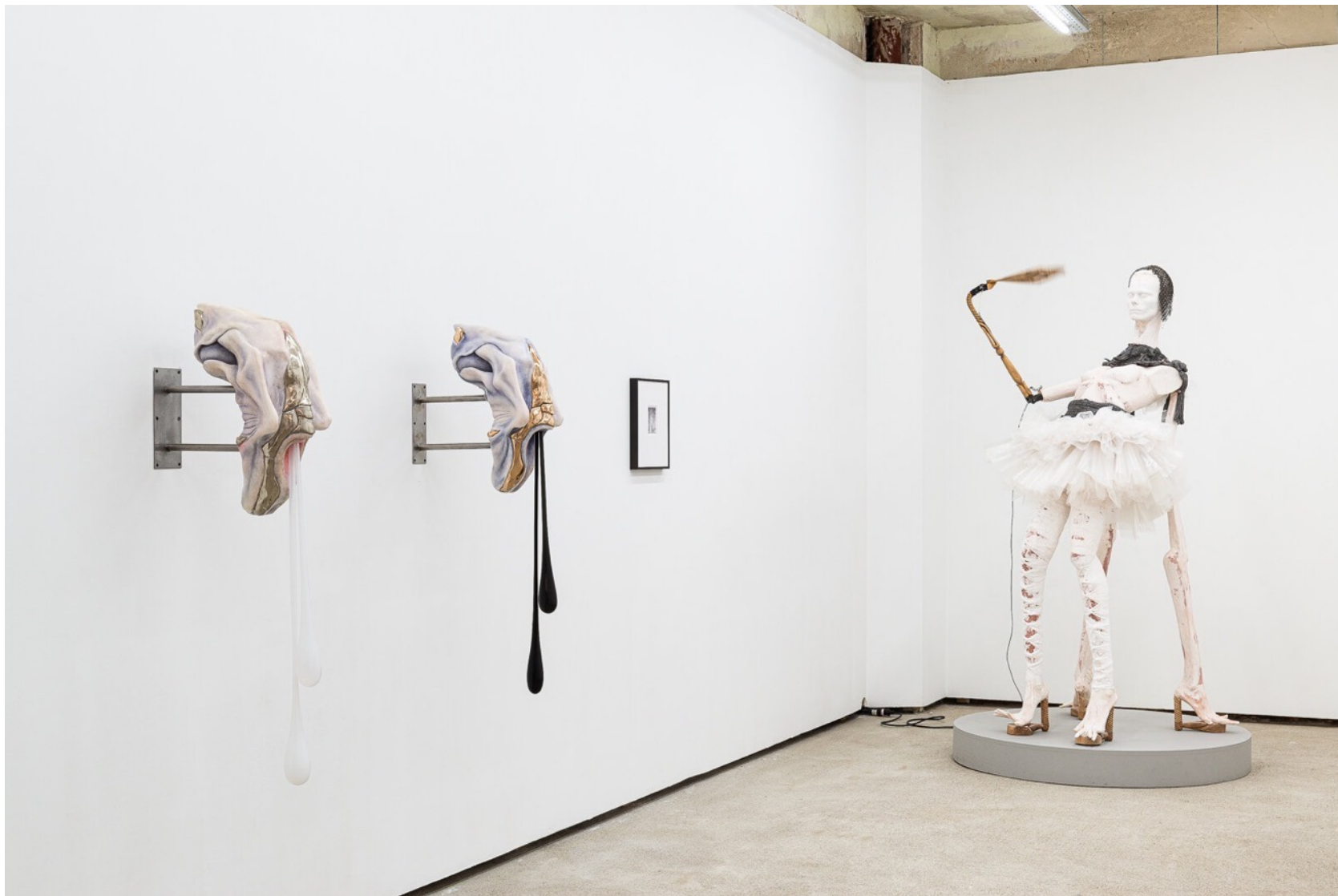
Ecce Puer, 2020 Installation view at Galerie Pact, Paris