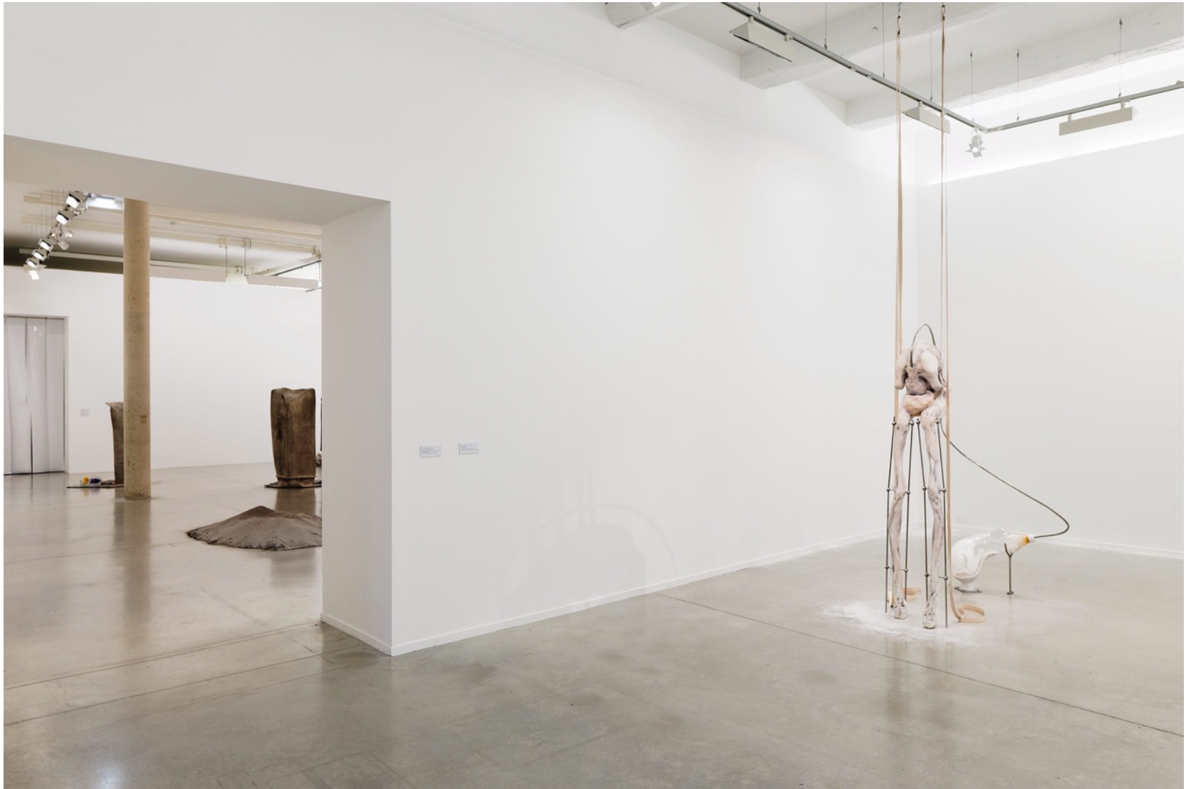
CRASH TEST | Molecular Revolution , 2018 Installation view at MOCO, Montpellier