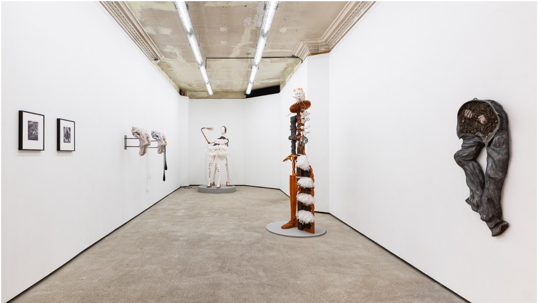
Ecce Puer, 2020 Installation view at Galerie Pact, Paris