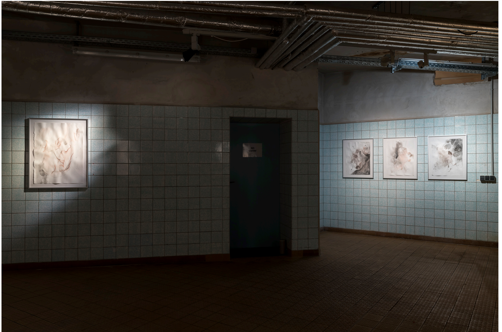
Metempsychosis: The Passion of Pneumatics, 2024 Installation view at Schinkel Pavillon, Berlin