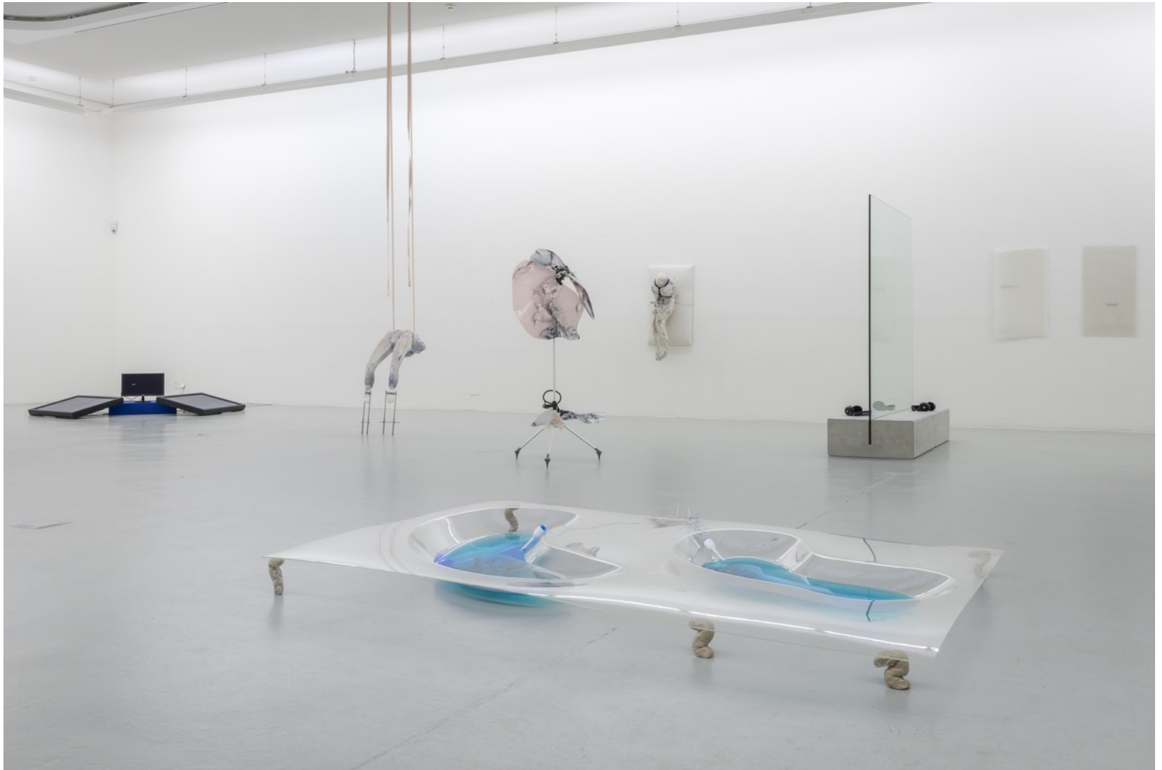
Immortalism, 2017 Installation view at Kunstverein Freiburg, Breisgau