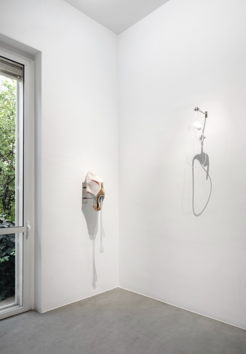
Second best scenario, 2022 Installation view at Francesca Minini, Millan