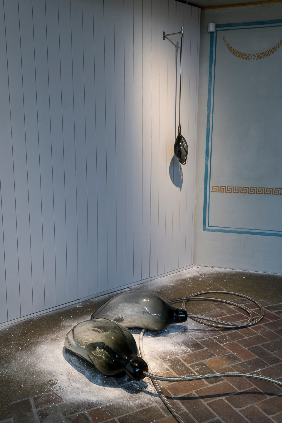
Metempsychosis: The Passion of Pneumatics, 2024 Installation view at Schinkel Pavillon, Berlin