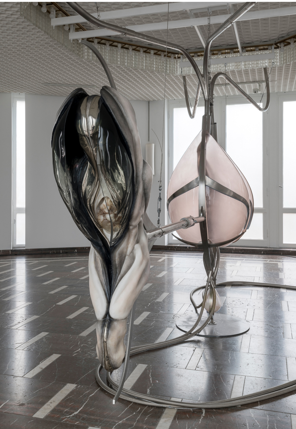
Metempsychosis: The Passion of Pneumatics, 2024 Installation view at Schinkel Pavillon, Berlin