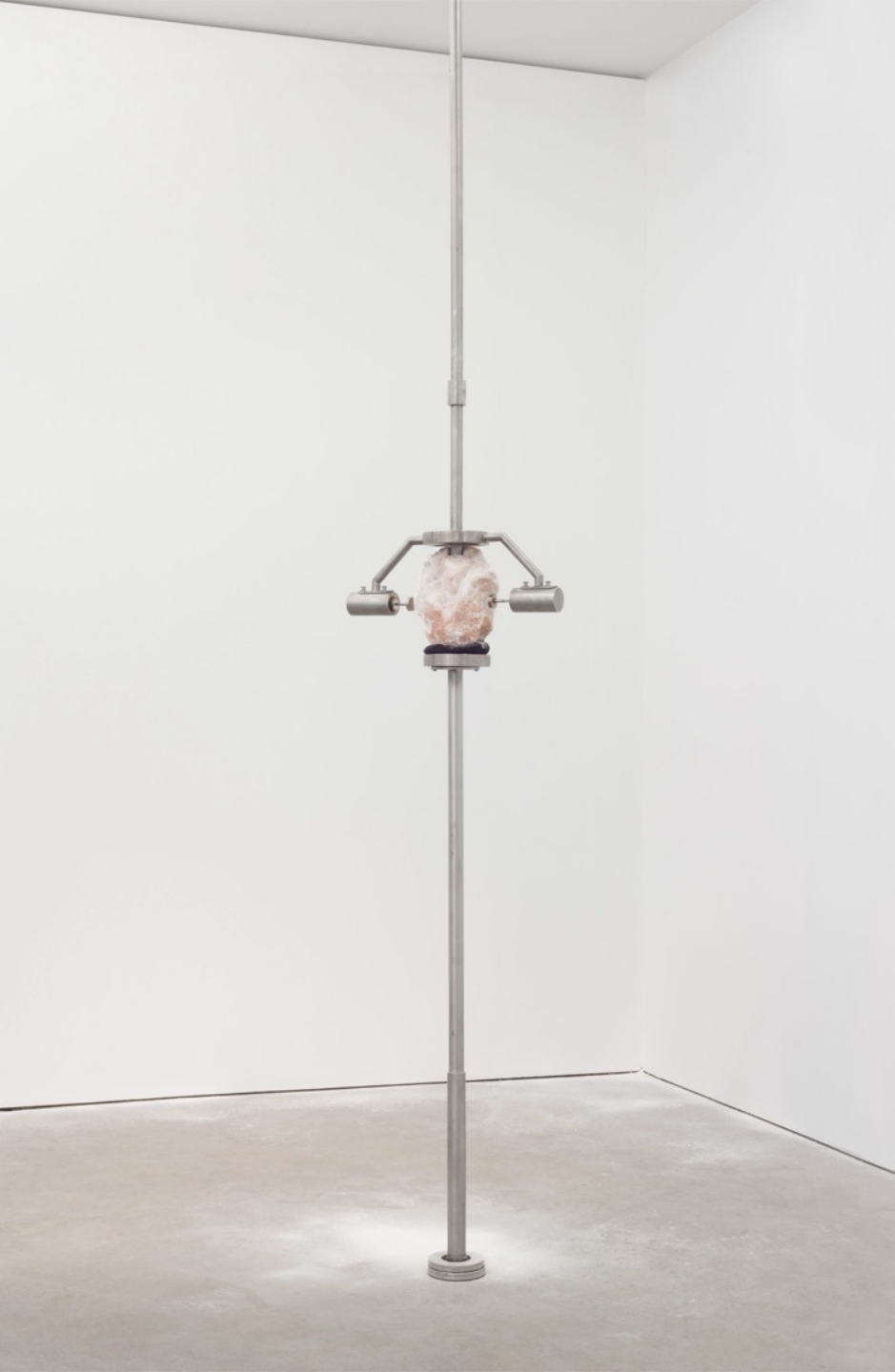
Through the hum of black velvet sleep, 2017 Installation view at Marlborough Contemporary, New York