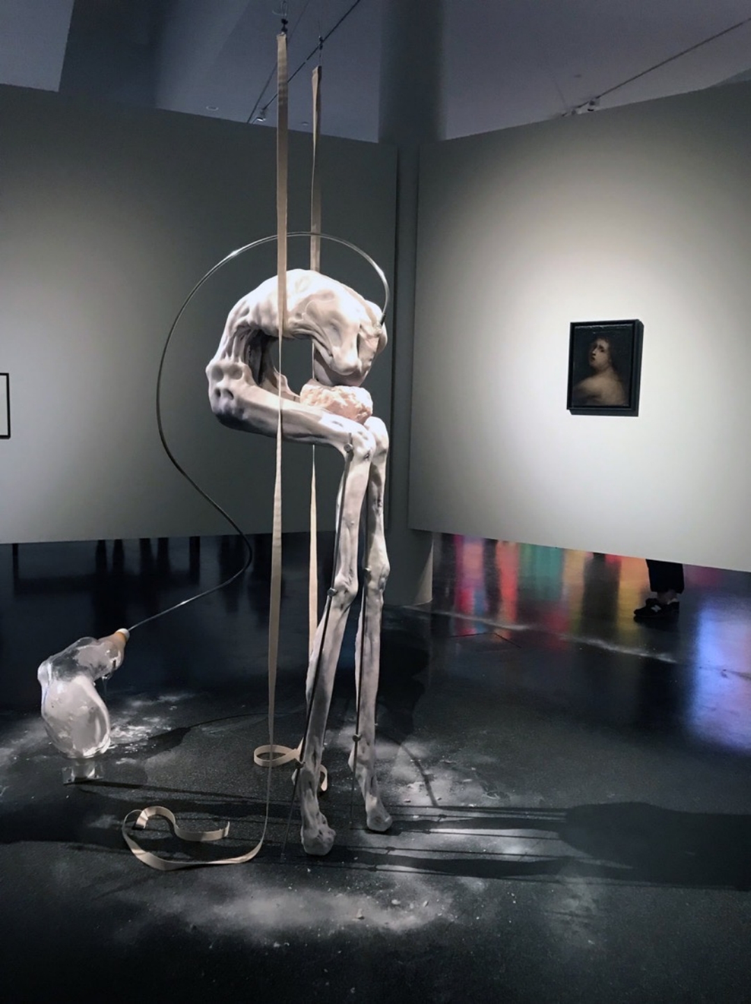
Open Collections: The Artist Takes the Floor, 2020 Installation view at KUMU Art Museum , Tallinn