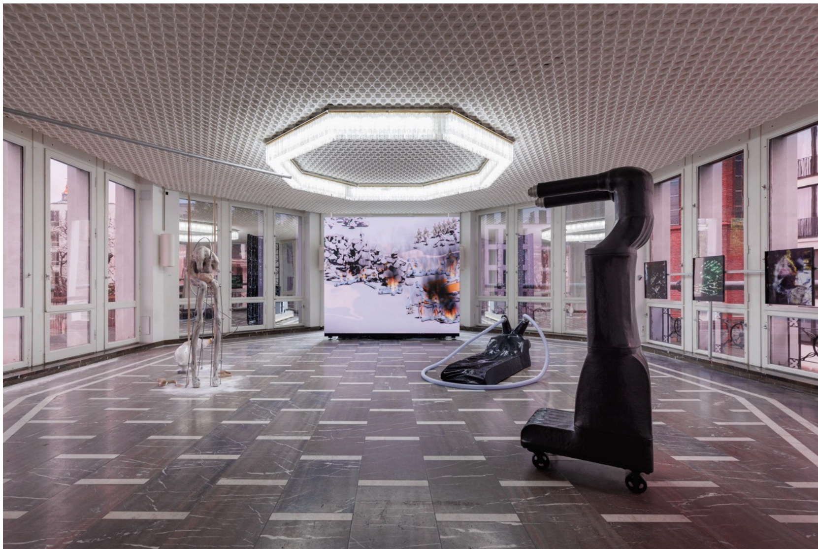
Human Is , 2023 Installation view at Schinkel Pavillon, Berlin