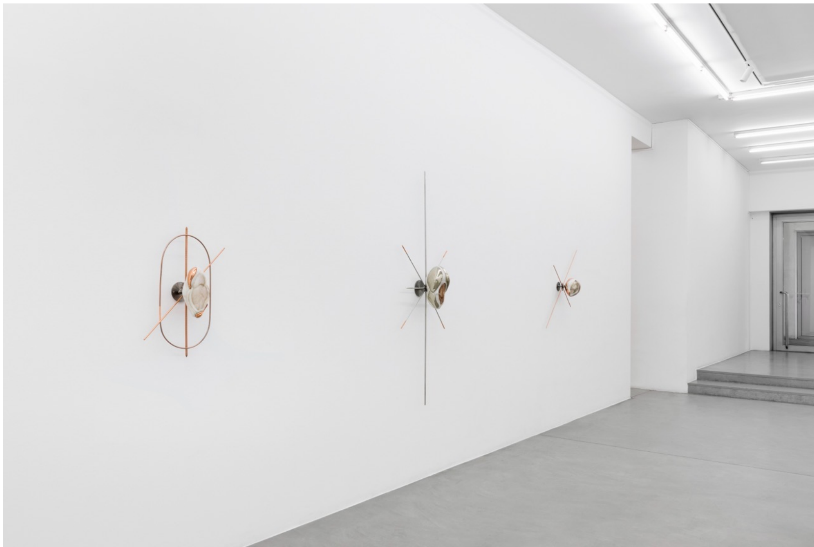
Second best scenario, 2022 Installation view at Francesca Minini, Milan