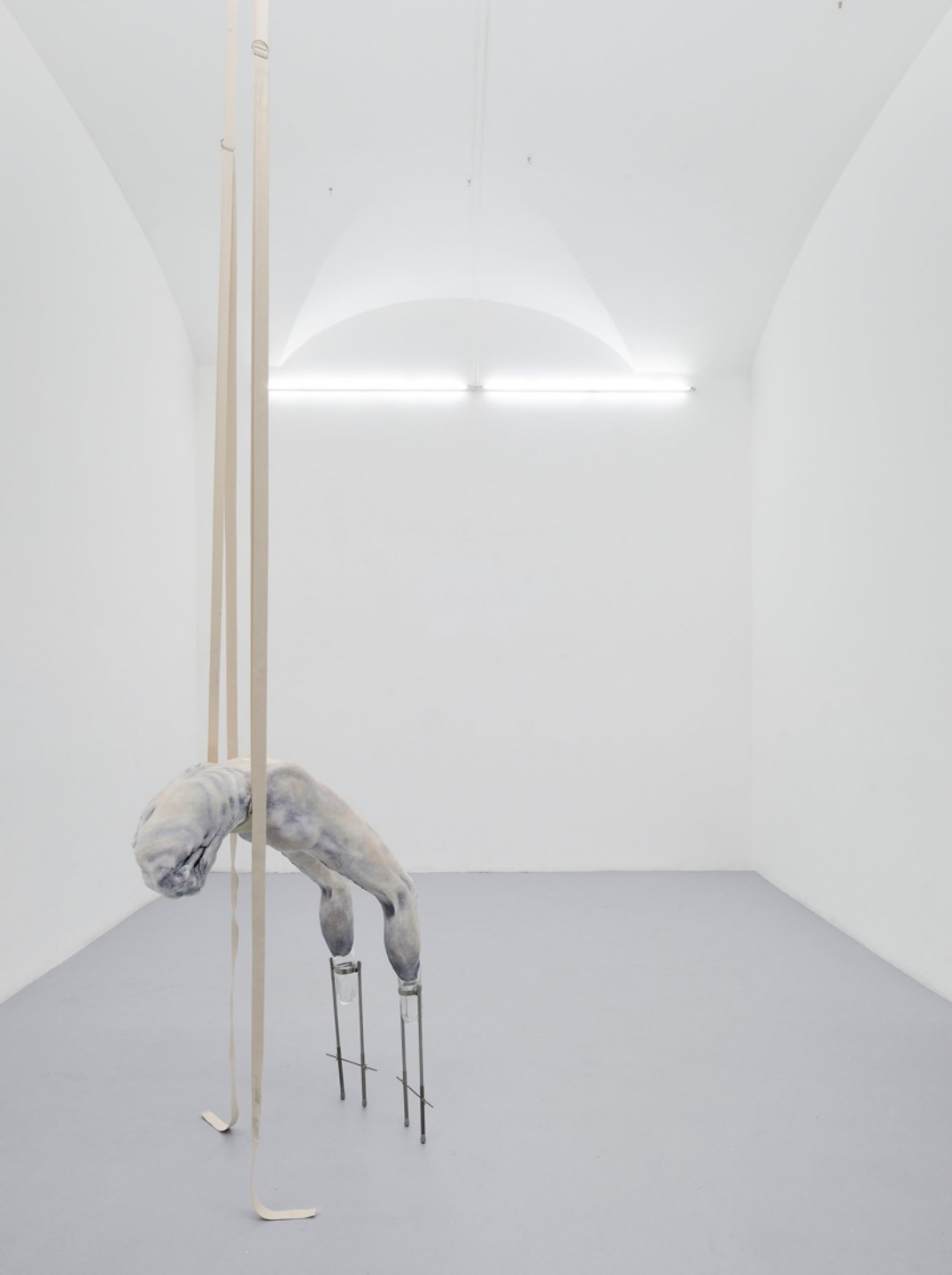
INCORPOREA 03, 2021 Installation view at Basement, Rome