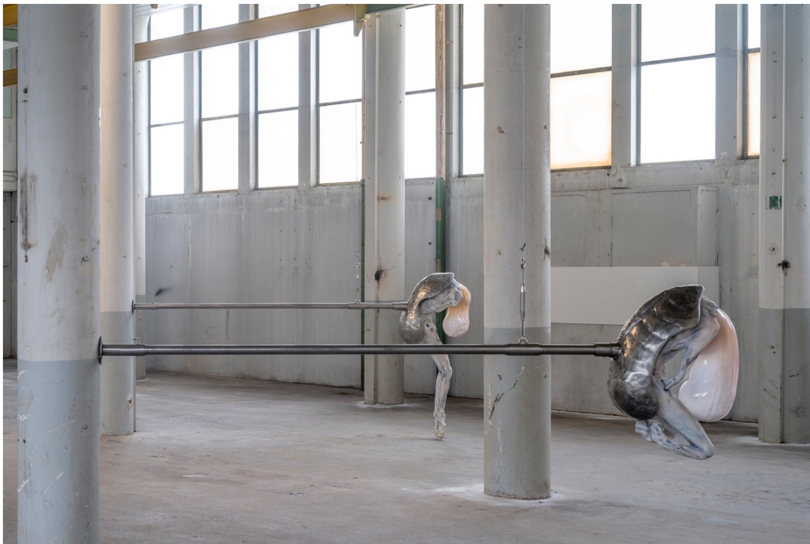
Chapter 3HREE 'What is important now is to recover our senses', 2020 Installation view at Het Hem Amsterdam