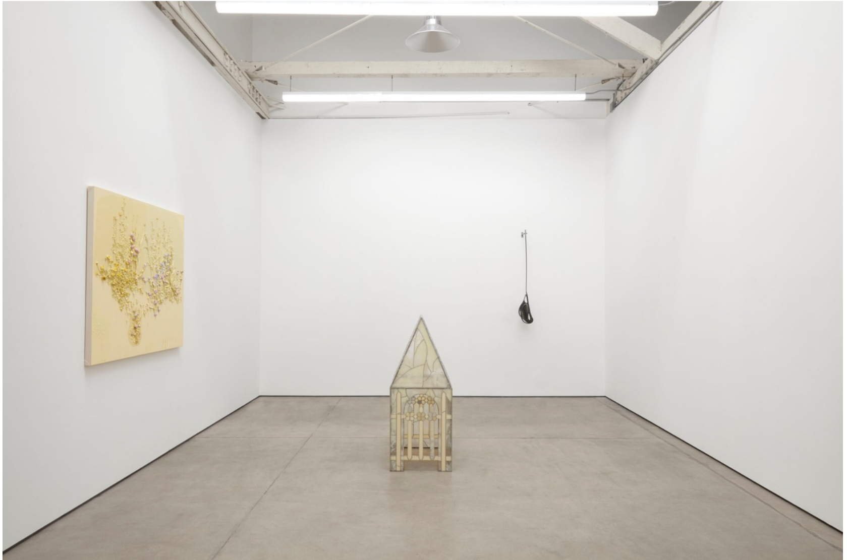
Material Conditions, 2020 Installation view at Matthew Brown, Los Angeles