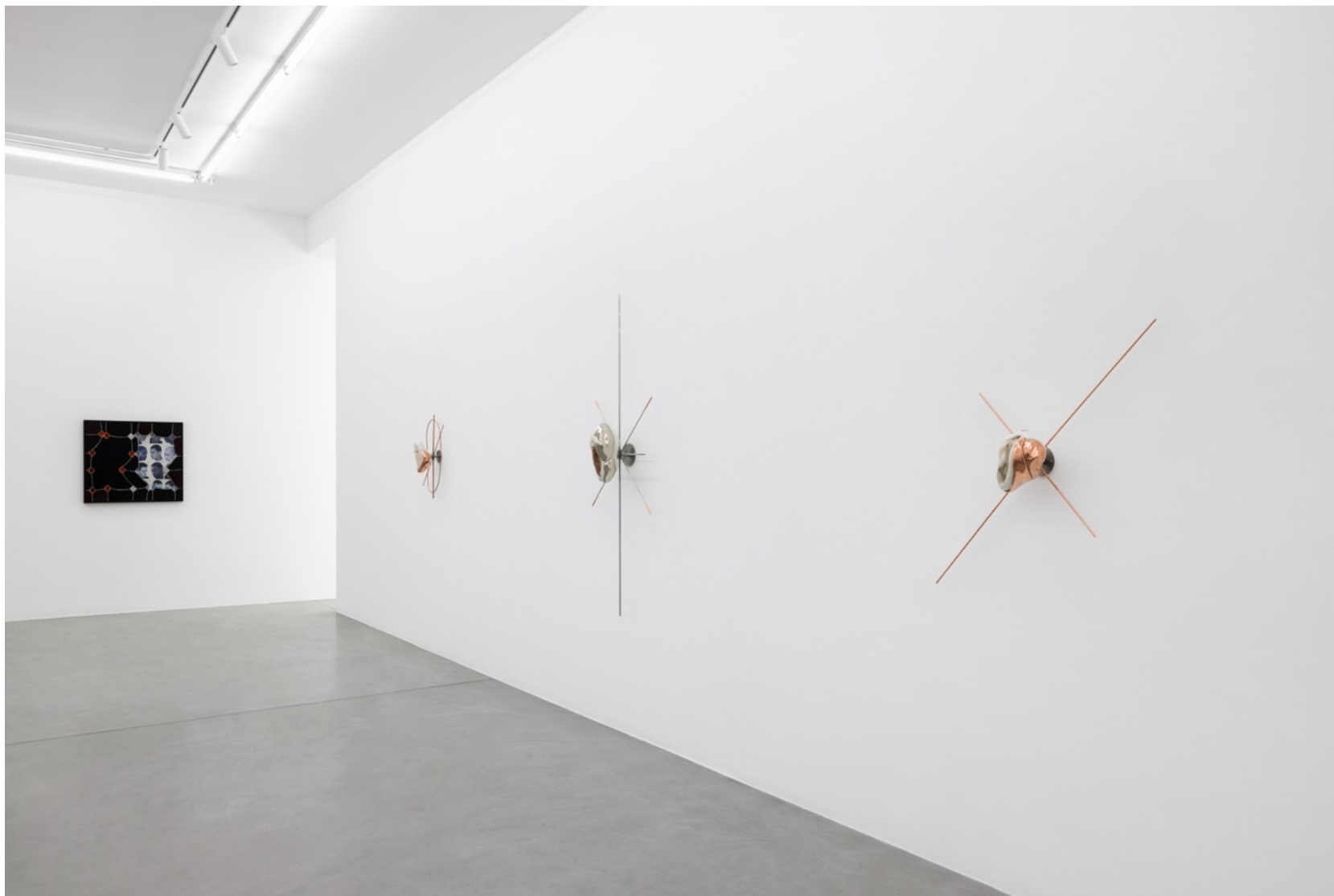
Second best scenario, 2022 Installation view at Francesca Minini, Milan