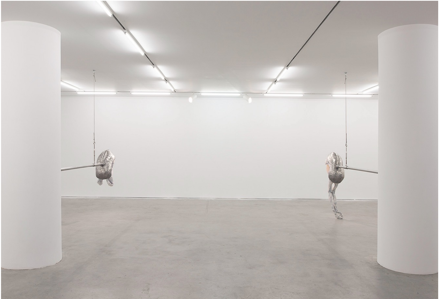
Through the hum of black velvet sleep, 2017 Installation view at Marlborough Contemporary, New York