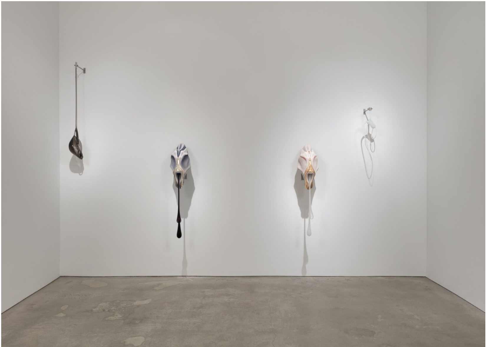
WILD AT HEART, 2021 Installation view at Marlborough, New York