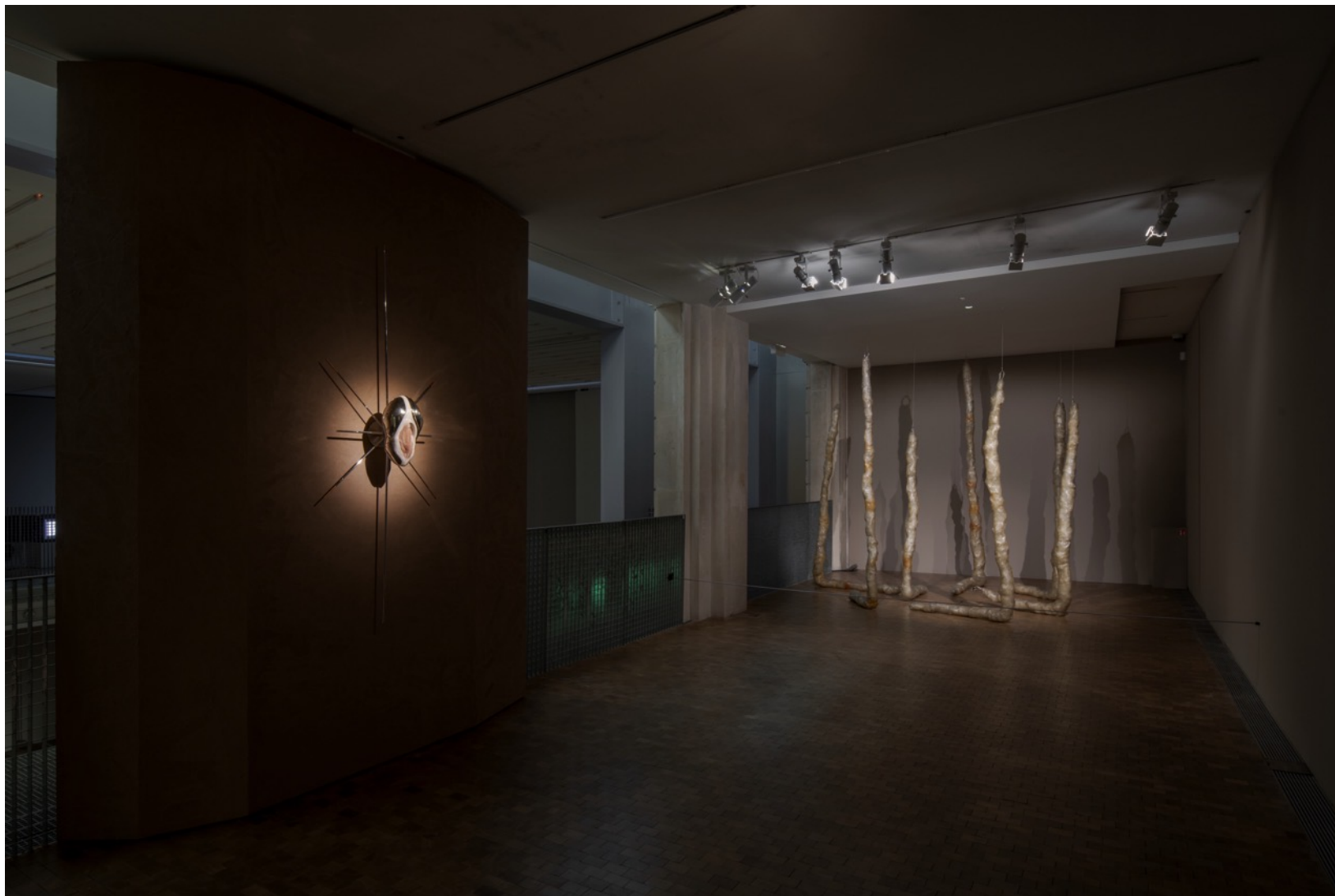
AU-DELÀ , 2023 Installation view at Lafayette Anticipations, Paris