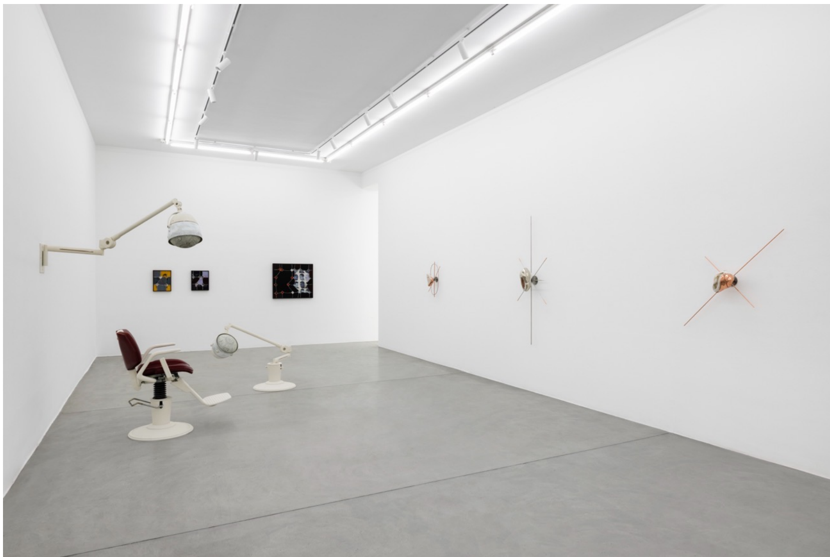
Second best scenario, 2022 Installation view at Francesca Minini, Milan