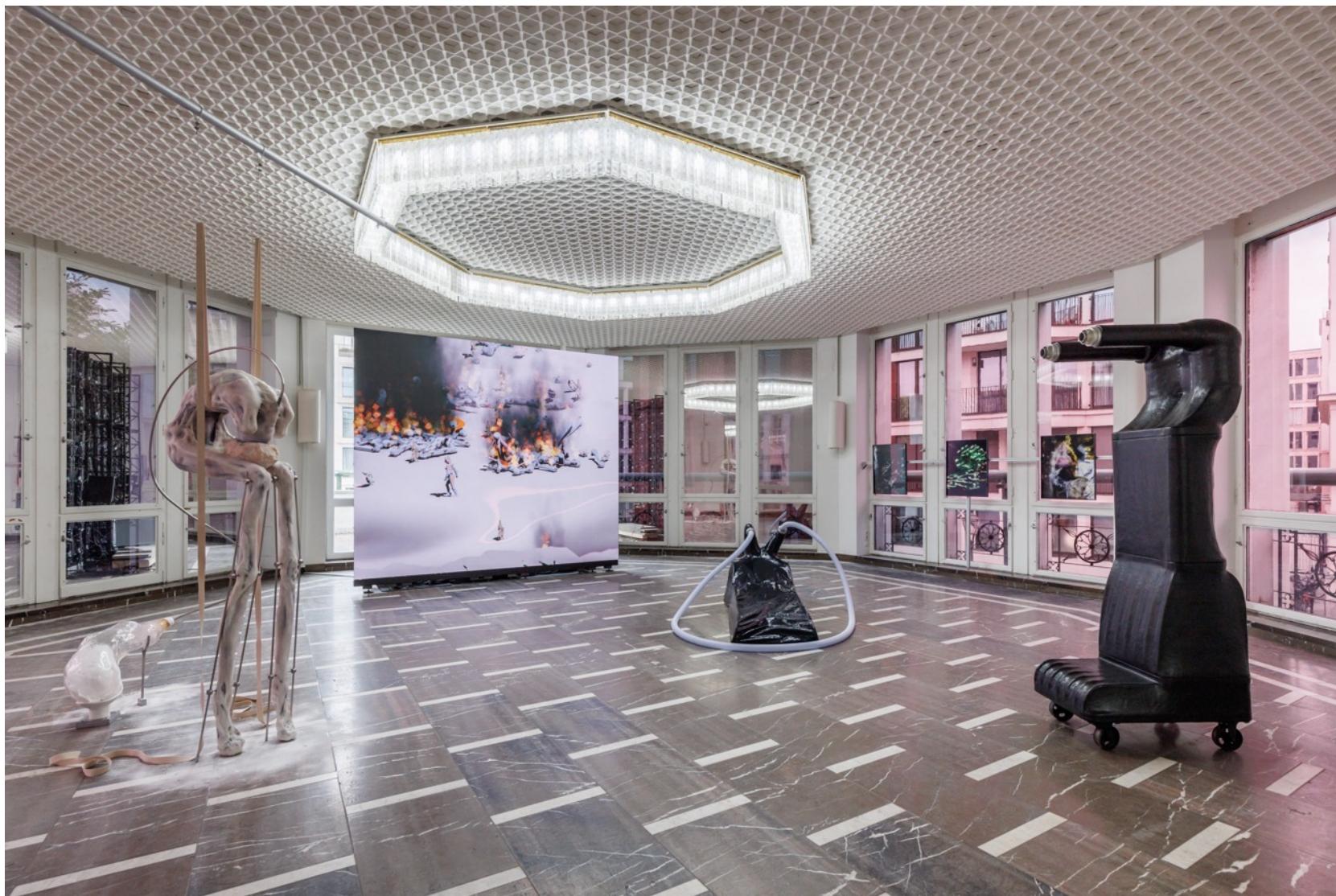
Human Is , 2023 Installation view at Schinkel Pavillon, Berlin