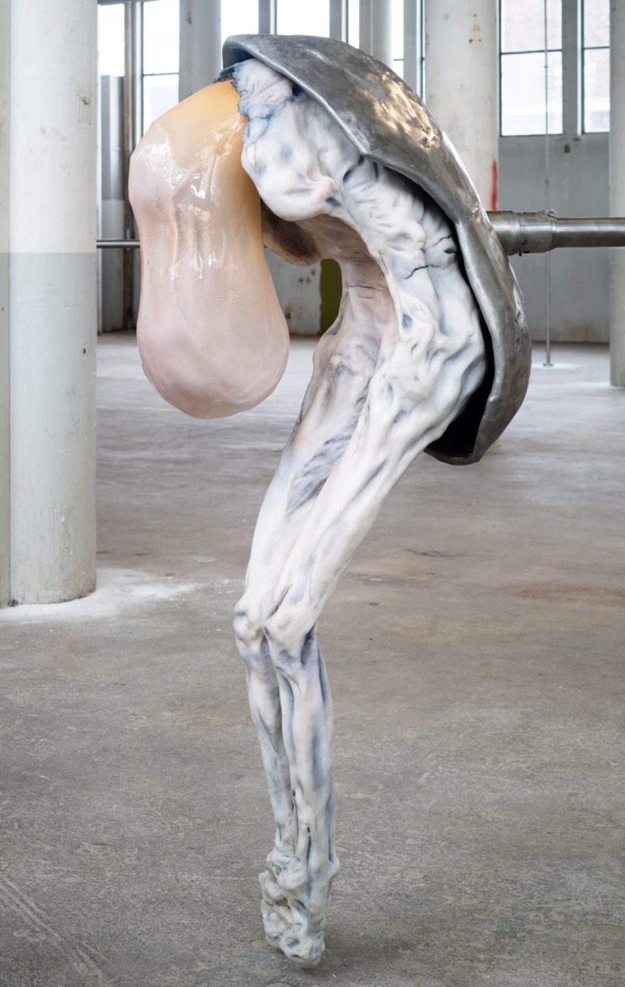
Chapter 3HREE 'What is important now is to recover our senses', 2020 Installation view at Het Hem Amsterdam