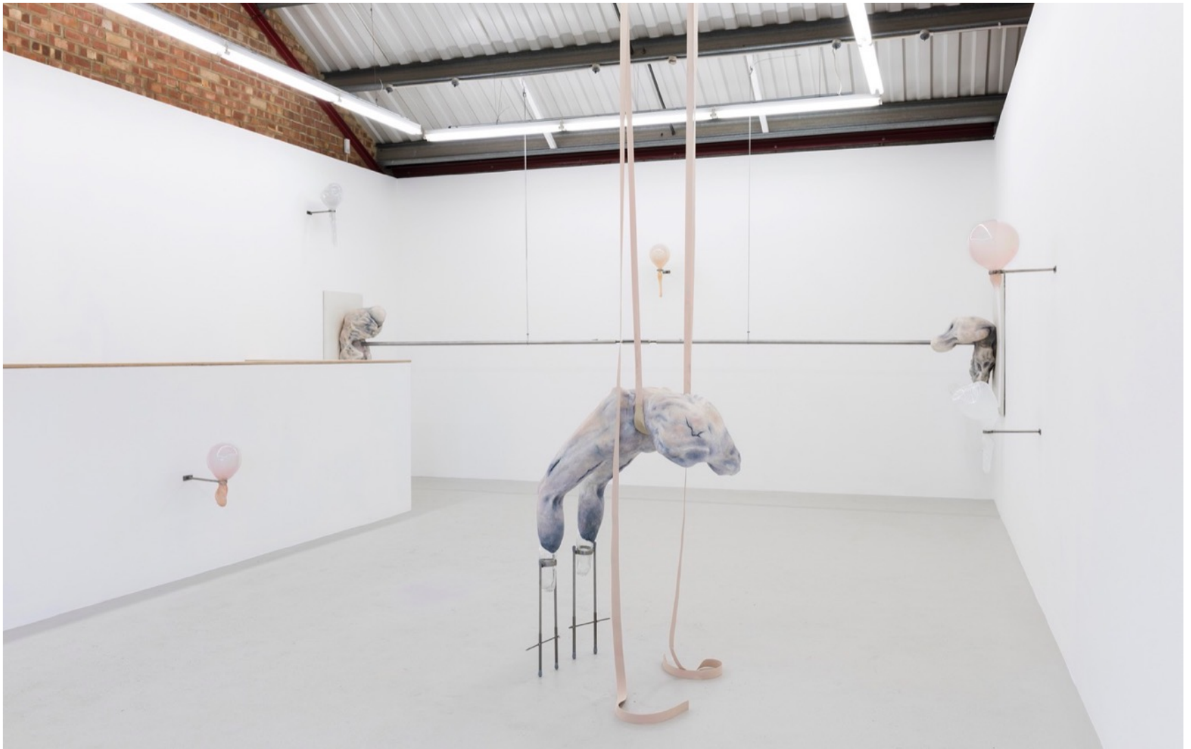
Throat wanders down the blade... , 2016 Installation view at Annka Kultys Gallery, London