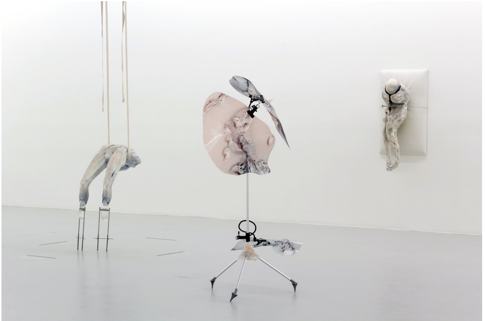
Immortalism , 2017 Installation view at Kunstverein Freiburg, Breisgau