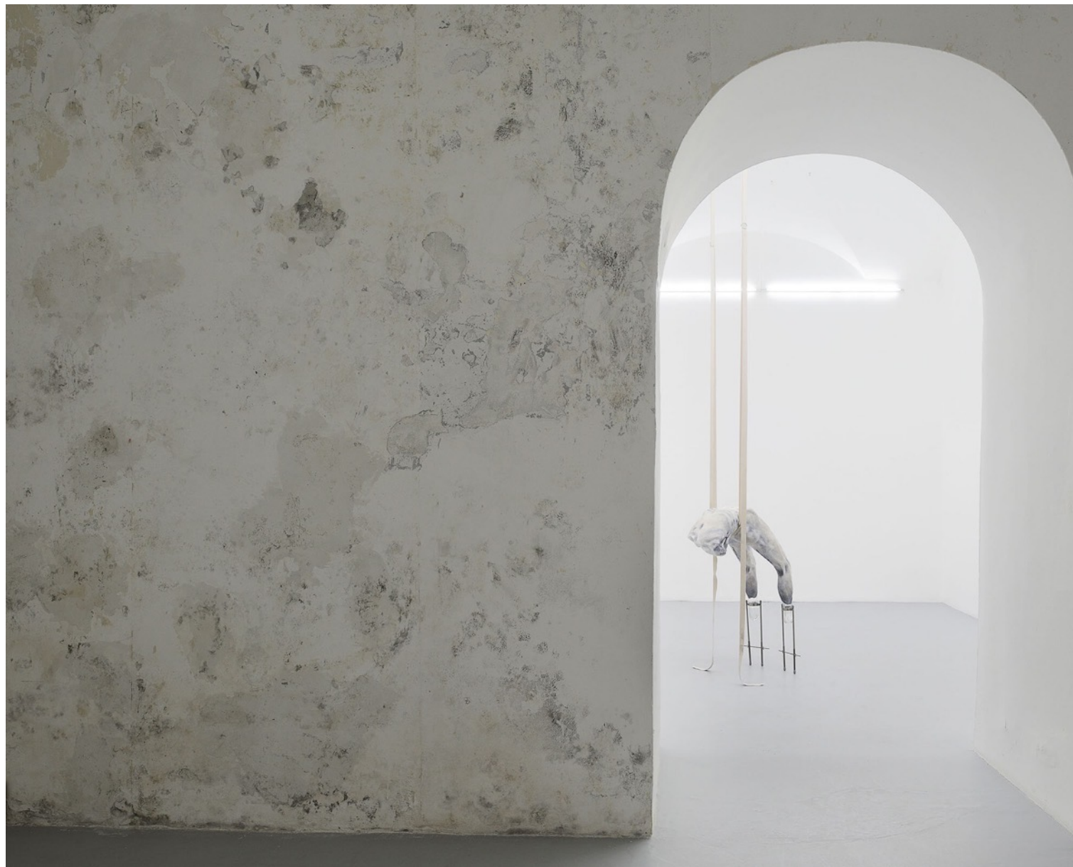
INCORPORA 03, 2021 Installation view at Basement, Rome