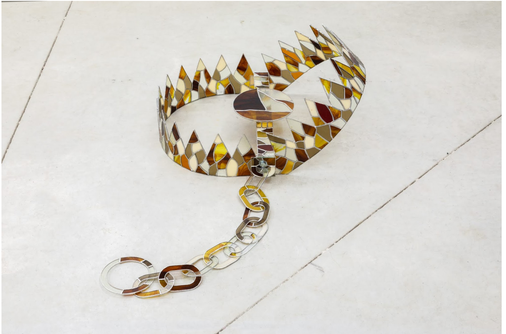
Head Gusset , 2019 Installation view at COOPER COLE, Toronto