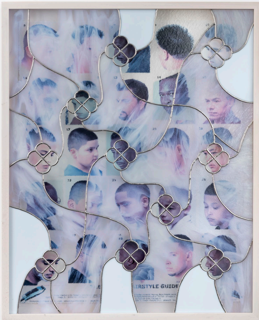
My Volition , 2022 Installation view at Matthew Brown Gallery, Los Angeles