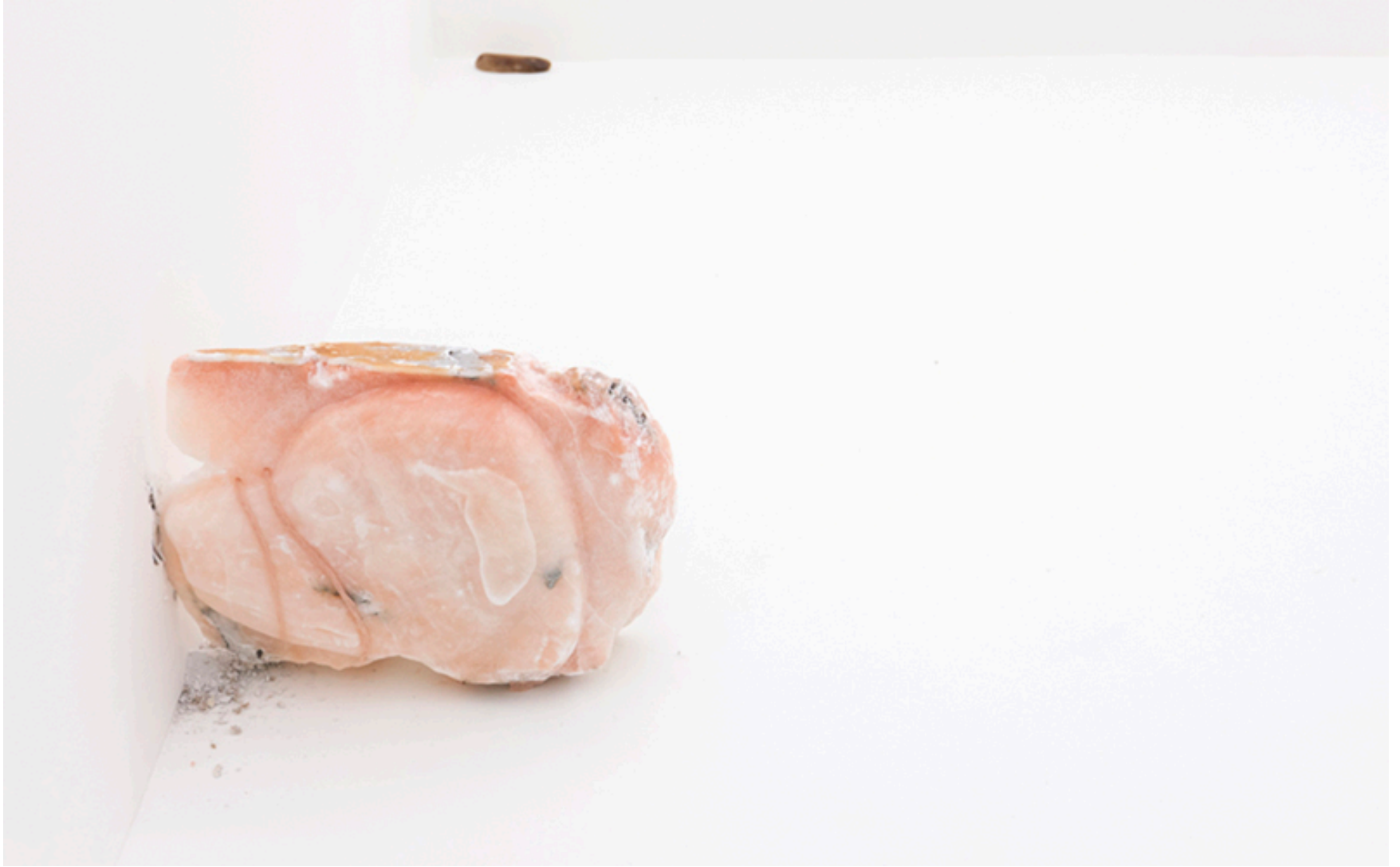
IS PATH WARM?, 2017 Installation view at Good Weather, Chicago