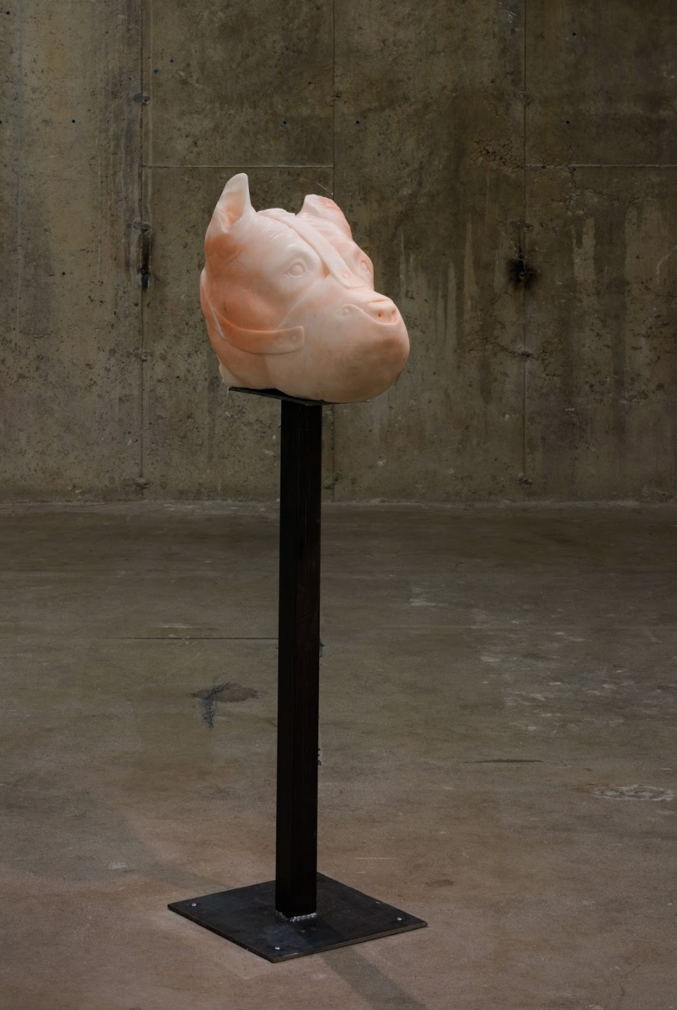
LIFEMORTS , 2017 Installation view at Interstate Project, New York