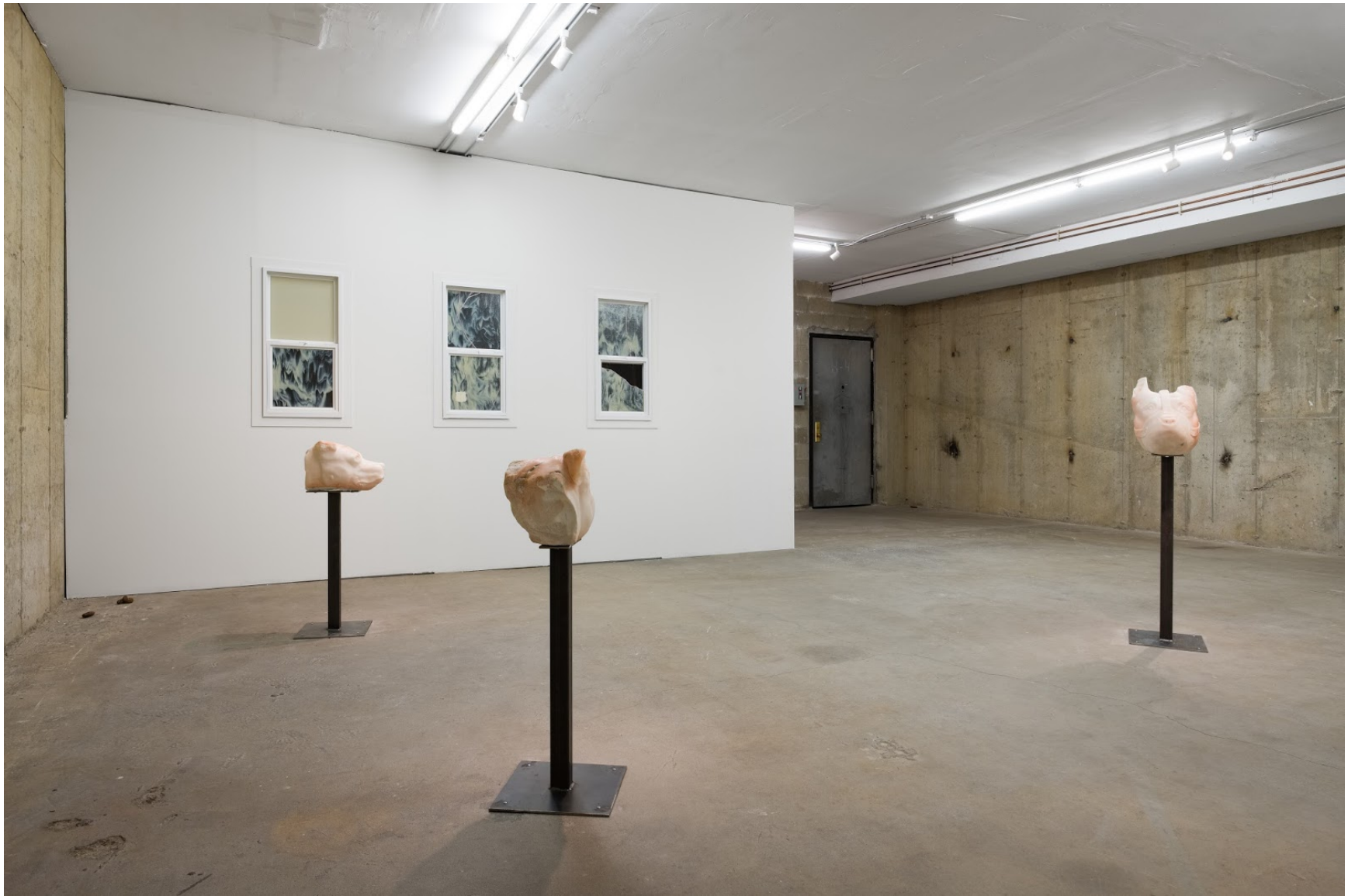
LIFEMORTS , 2017 Installation view at Interstate Project, New York