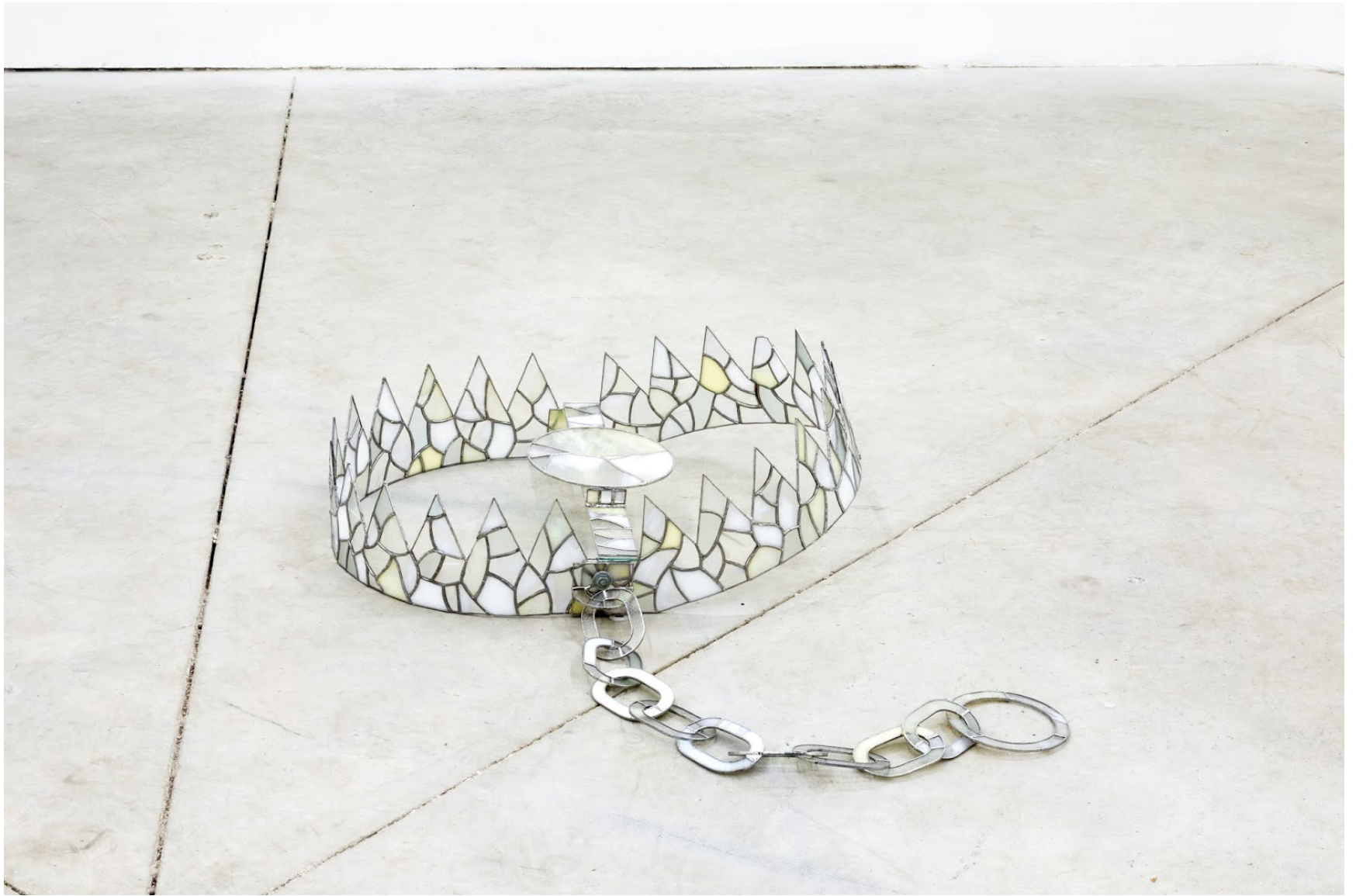
Head Gusset , 2019 Installation view at COOPER COLE, Toronto