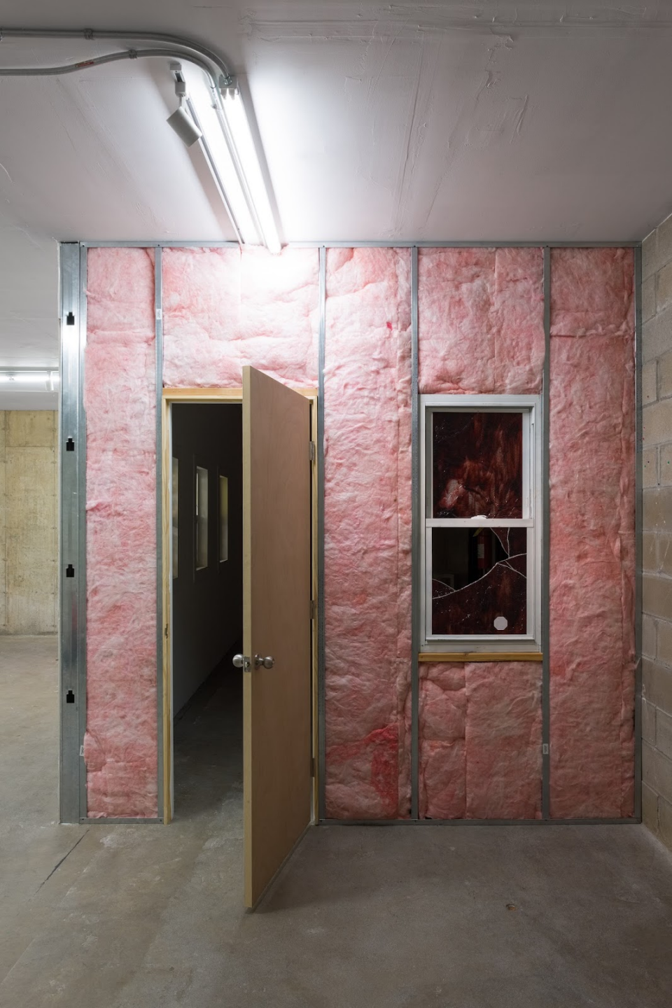
LIFEMORTS , 2017 Installation view at Interstate Project, New York