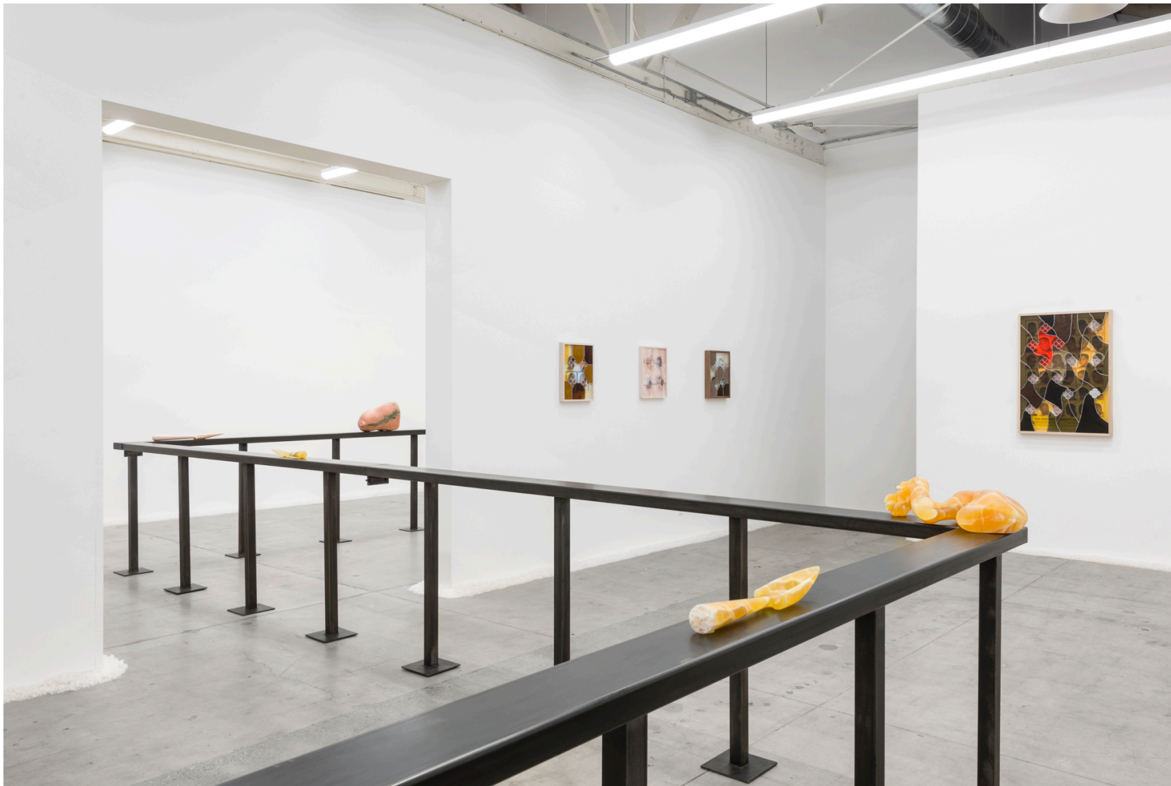
My Volition , 2022 Installation view at Matthew Brown Gallery, Los Angeles