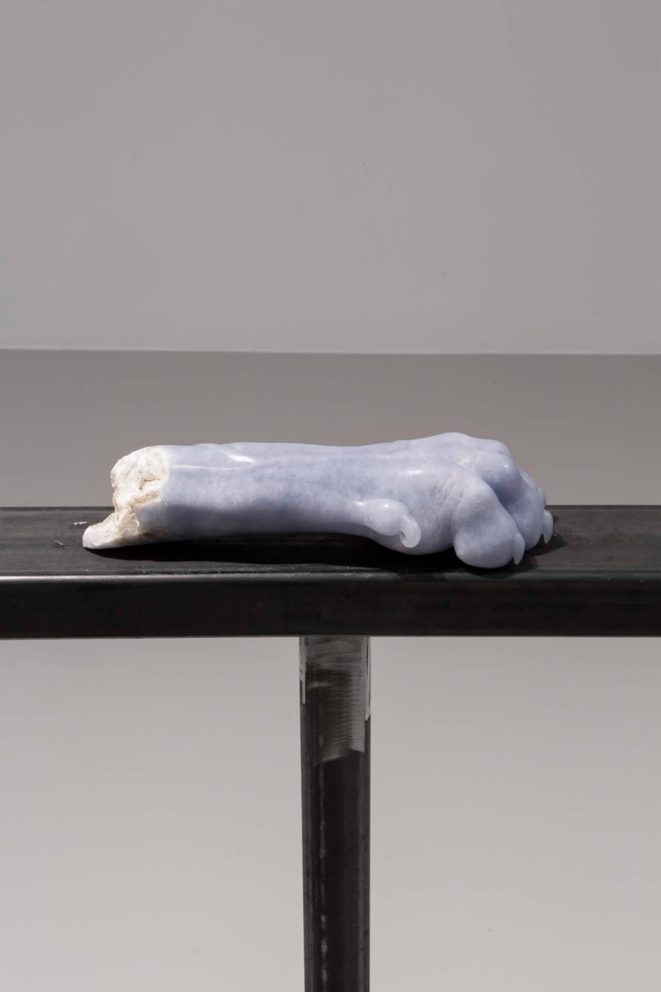
PLEDGE , 2019 Installation view at Company Gallery, New York