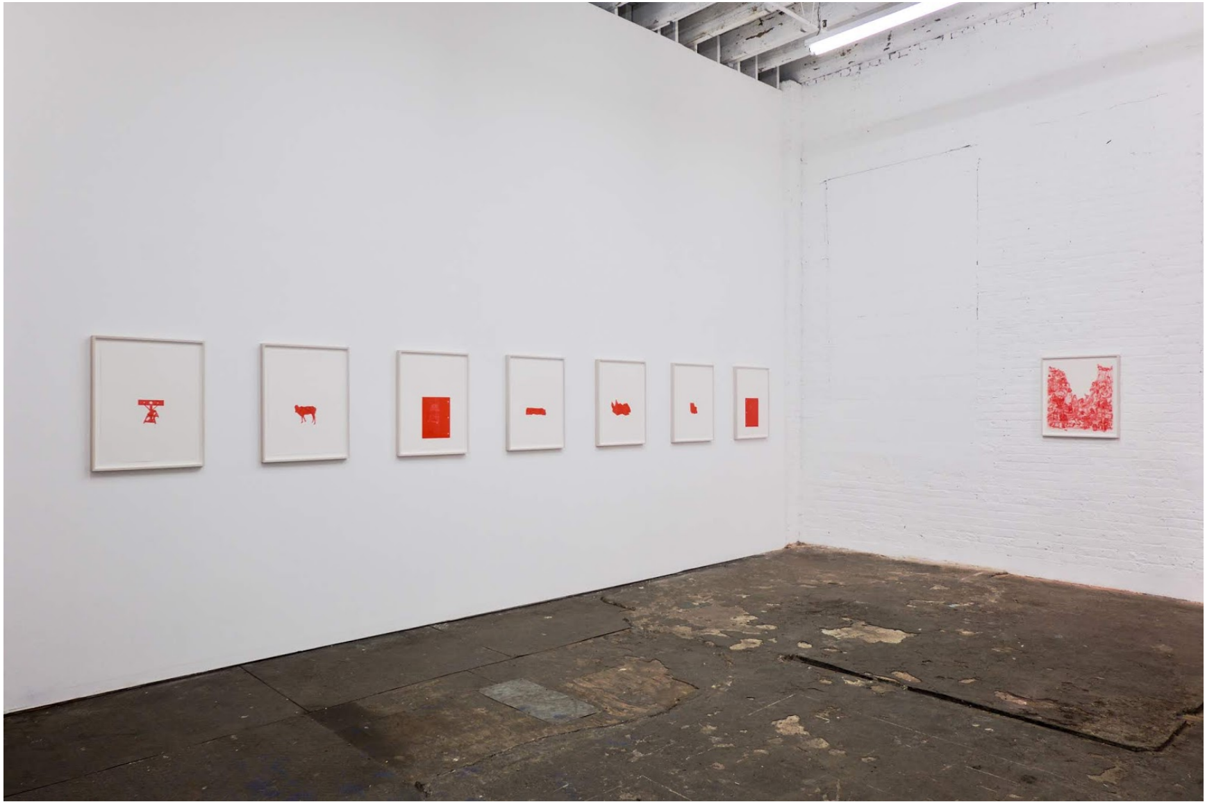
Pastoral Emergency , , 2018 Installation view at SIGNAL, New York