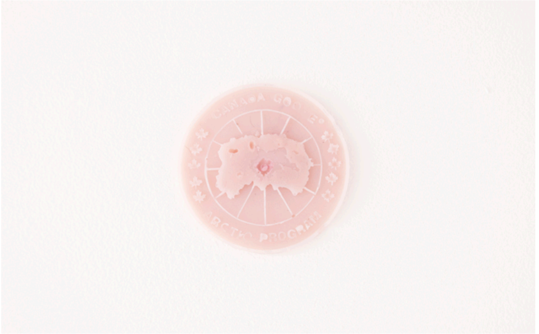
IS PATH WARM?, 2017 Installation view at Good Weather, Chicago