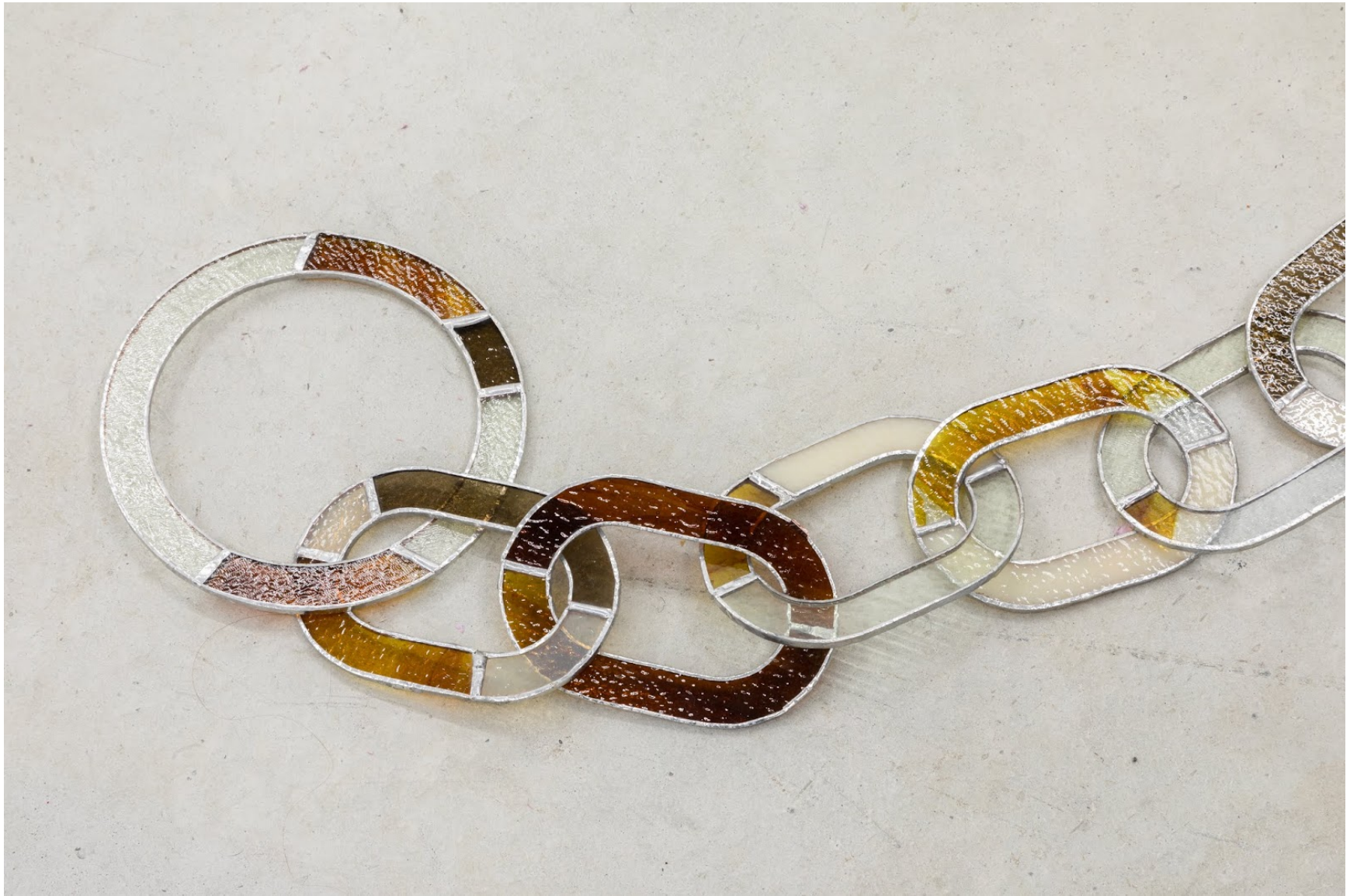
Head Gusset , 2019 Installation view at COOPER COLE, Toronto