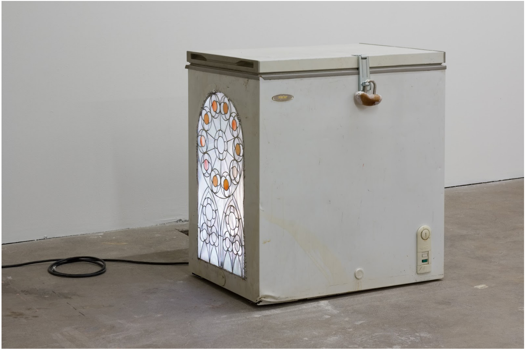
LIFEMORTS , 2017 Installation view at Interstate Project, New York