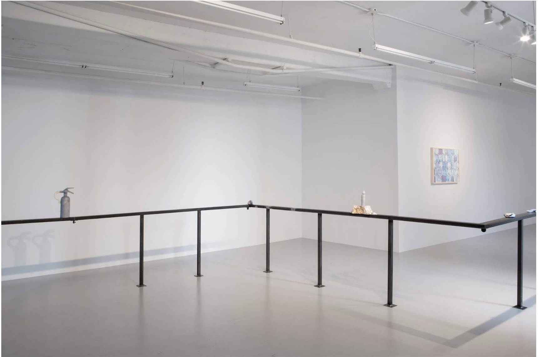
PLEDGE , 2019 Installation view at Company Gallery, New York