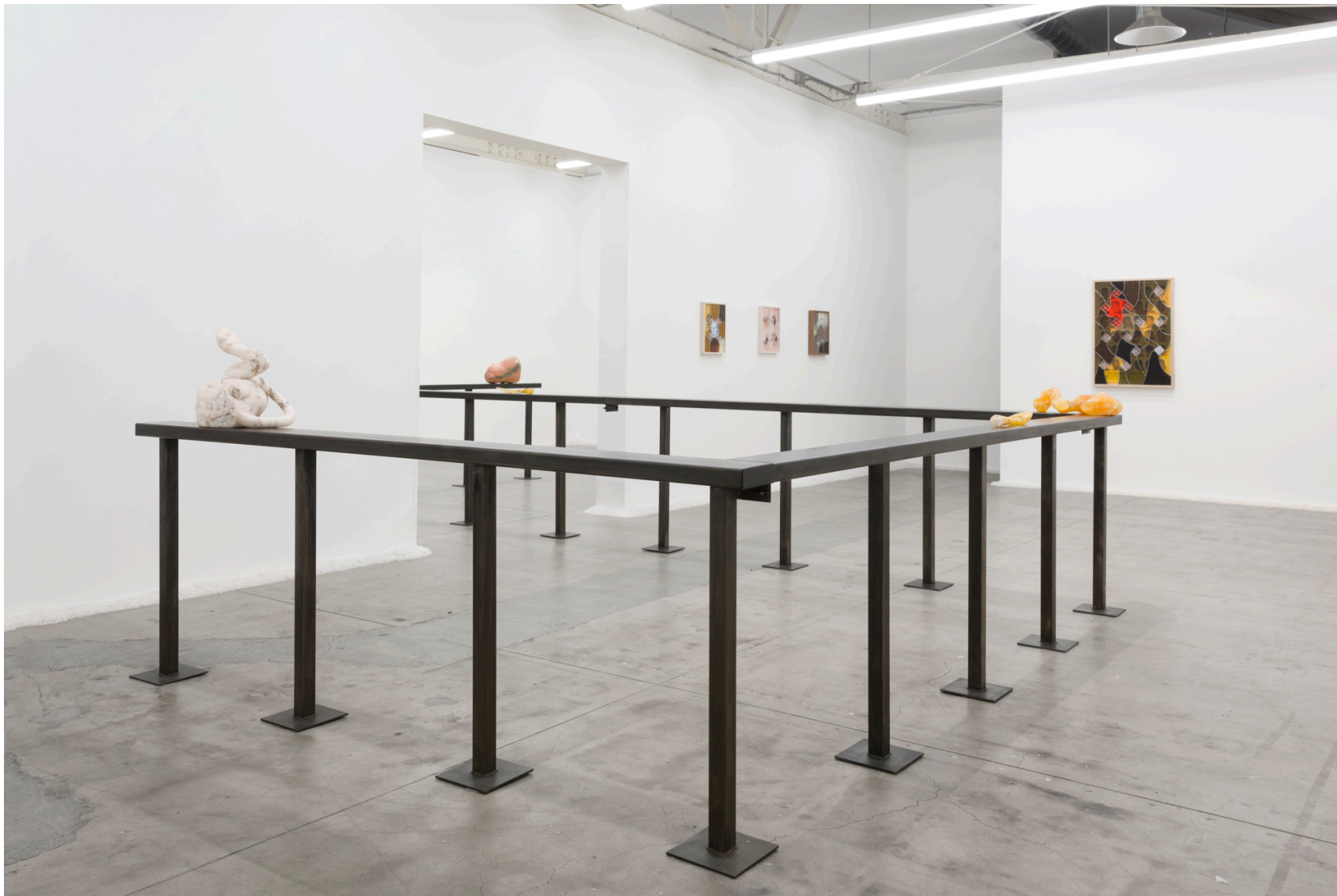
My Volition , 2022 Installation view at Matthew Brown Gallery, Los Angeles