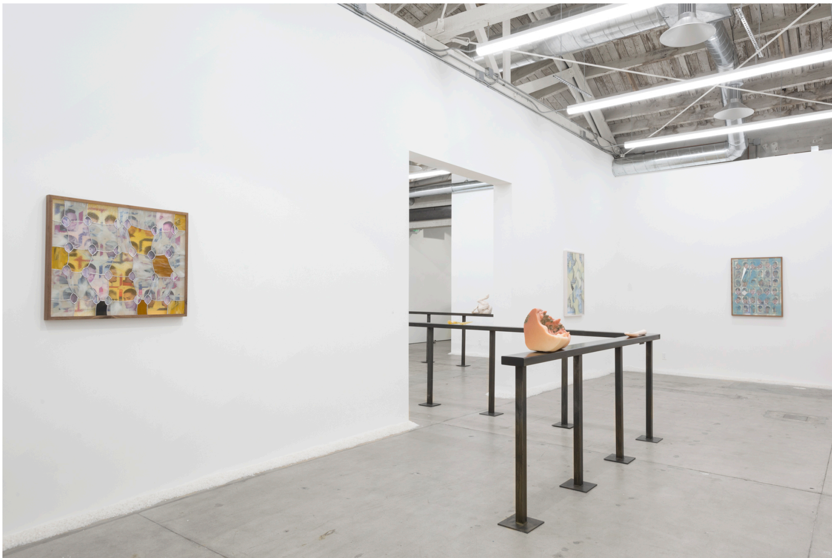
My Volition , 2022 Installation view at Matthew Brown Gallery, Los Angeles