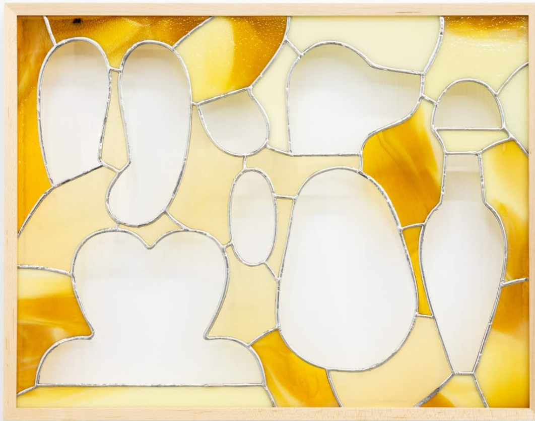
Head Gusset , 2019 Installation view at COOPER COLE, Toronto