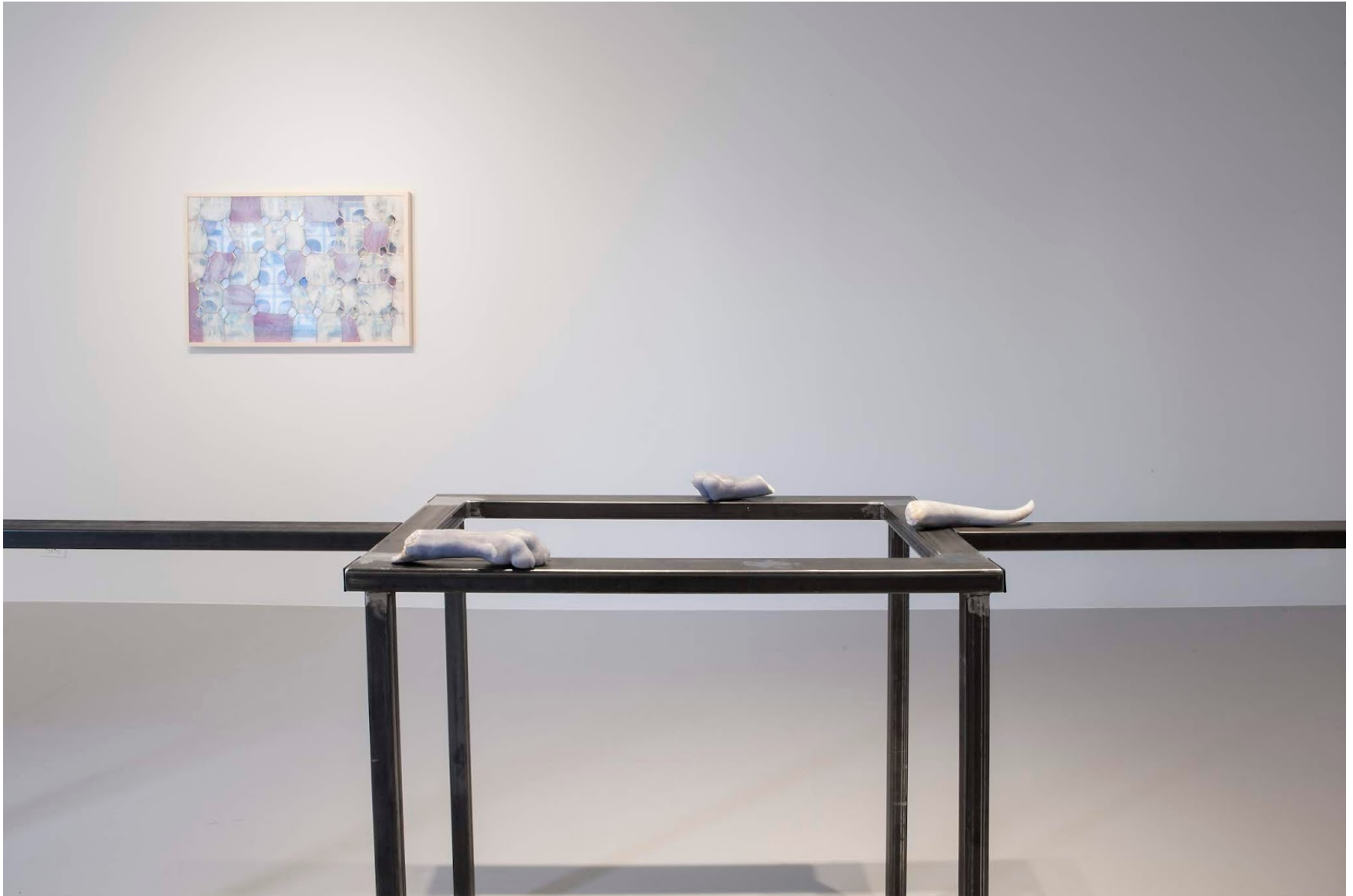
PLEDGE , 2019 Installation view at Company Gallery, New York